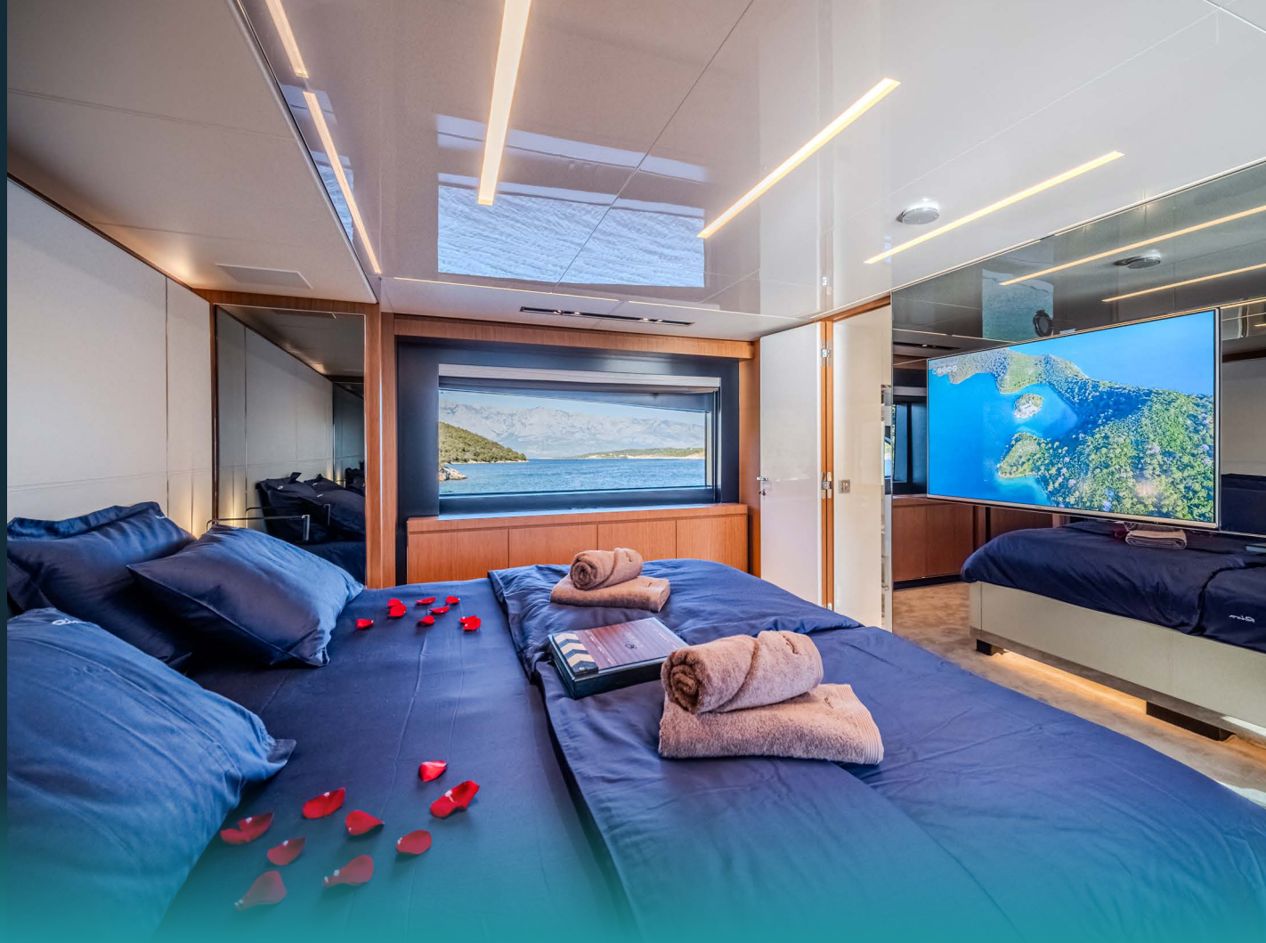
Master cabin side view