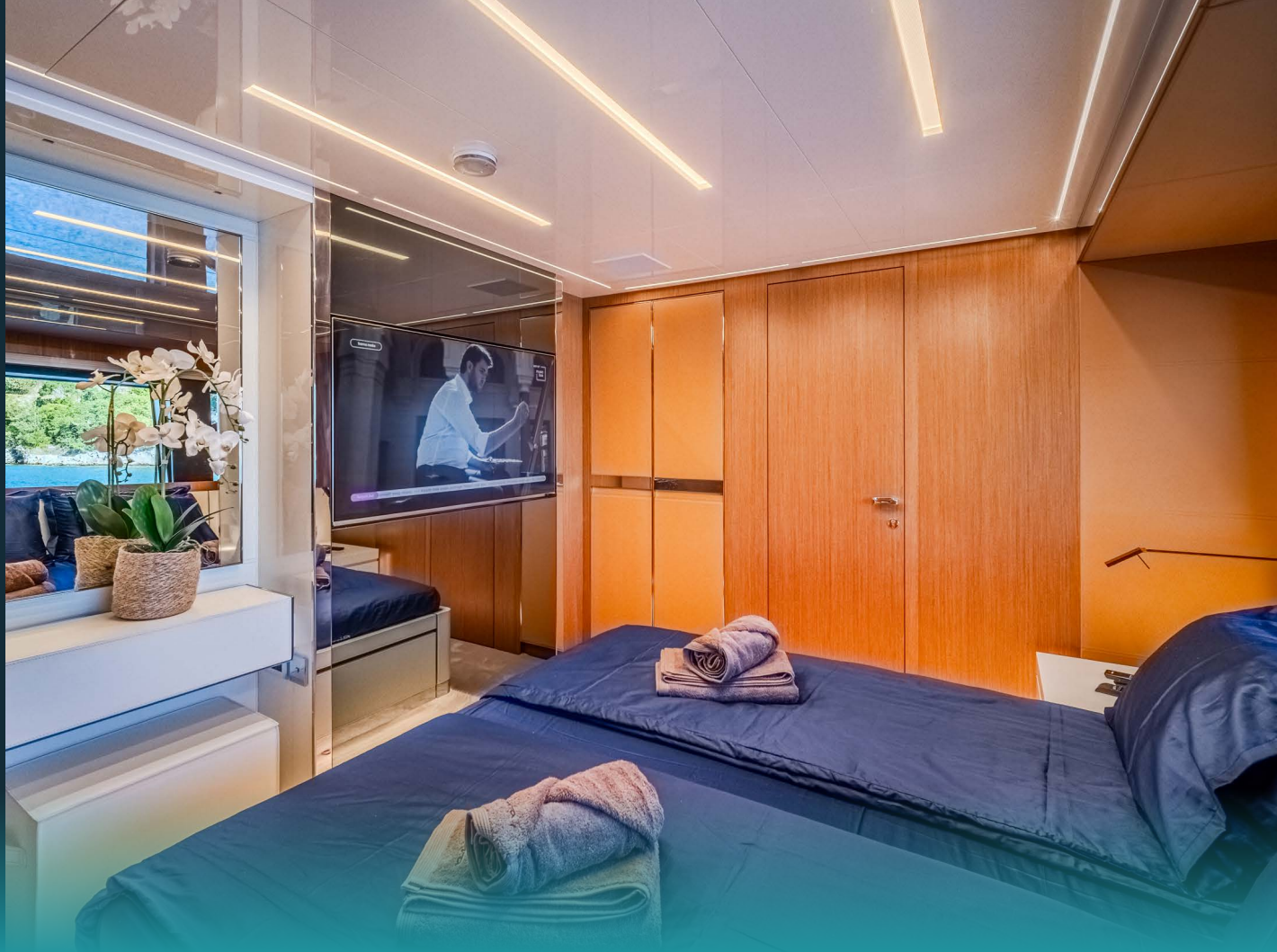
Double cabin side view