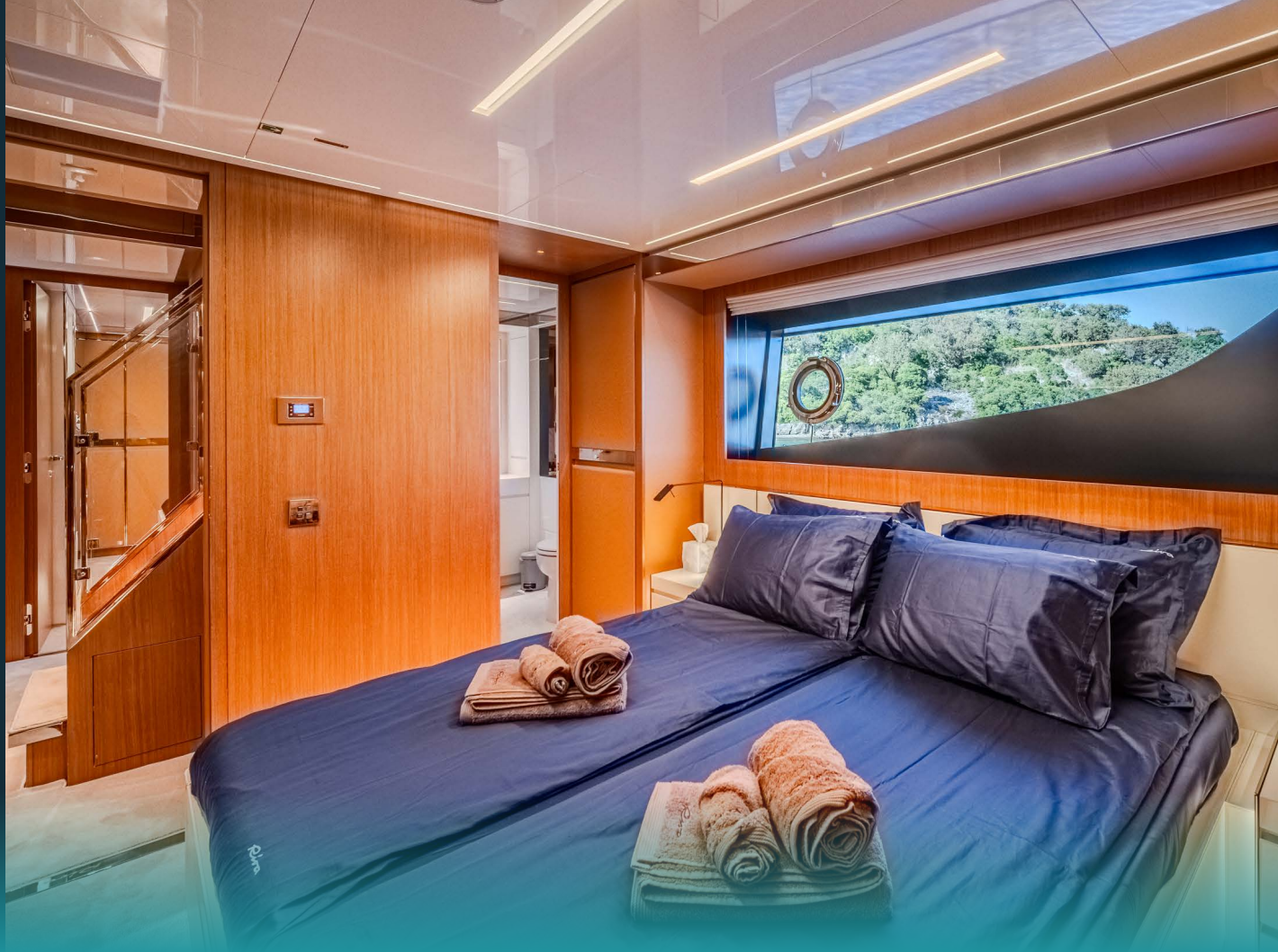
Double cabin 3