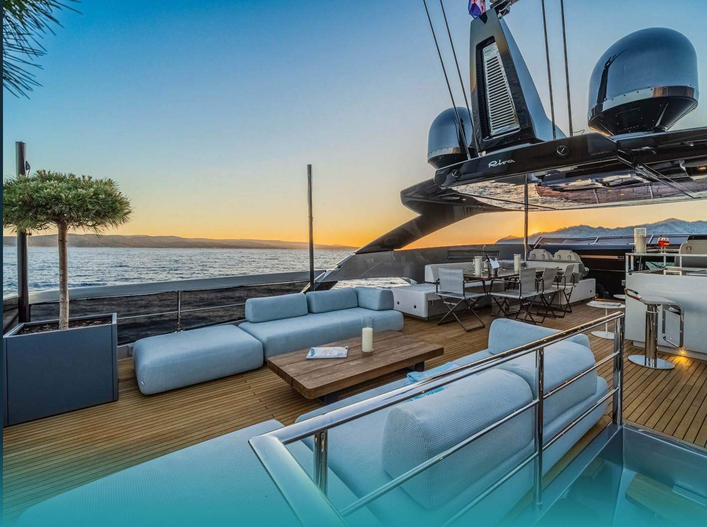
Flybridge dining area