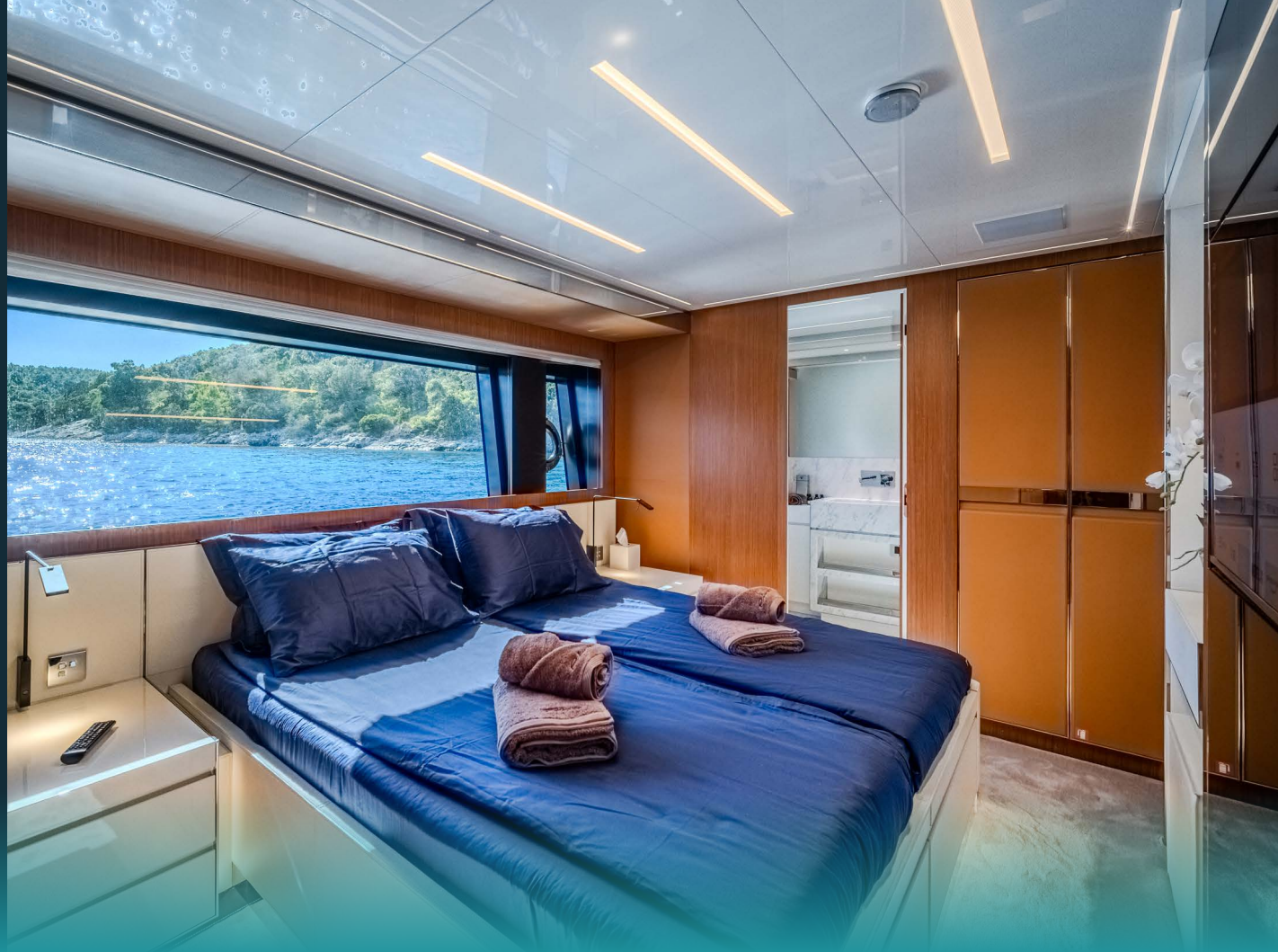
Double cabin 2