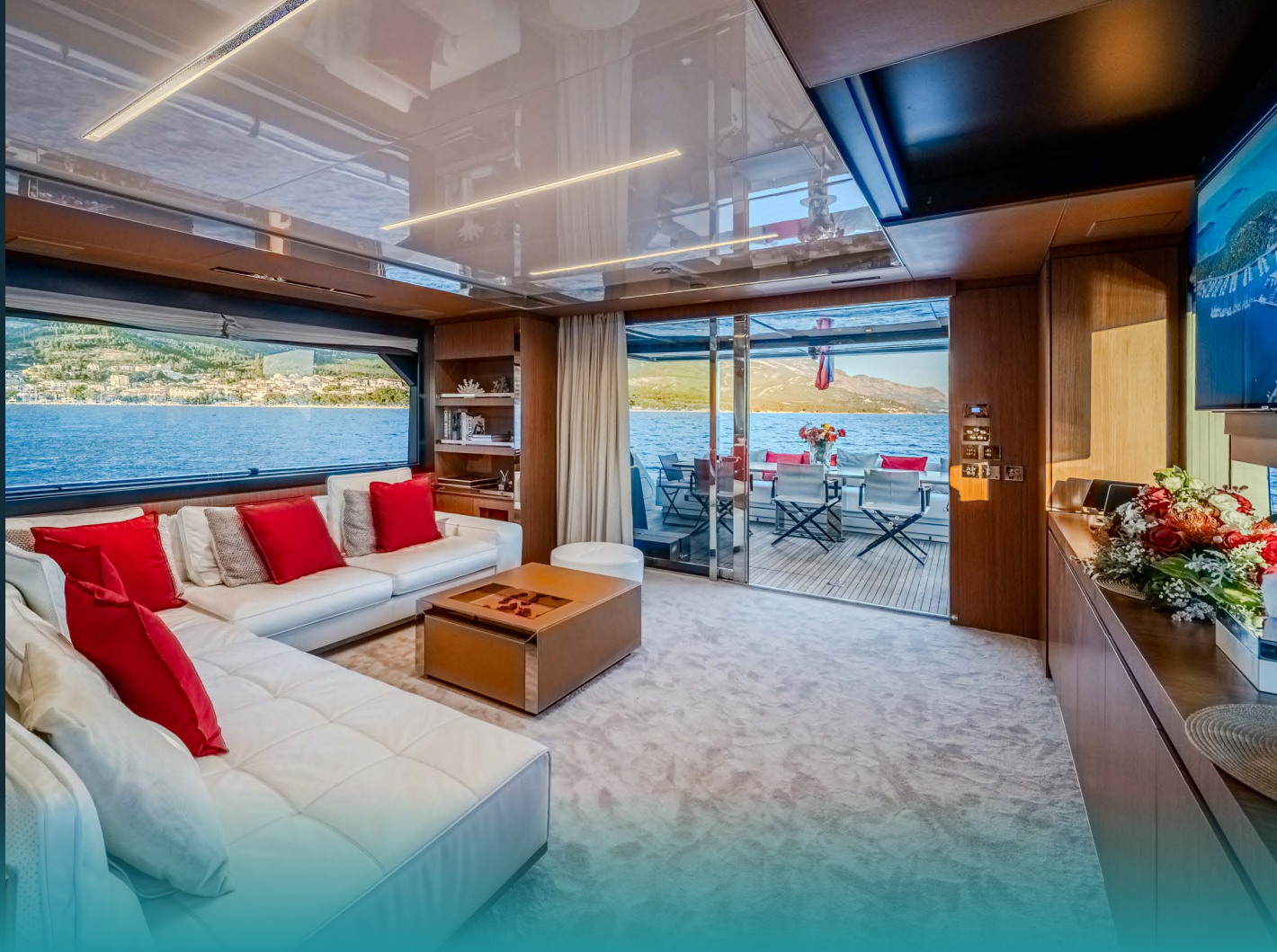
Salon side view