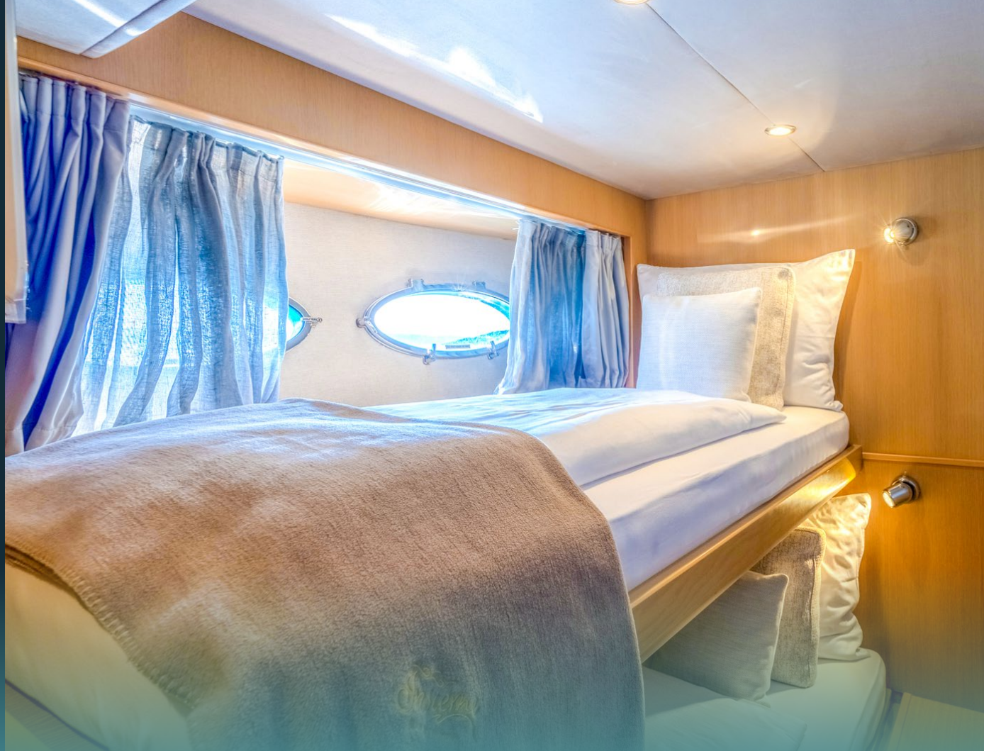
Bunk bed cabin