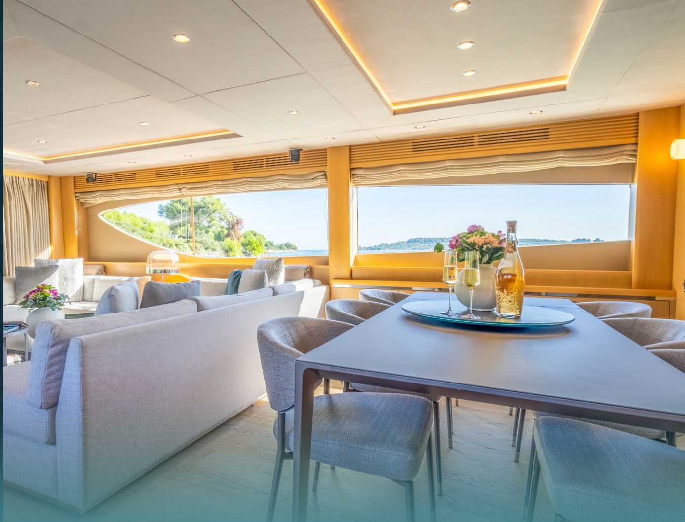
Salon dining area