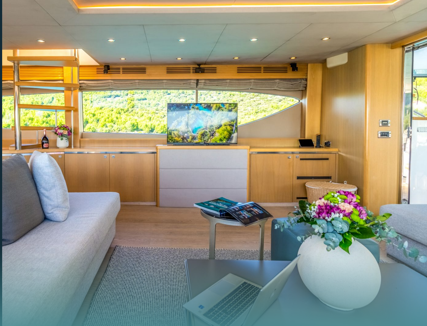
salon side view