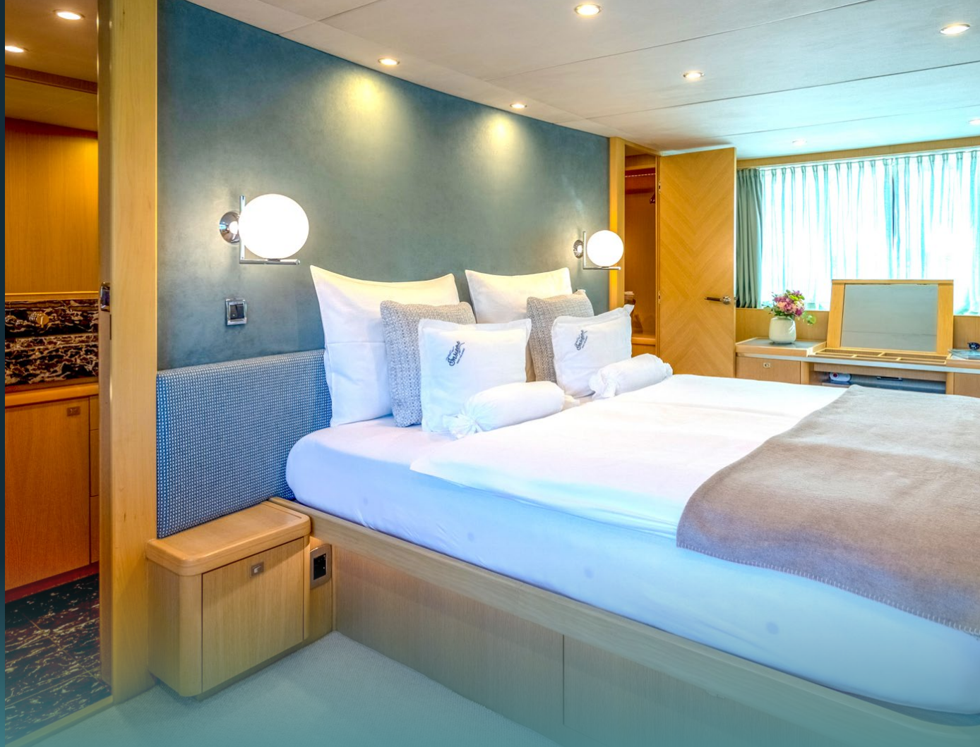
Master cabin side view