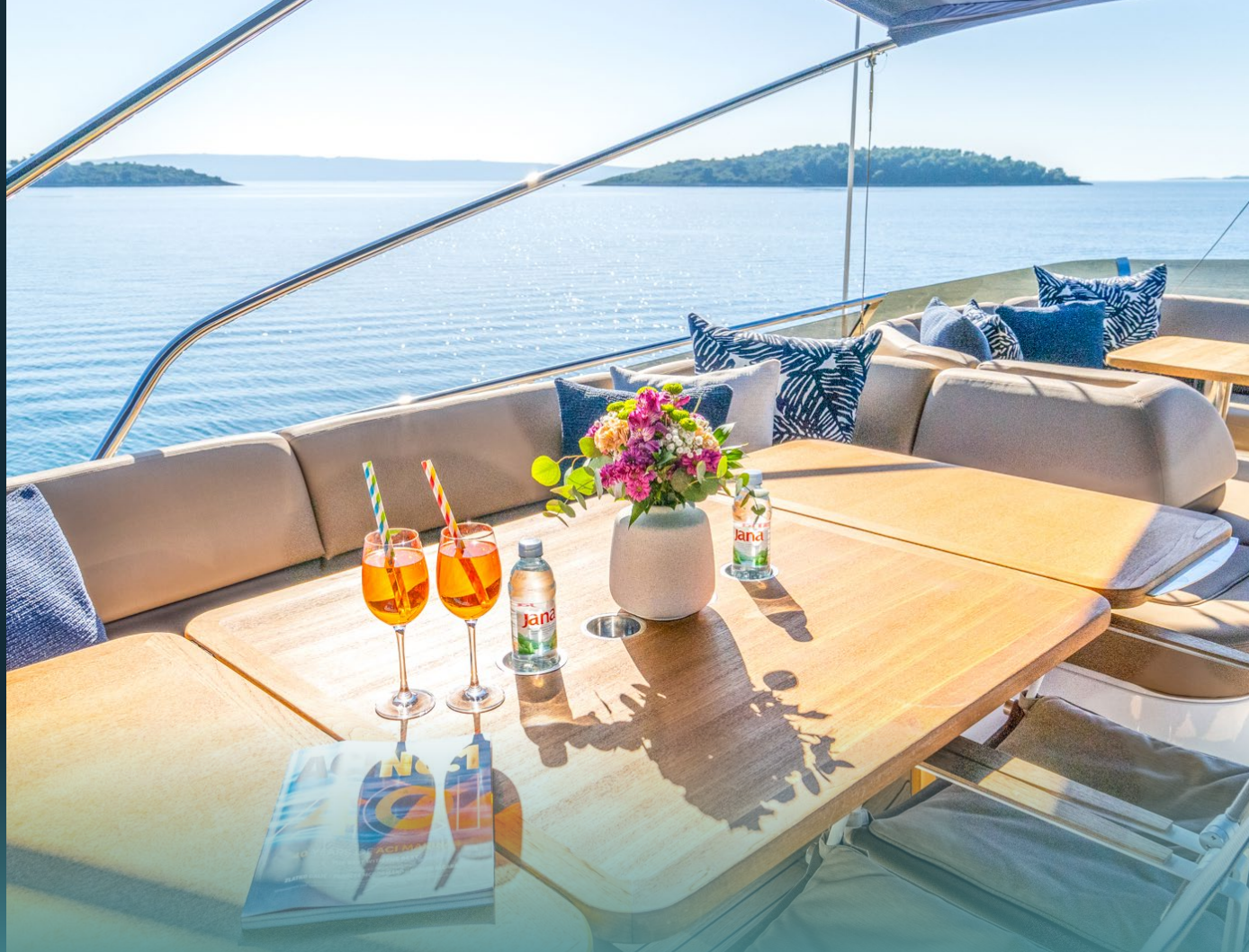
Sundeck dining area