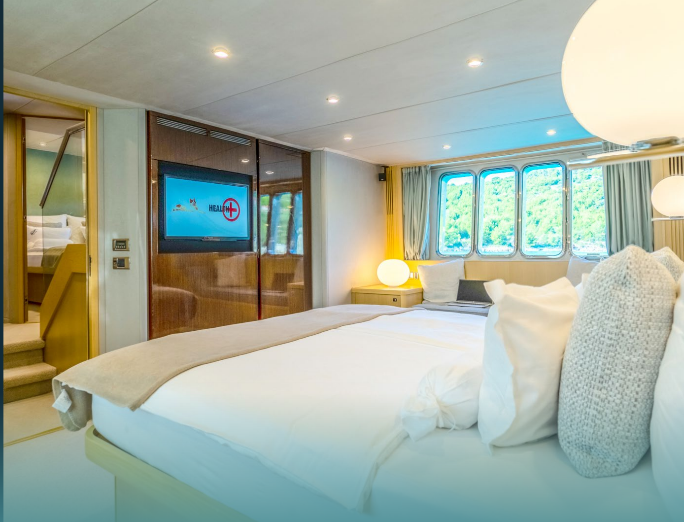
Master cabin view