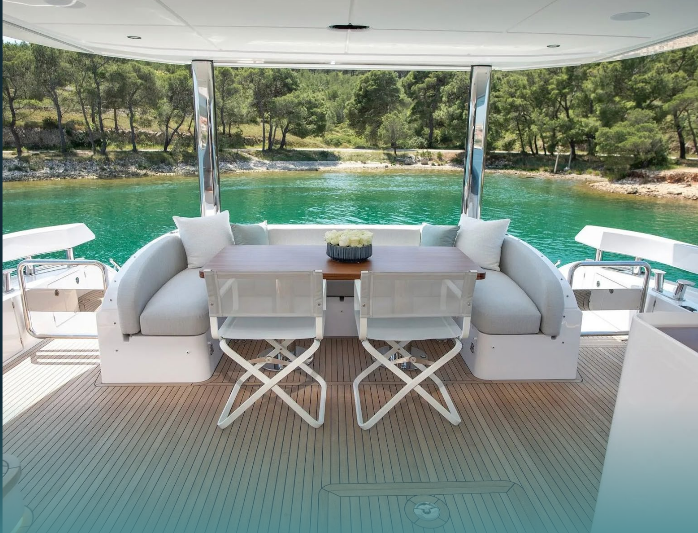
Outdoor dining table