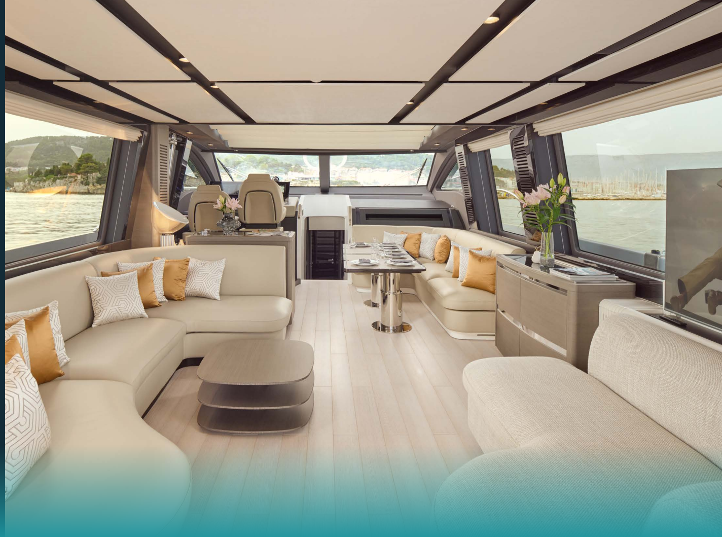
Interior seating front view