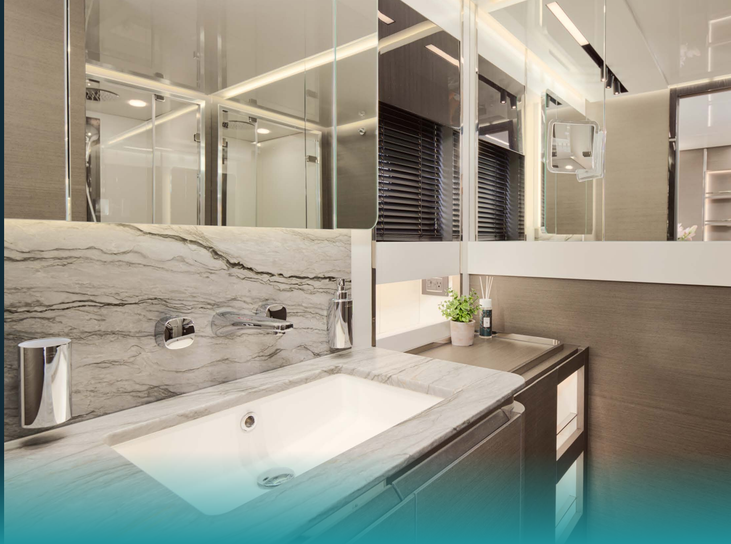
Master bedroom bathroom interior