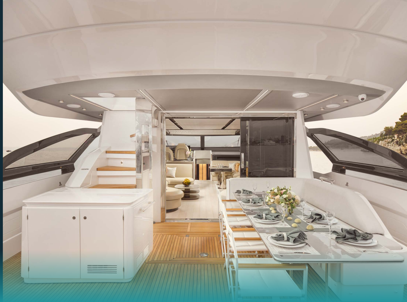
Table setting aft