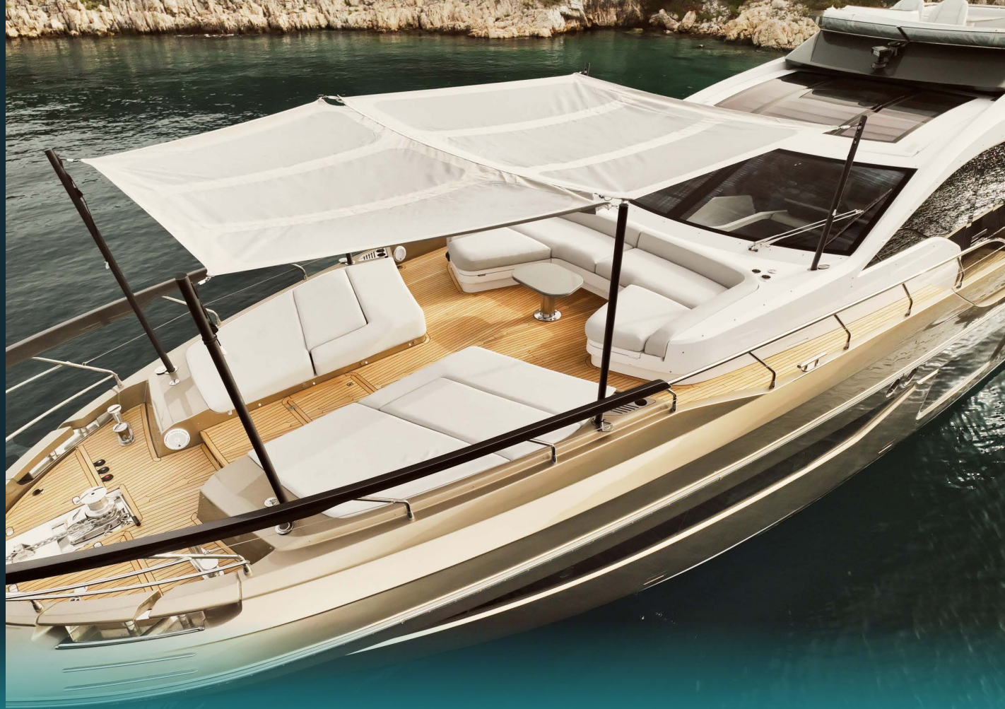
Awning port side