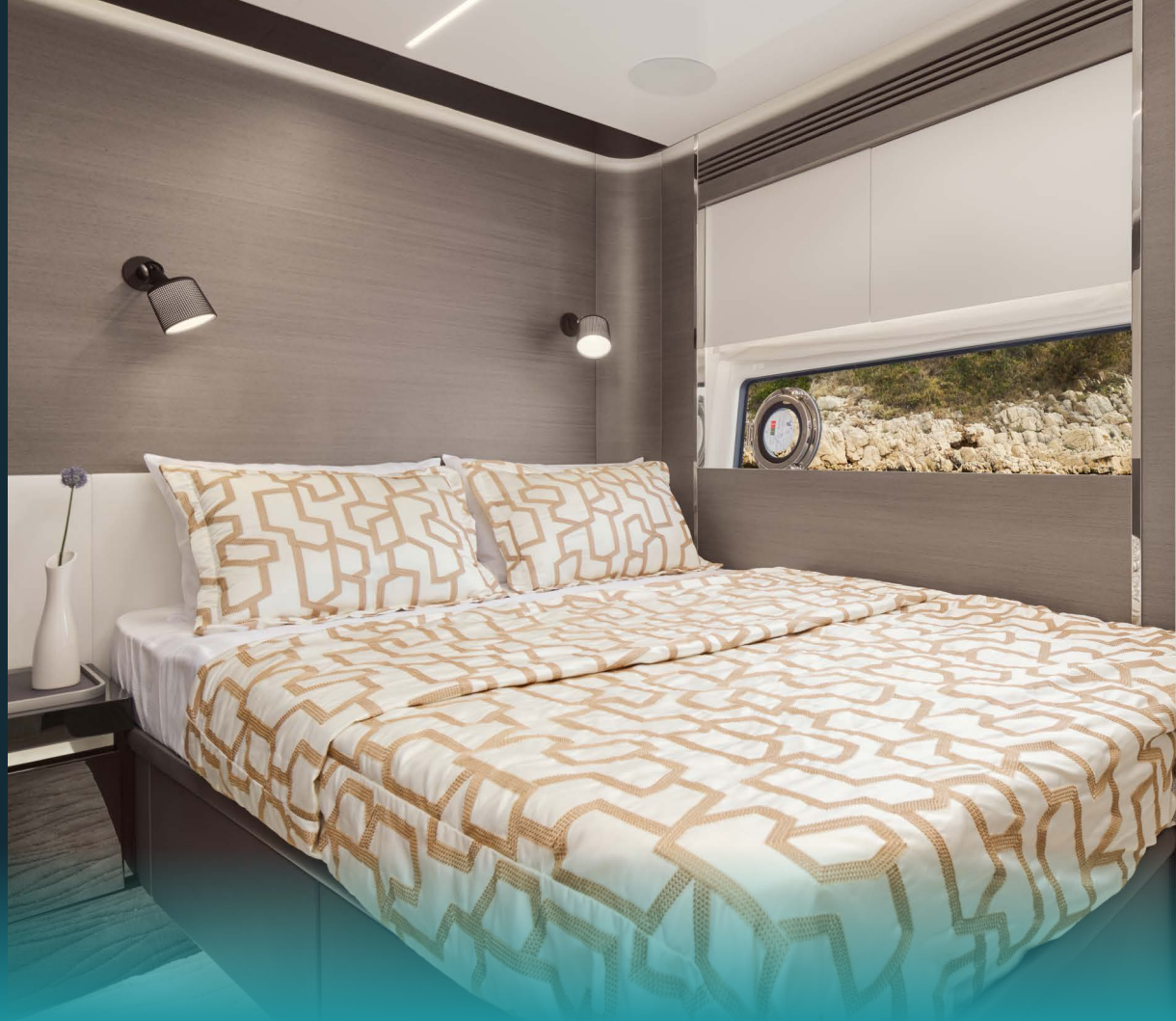
Double bedroom side view