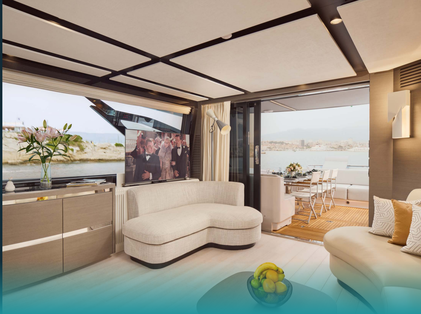
Interior aft view