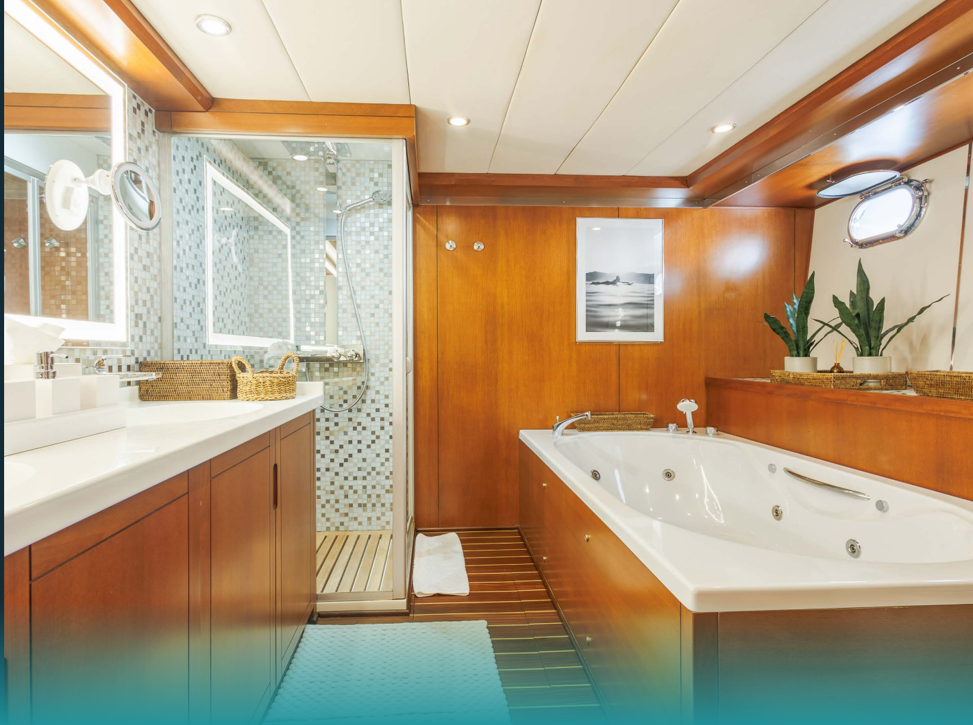
Master cabin bathroom