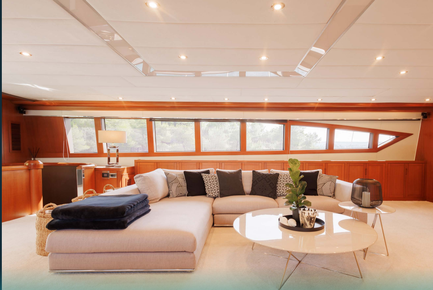
Salon side view