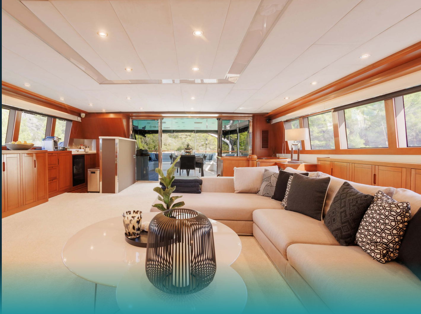
Salon view towards stern