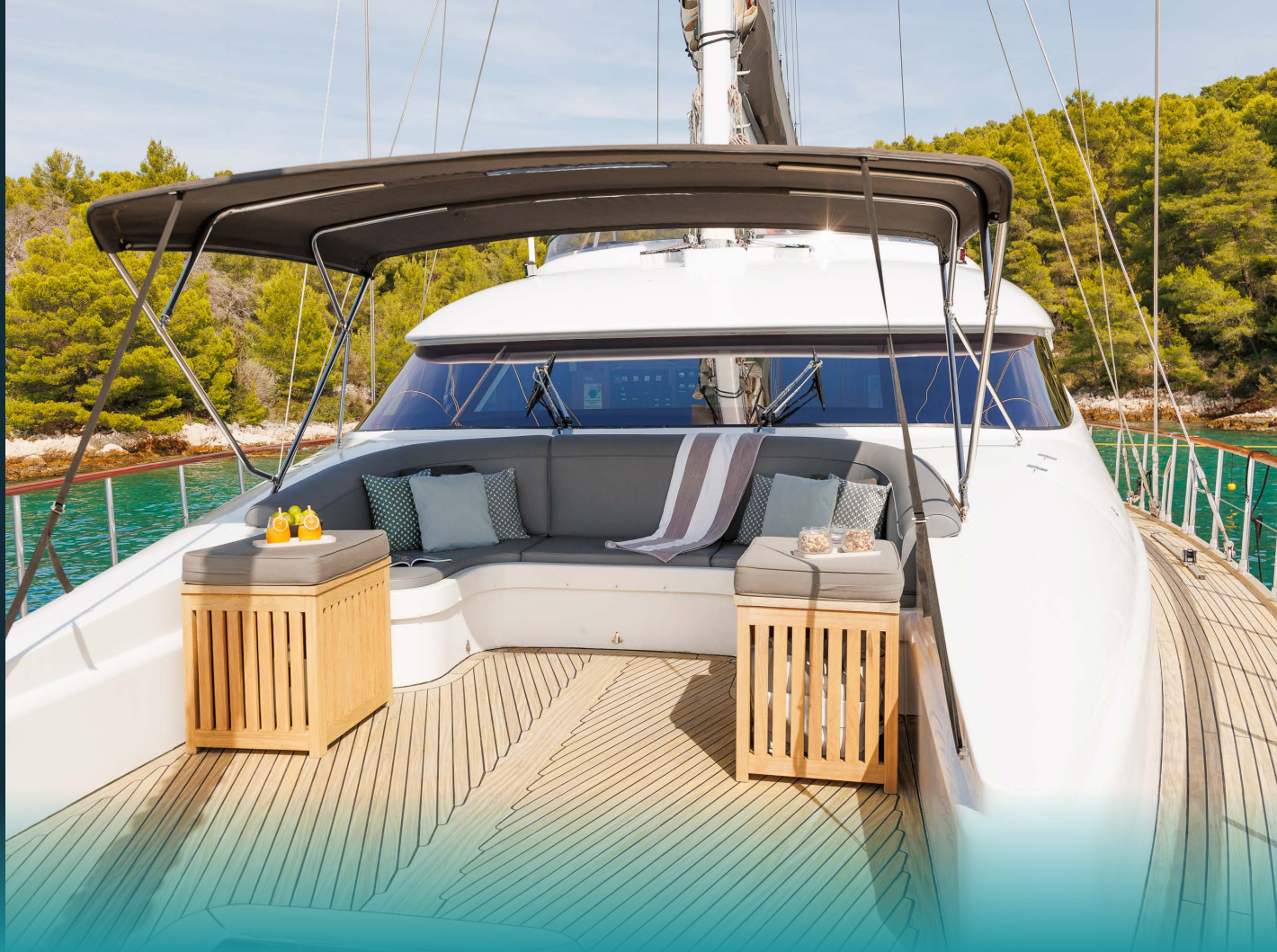
Bow lounge area