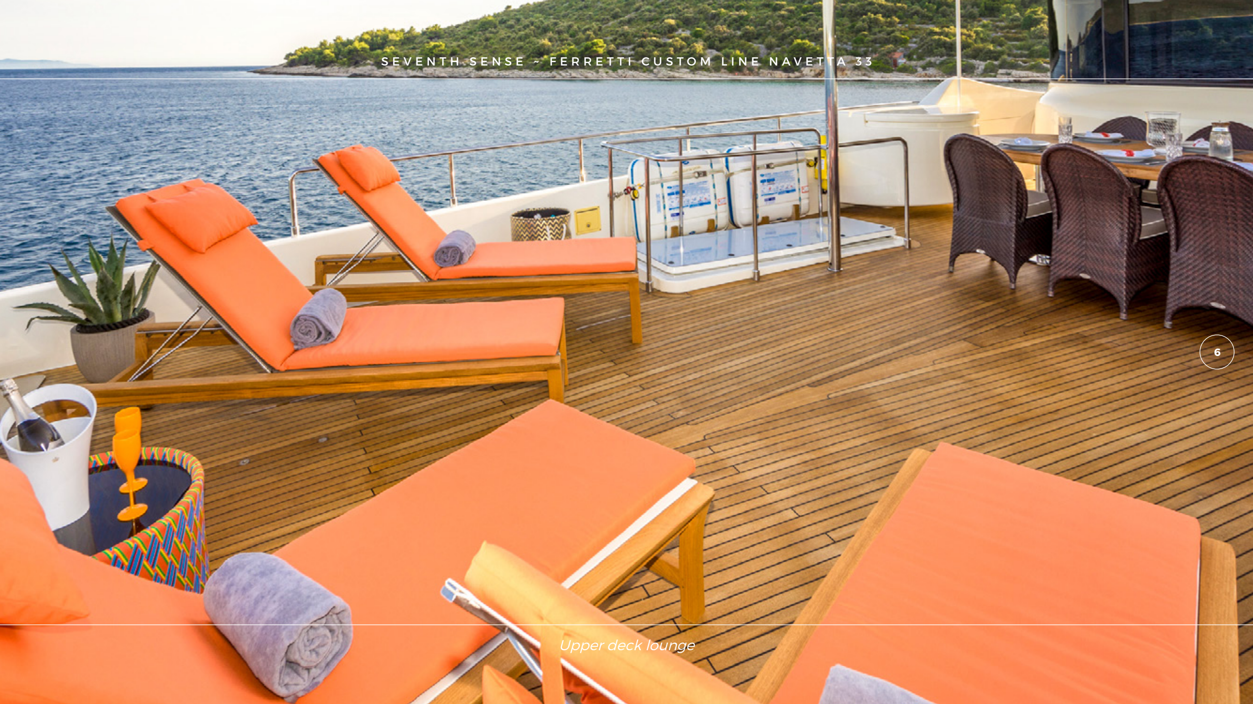
Upper deck lounge