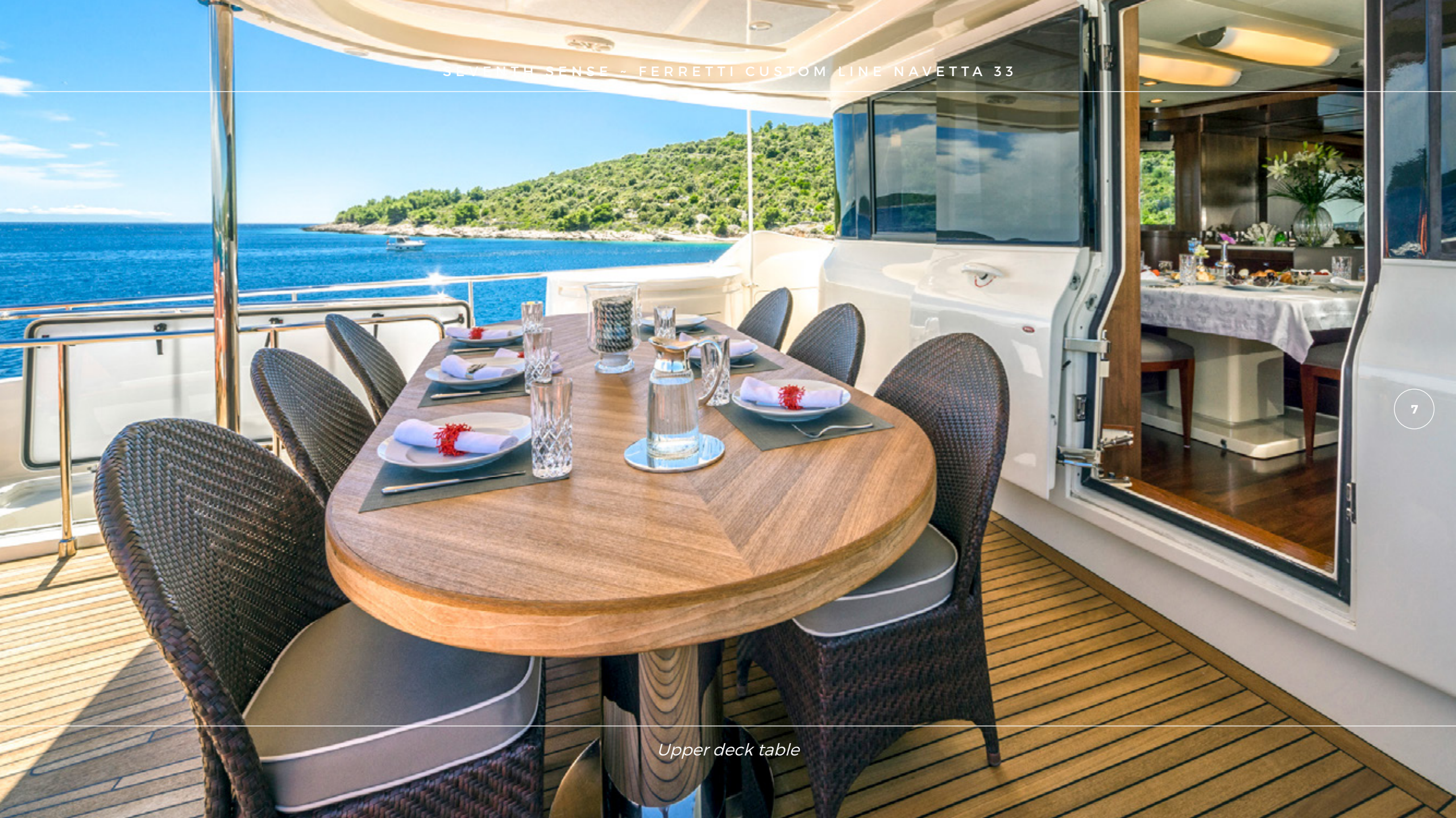
Upper deck table