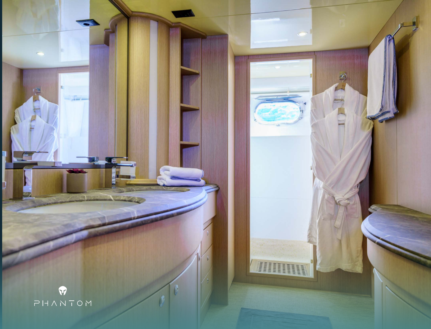
Master bathroom view