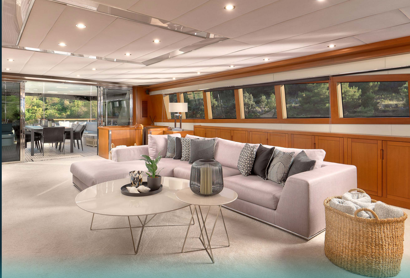
Salon side view