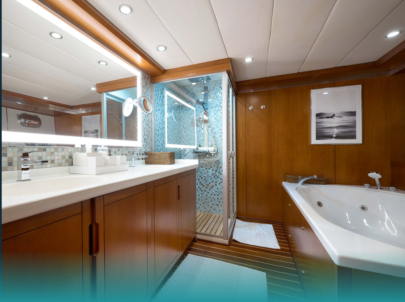
Master cabin bathroom