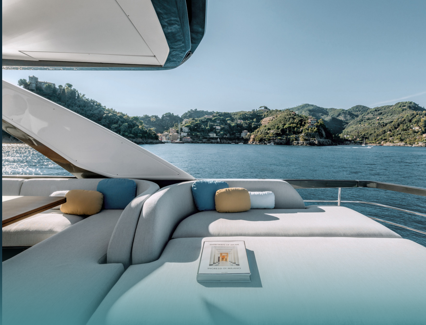
Flybridge sitting area