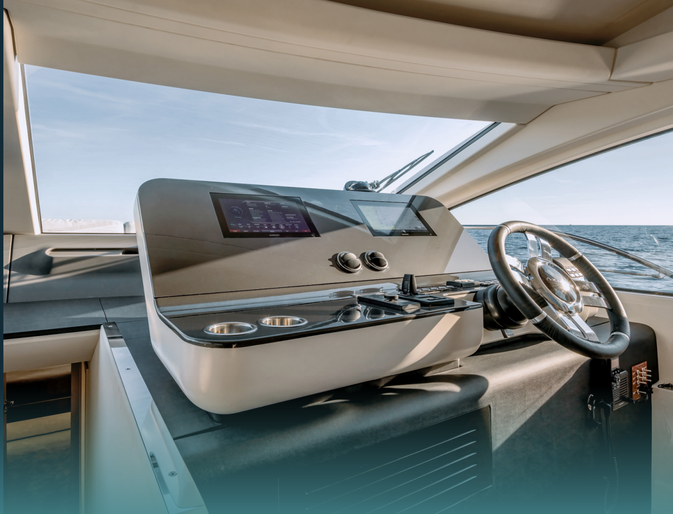
Interior helm station