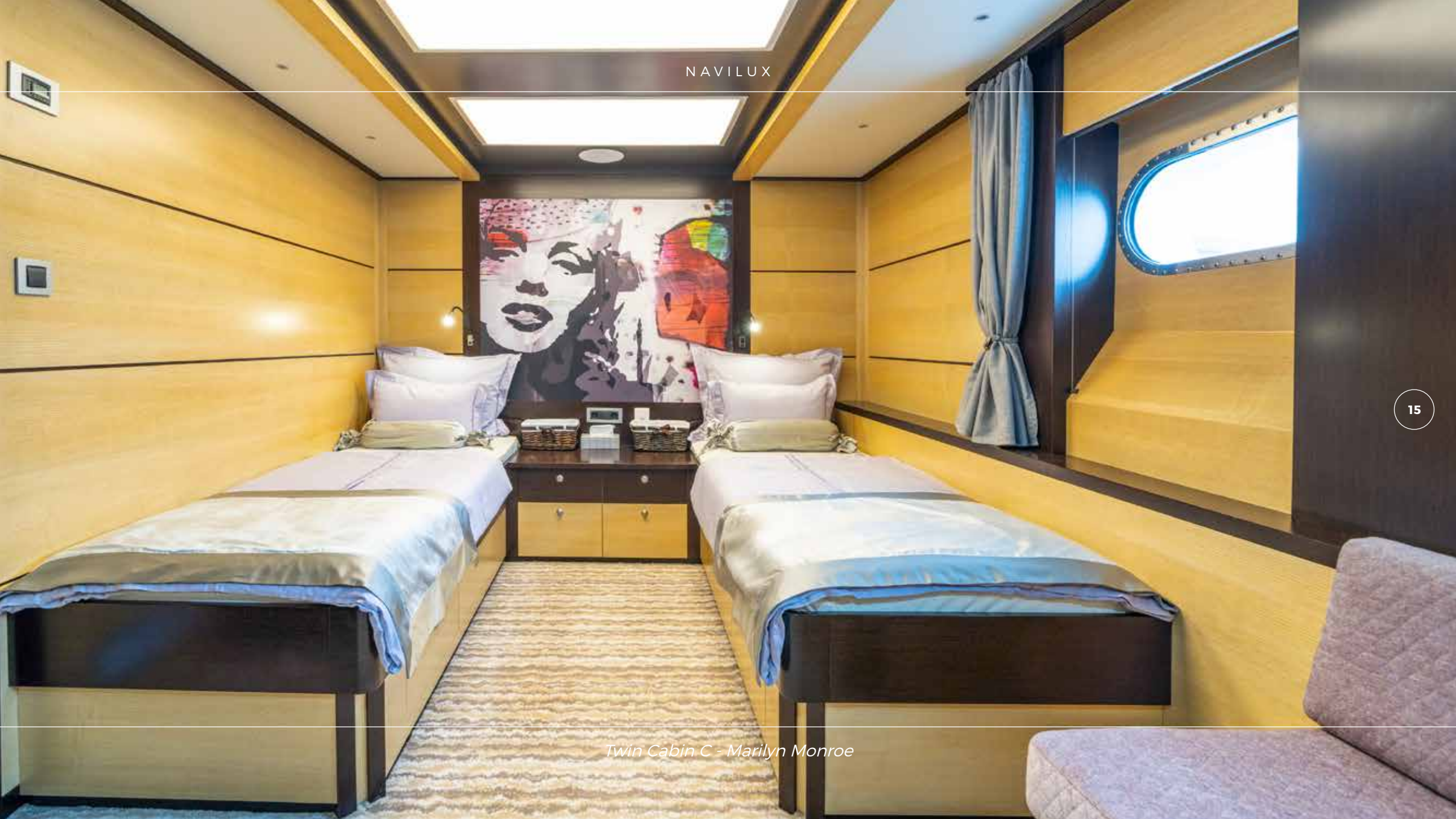
Twin Cabin C - Marilyn Monroe