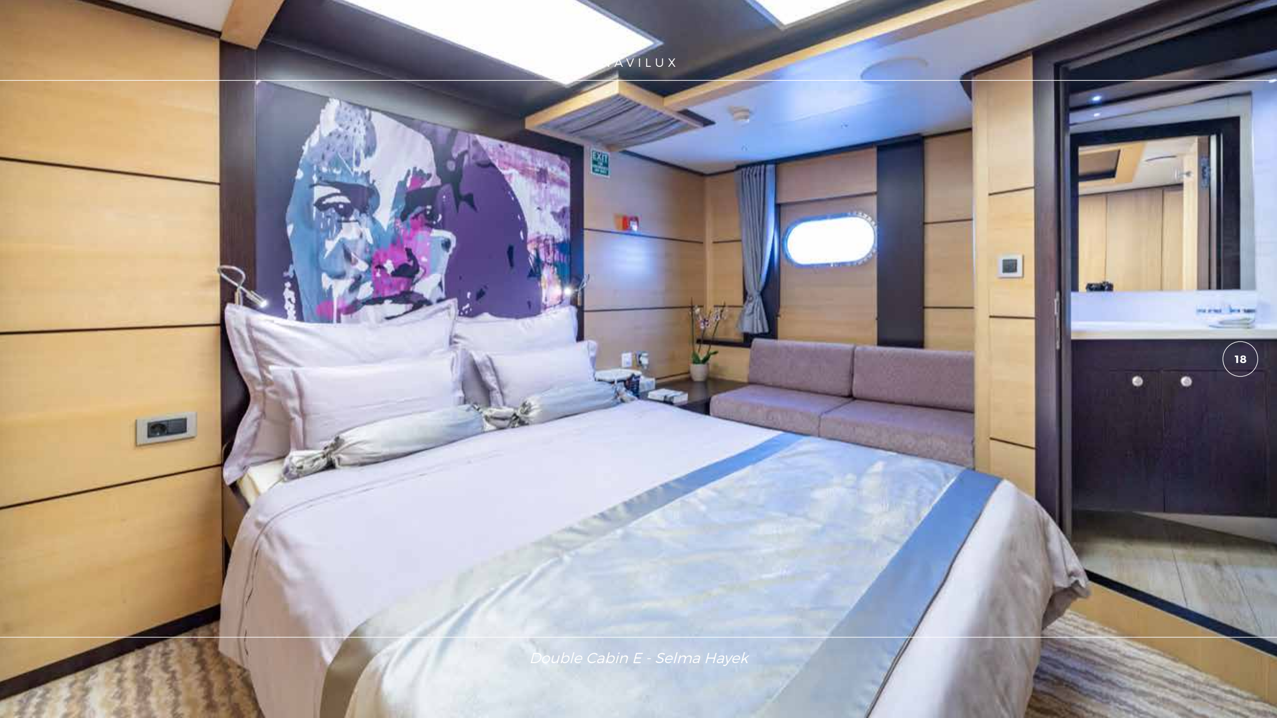
Double Cabin E - Selma Hayek