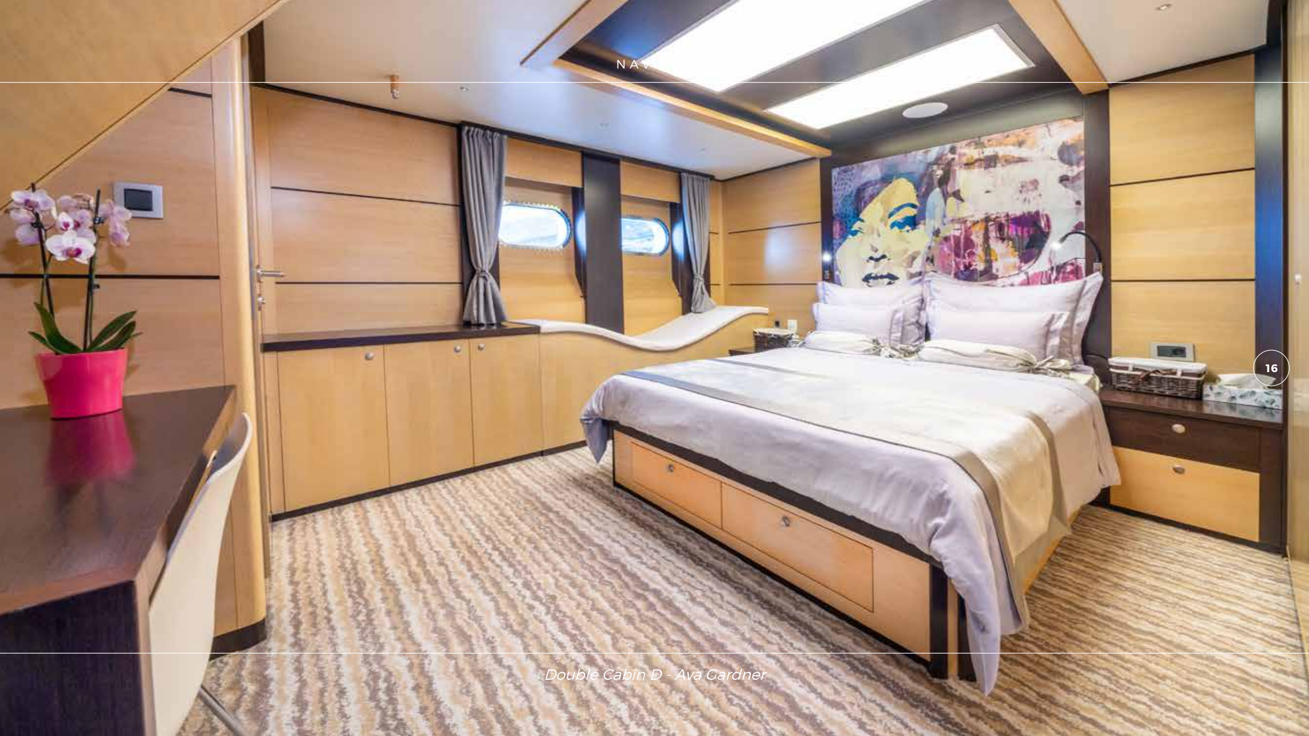
Double Cabin D - Ava Gardner