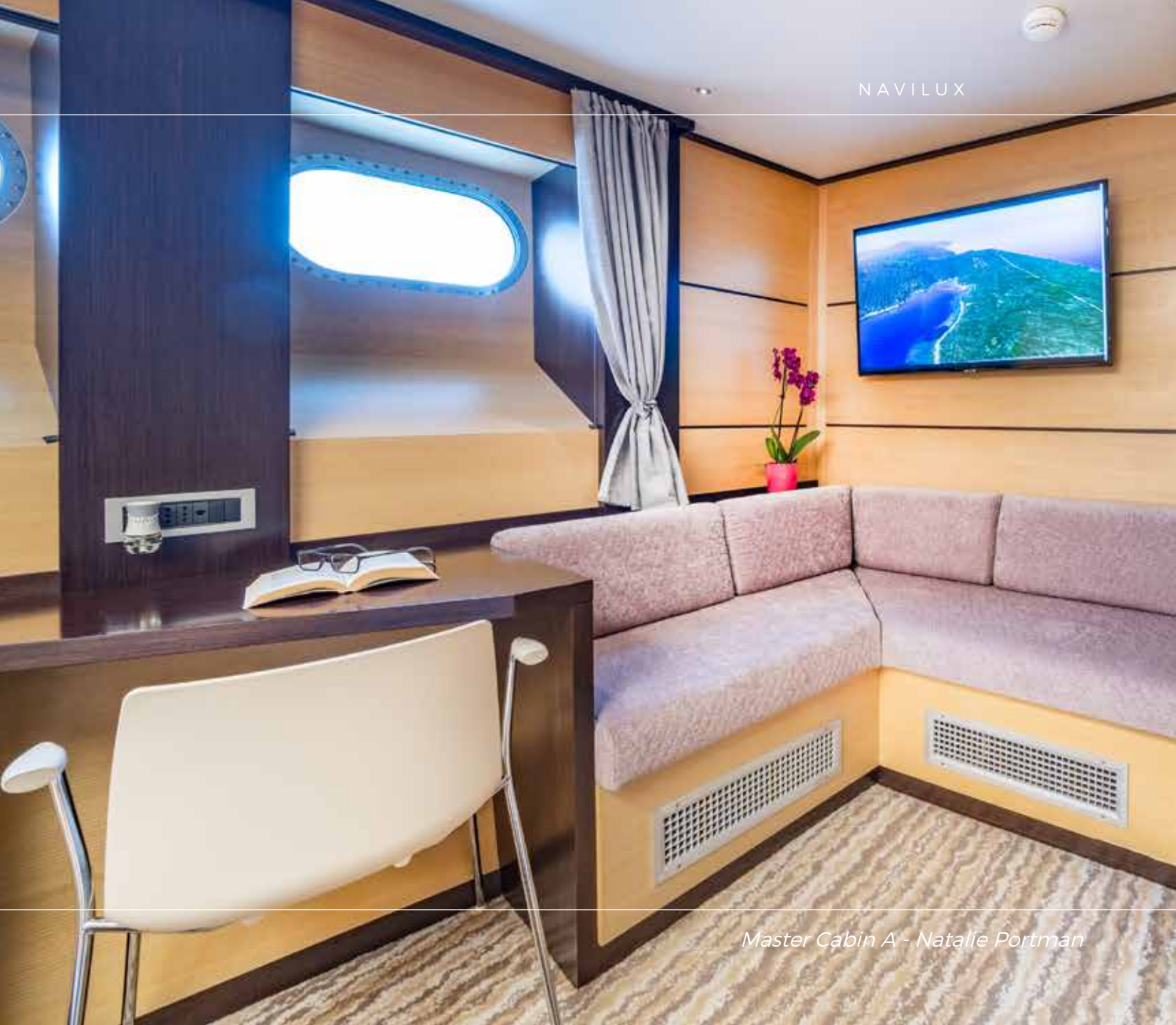
Master Cabin A - Natalie Portman