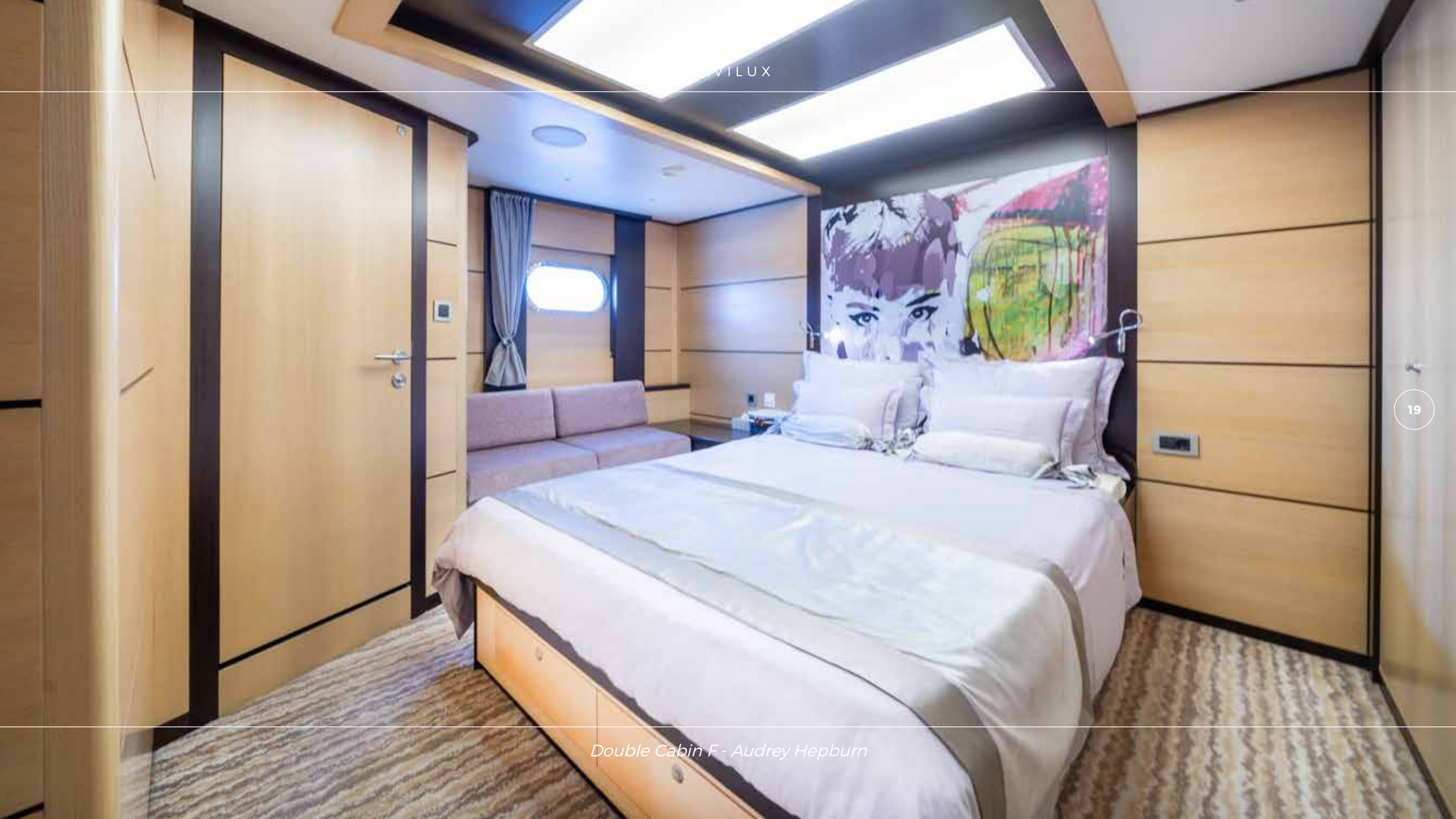
Double Cabin F - Audrey Hepburn