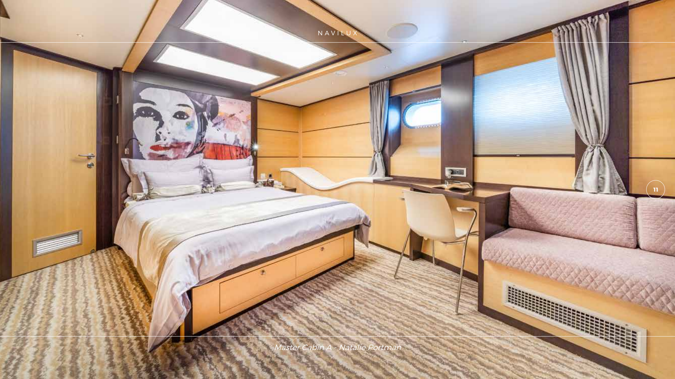
Master Cabin A - Natalie Portman