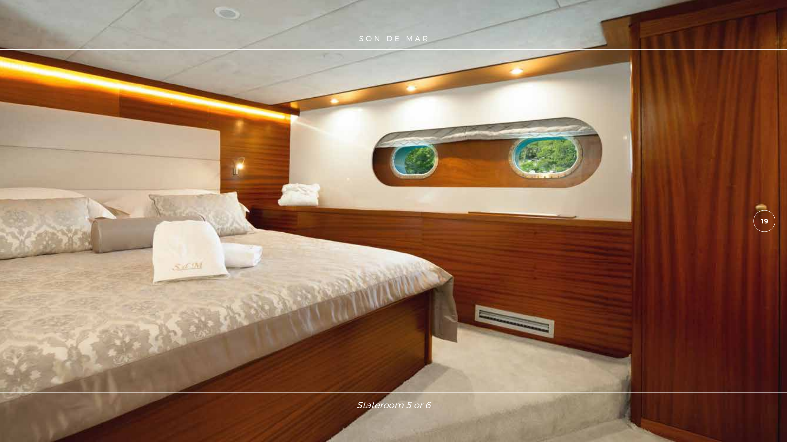
Stateroom 5 or 6