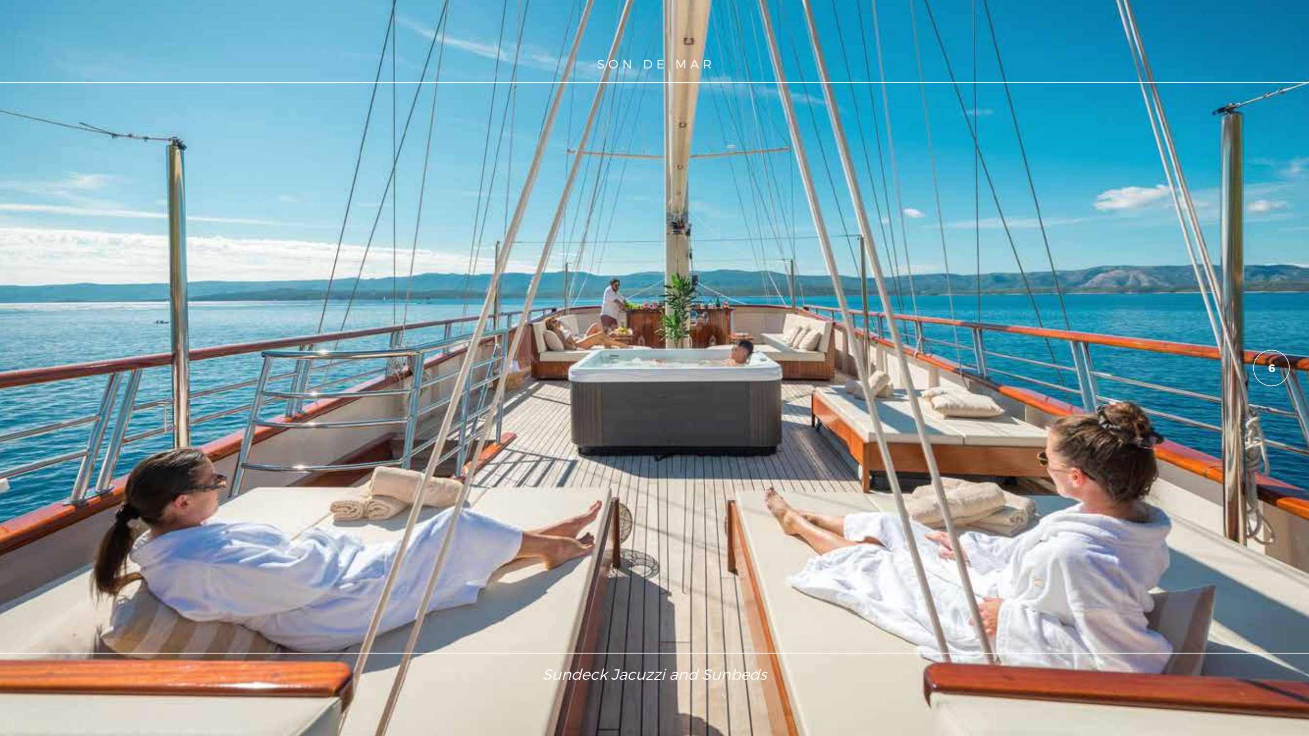
Sundeck Jacuzzi and Sunbeds