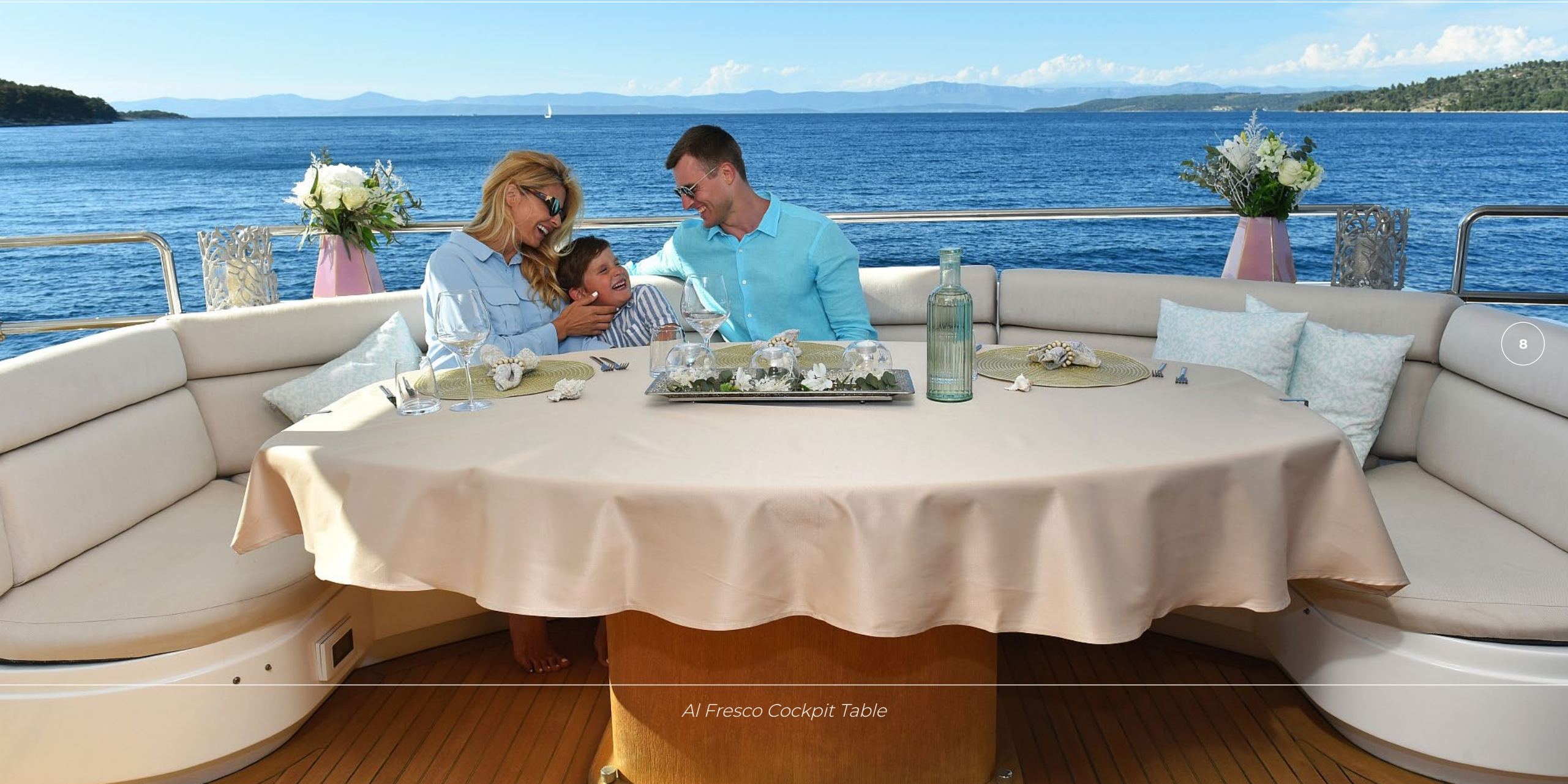
Al Fresco Cockpit Table