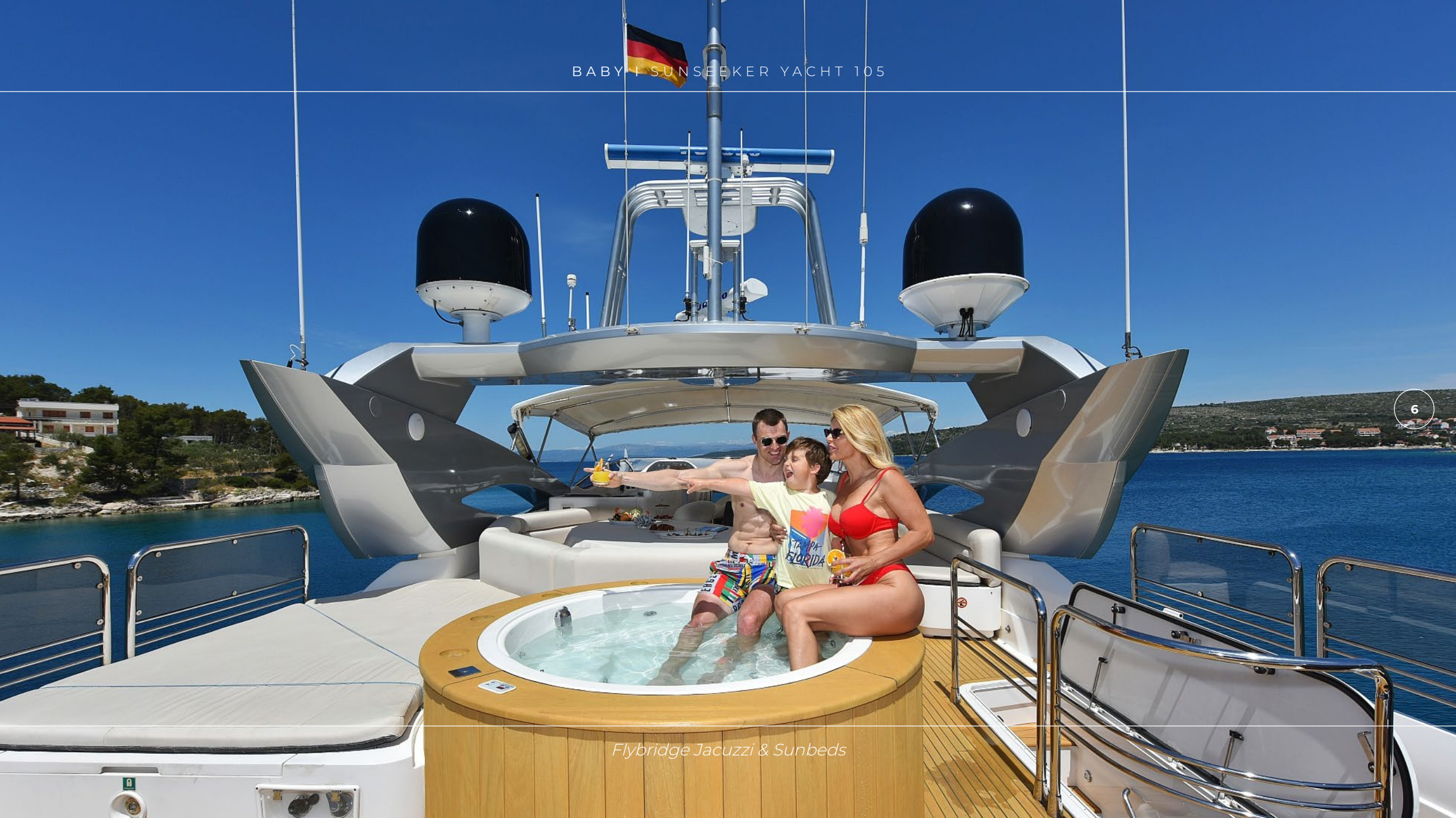
Flybridge Jacuzzi & Sunbeds