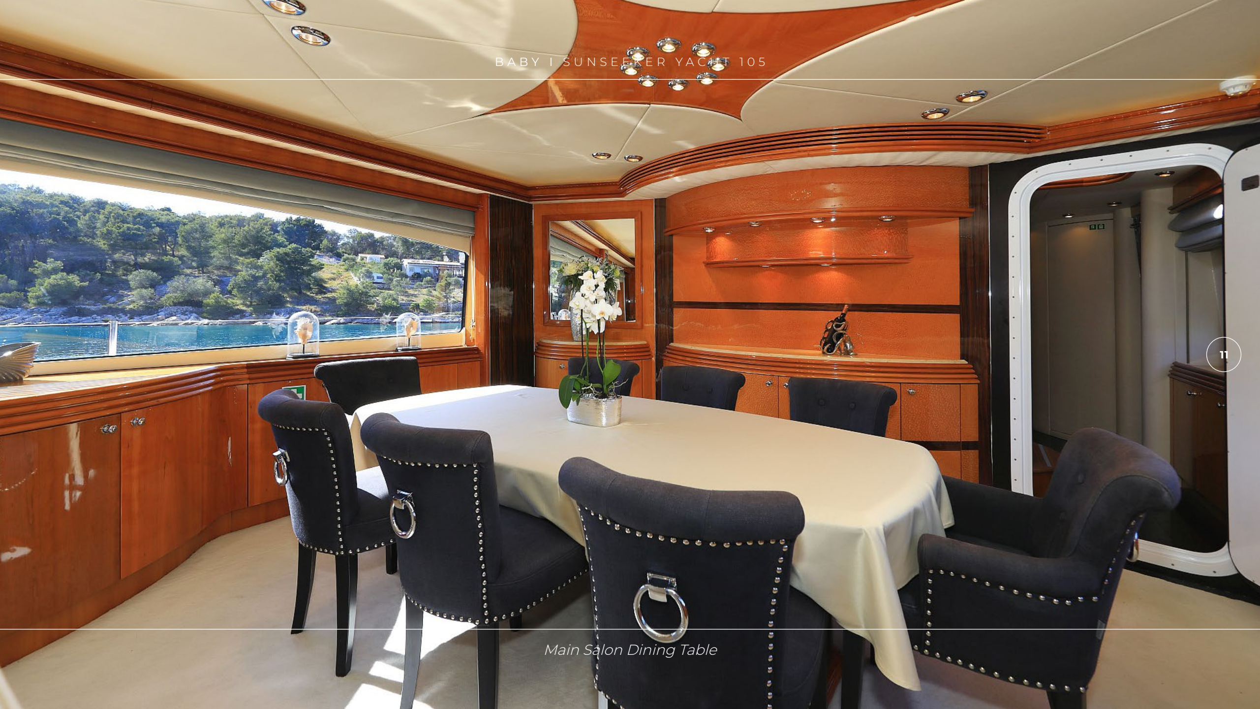
Main Salon Dining Table