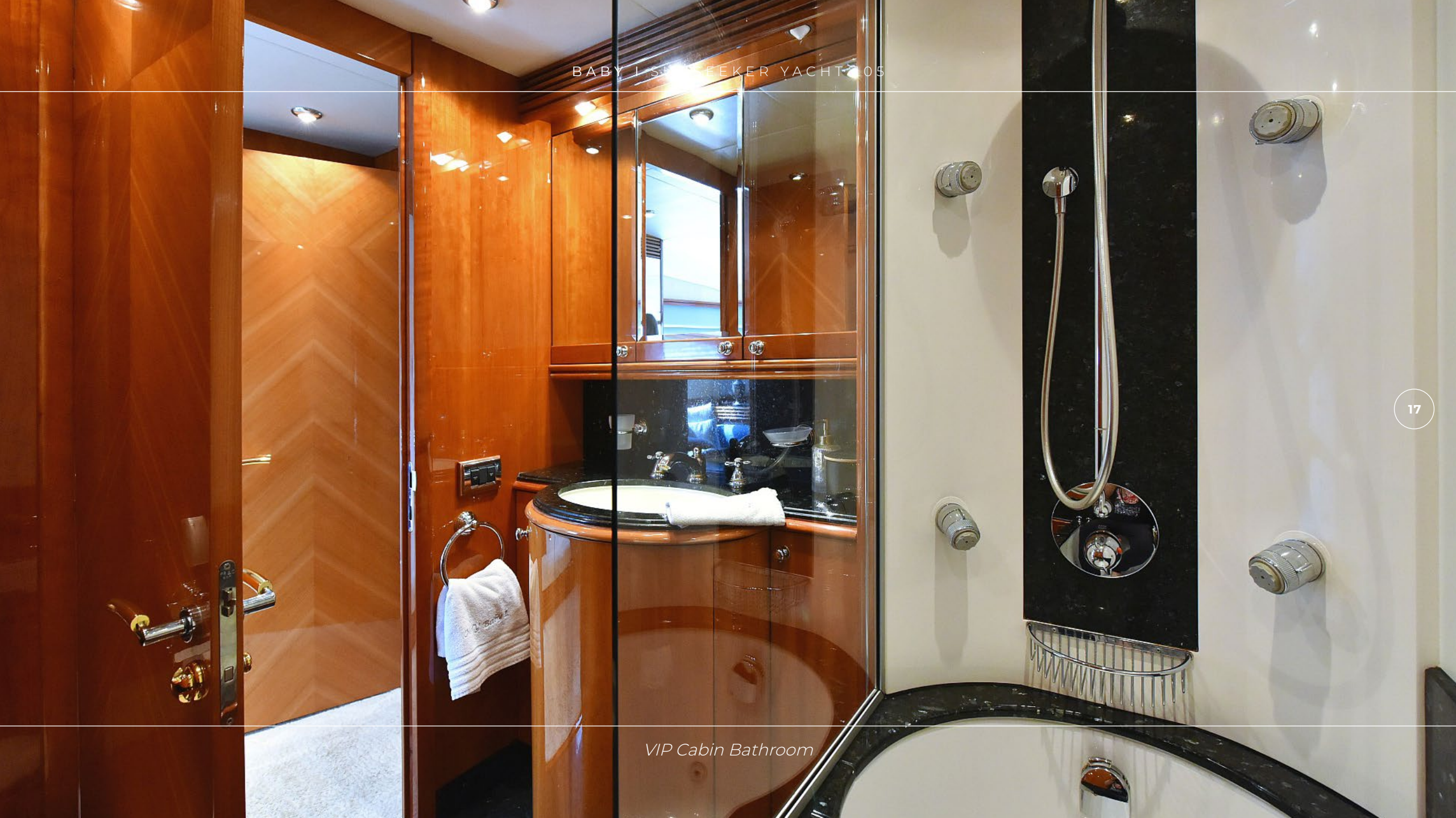
VIP Cabin Bathroom