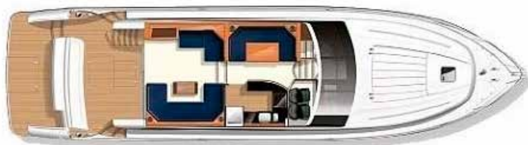
Upper accommodation layout