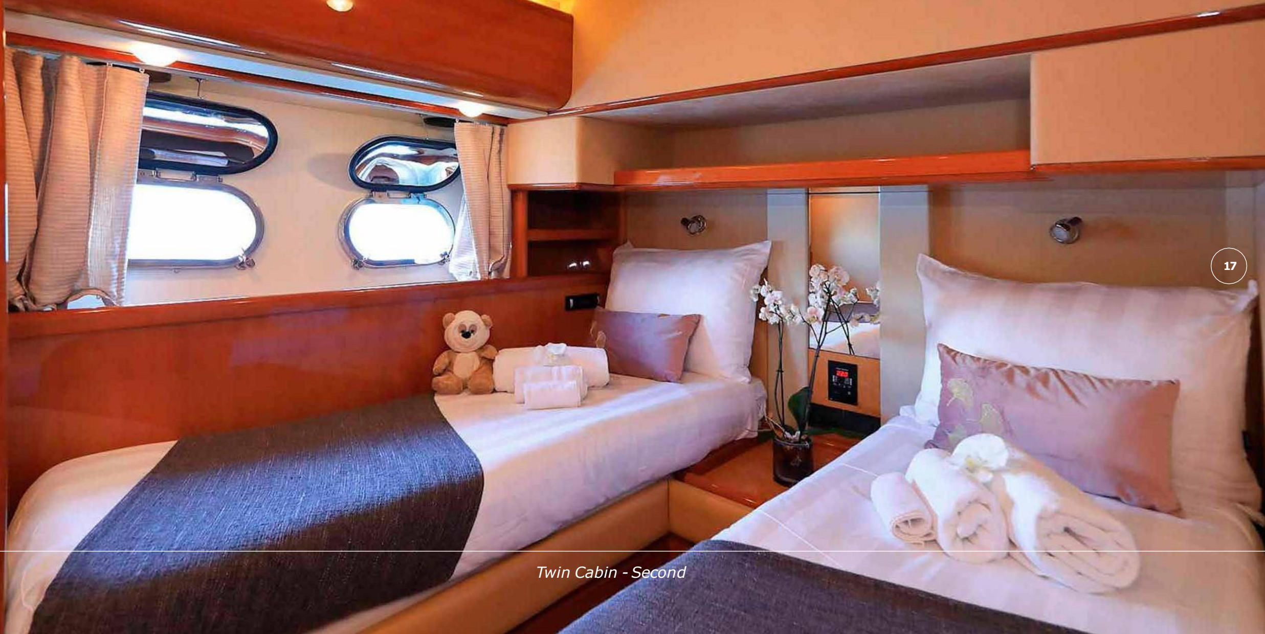
Twin Cabin - Second