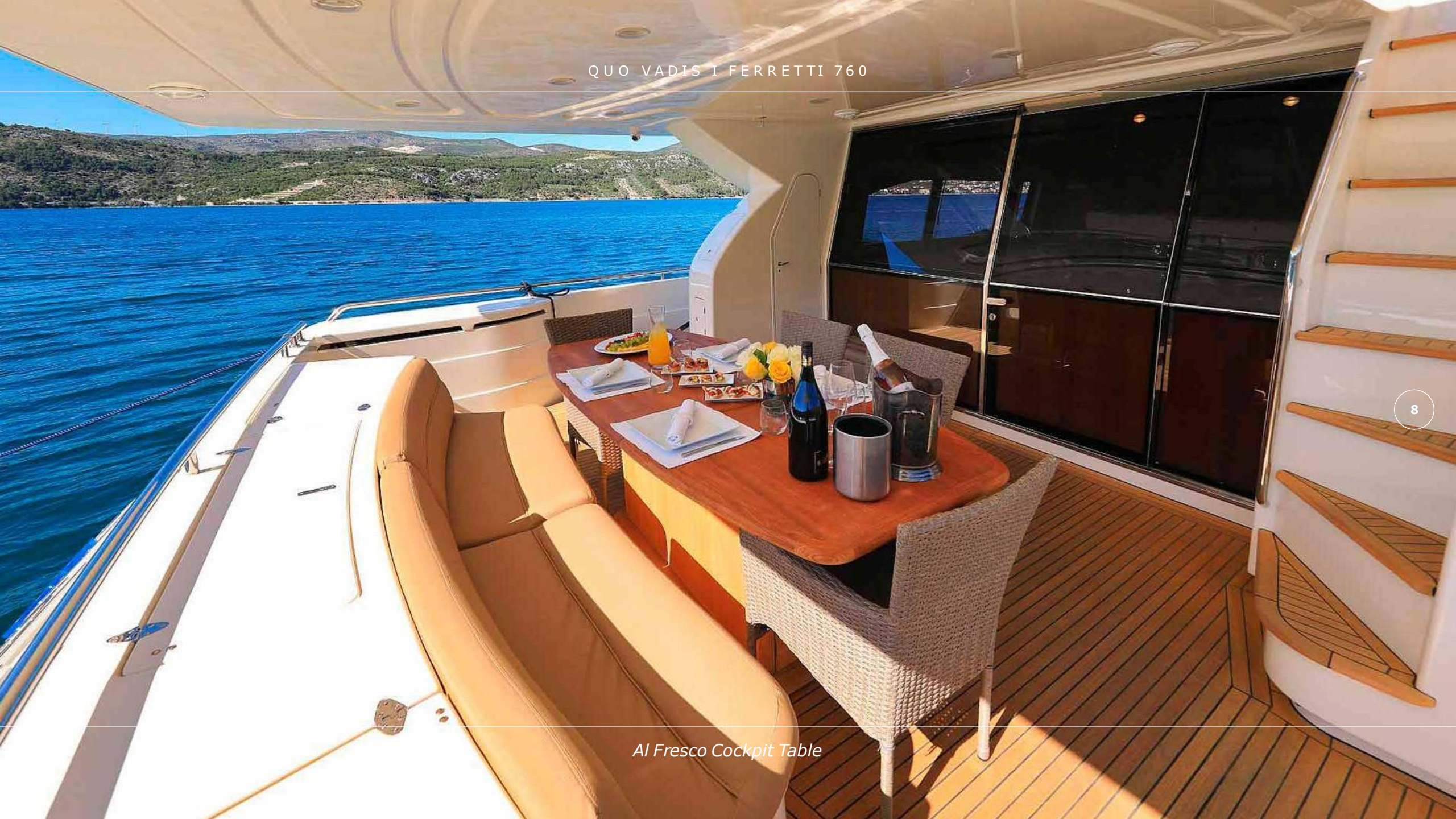
Al Fresco Cockpit Table