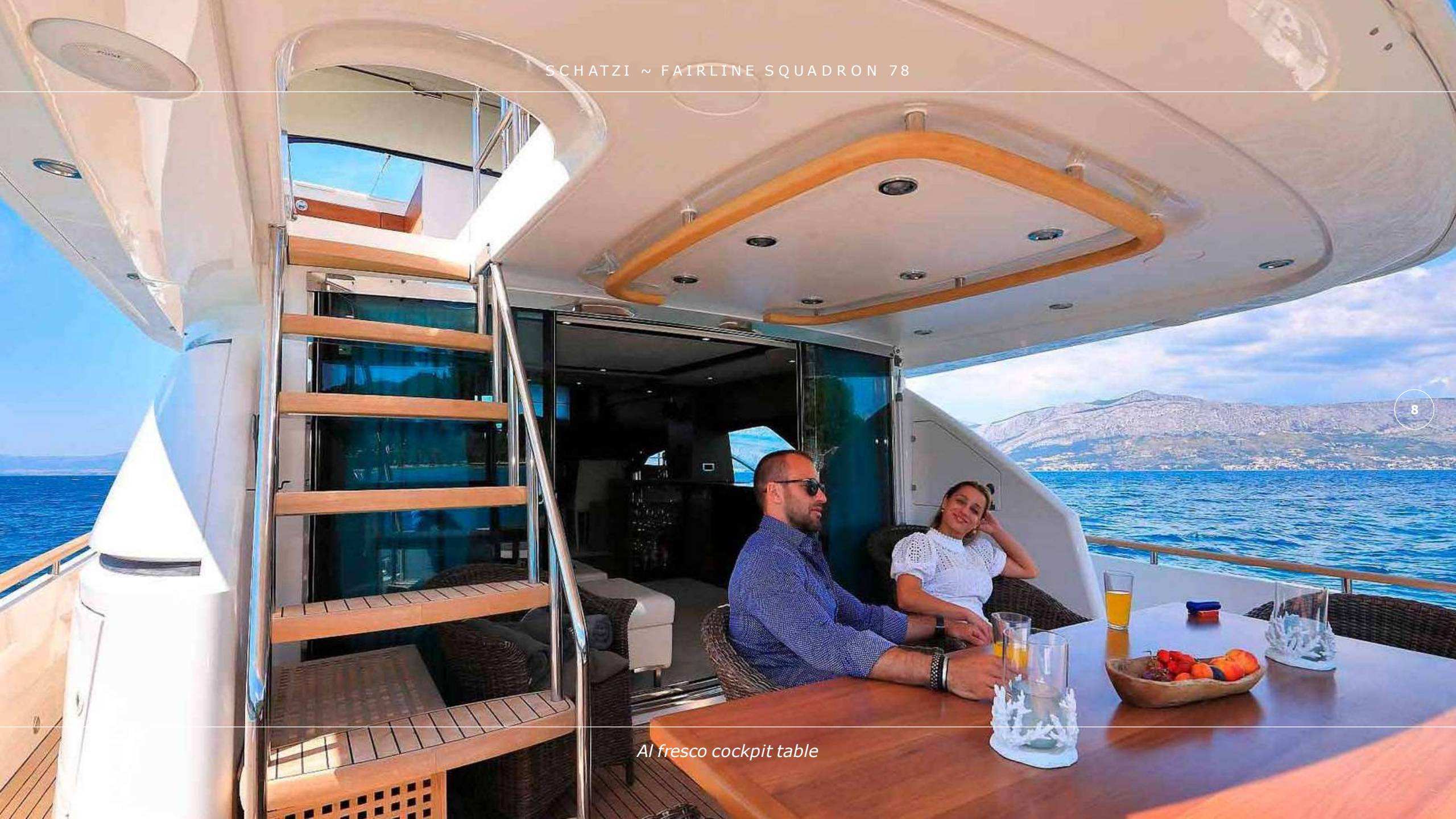
Al fresco cockpit table