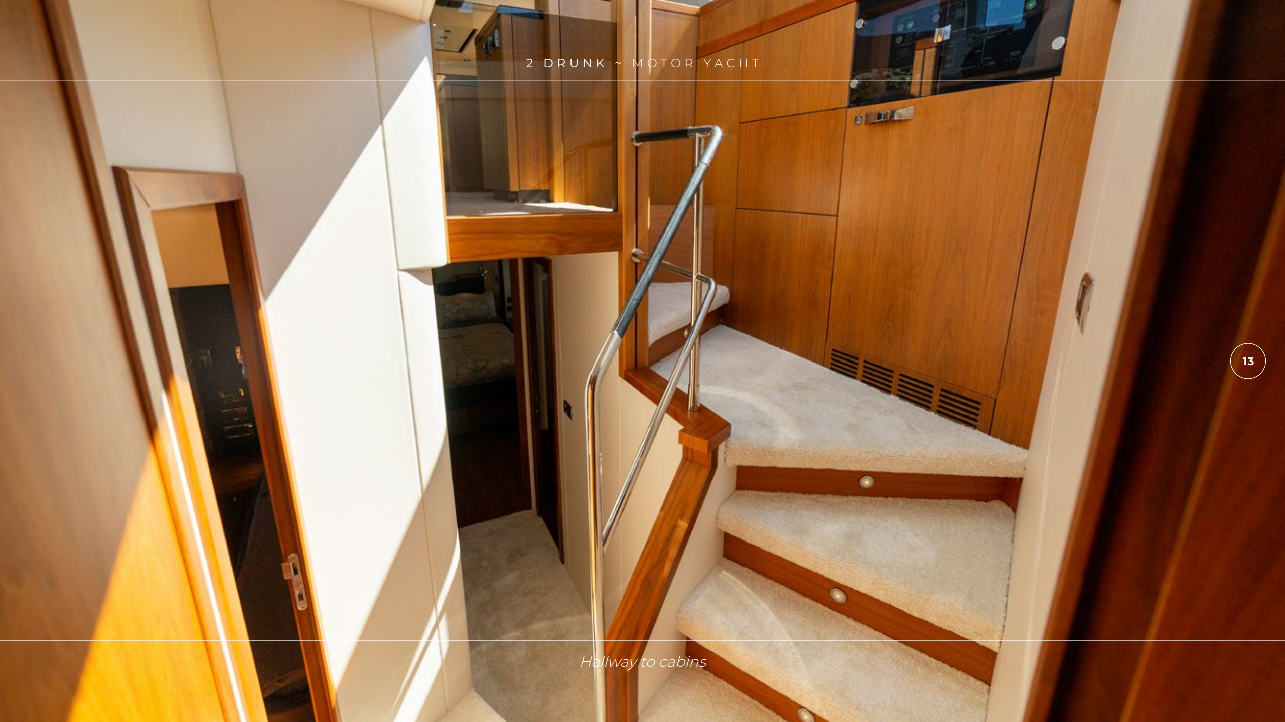
Hallway to cabins