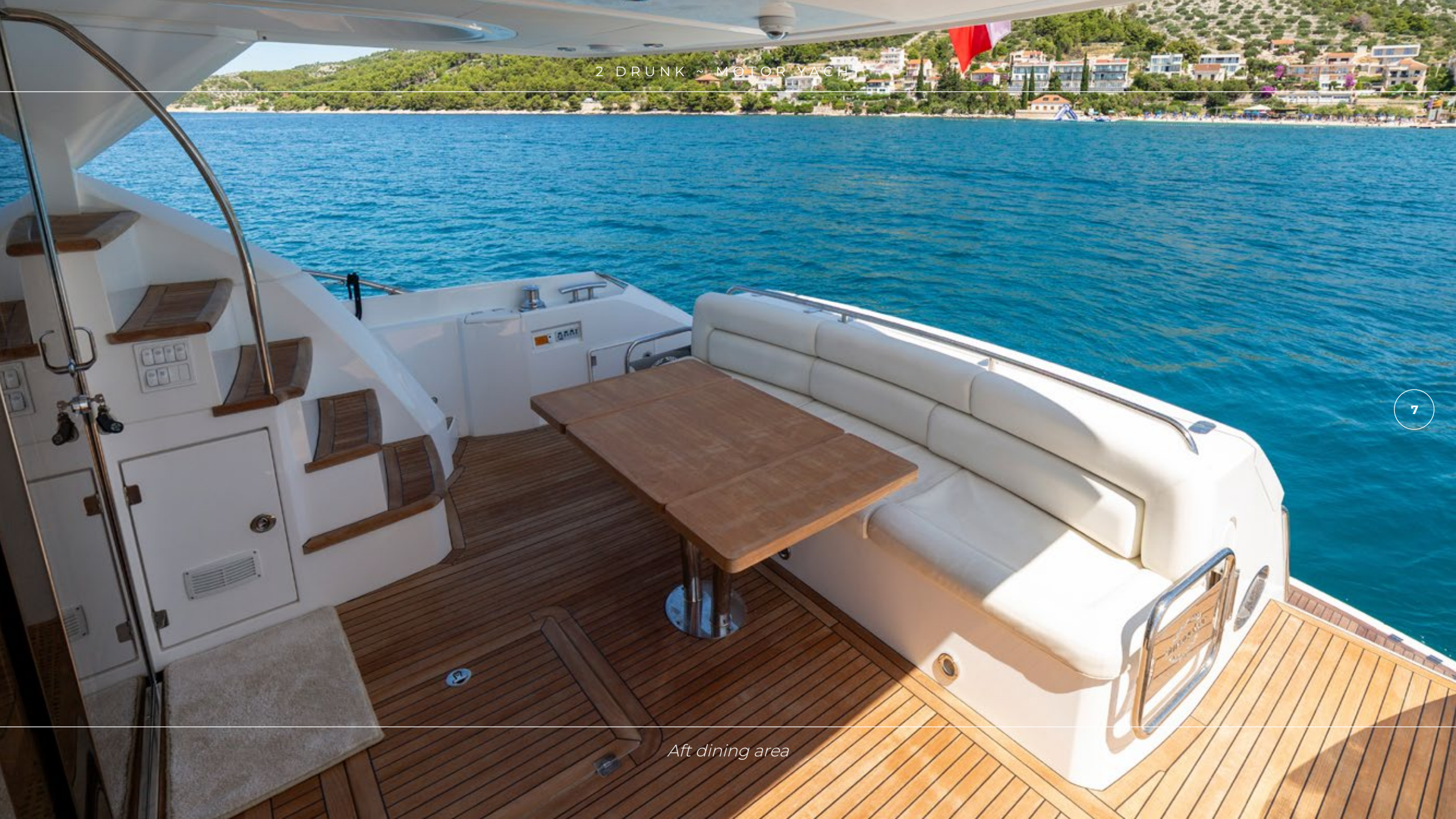
Aft dining area