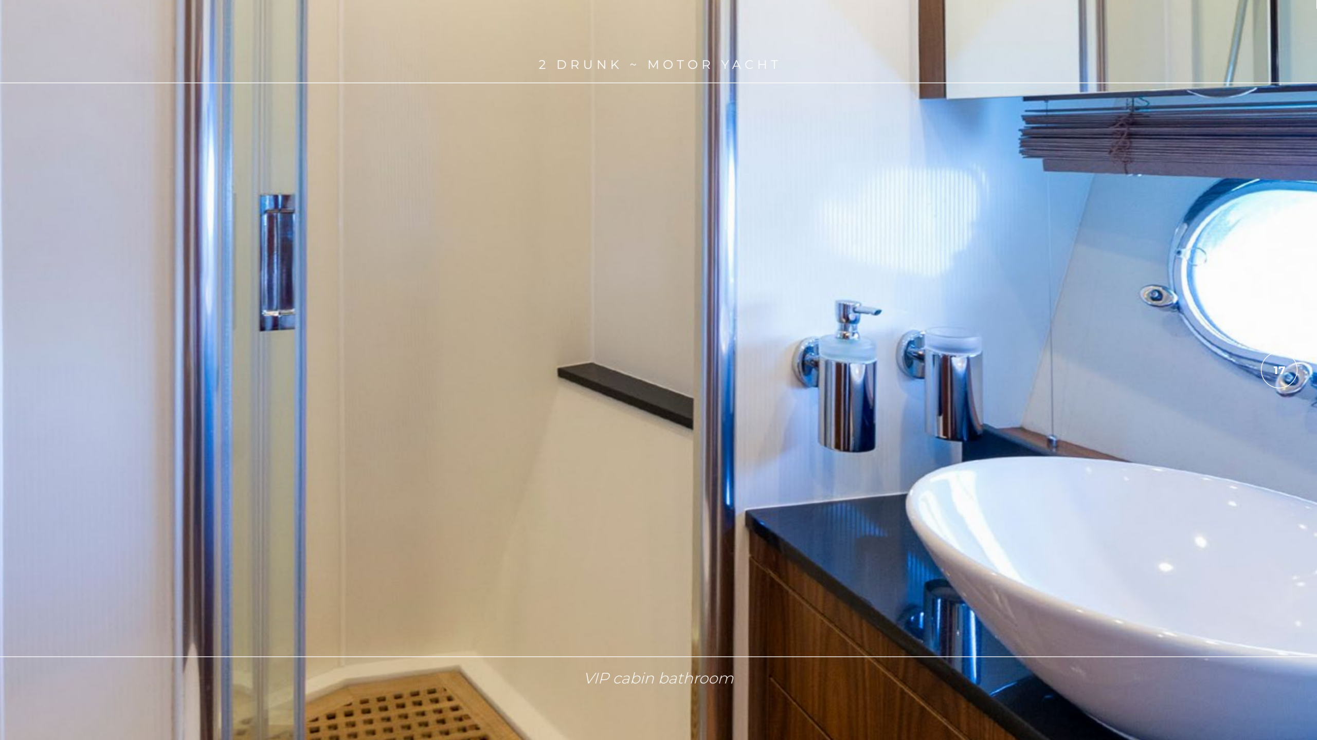
VIP cabin bathroom