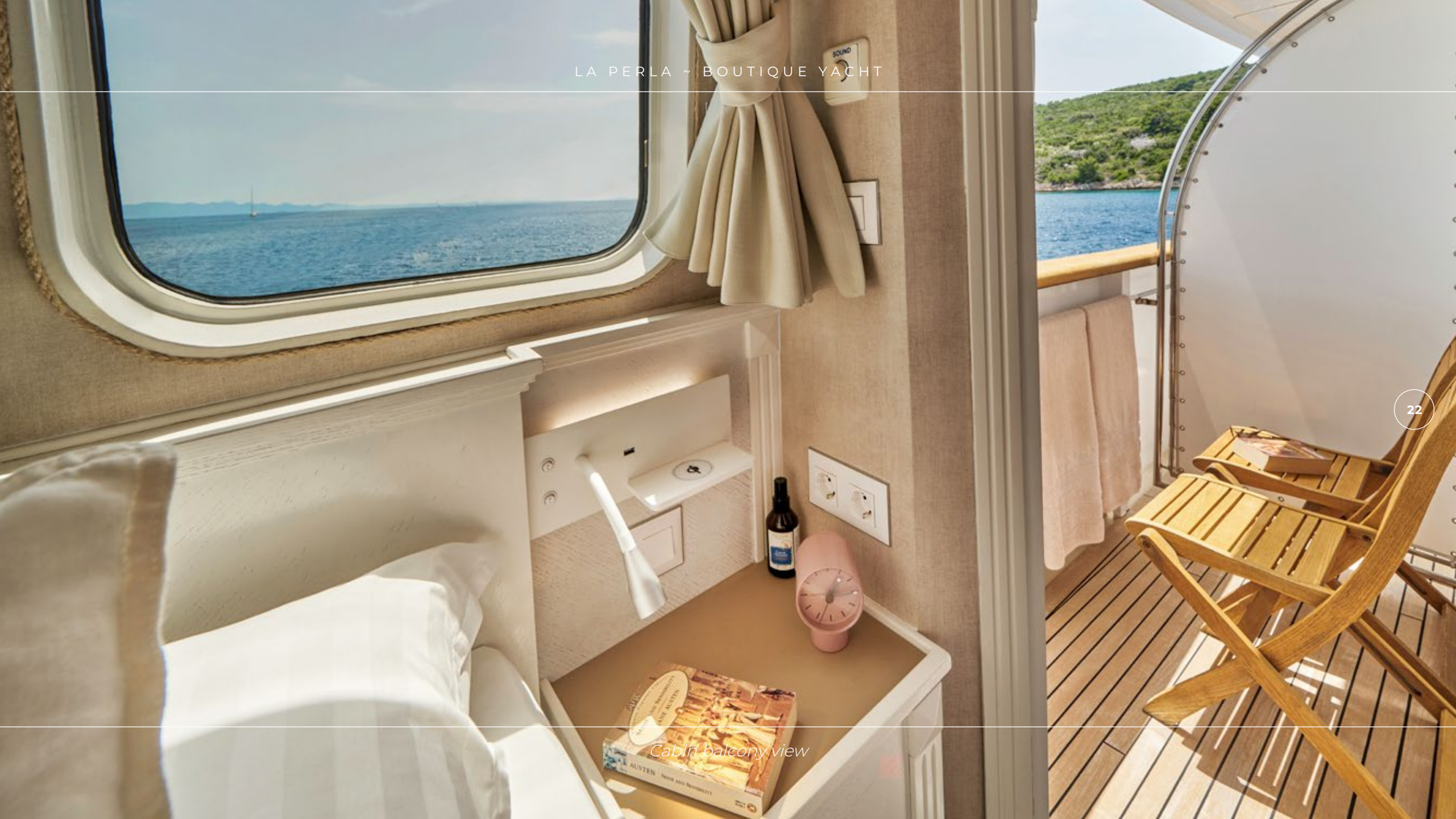
Cabin balcony view