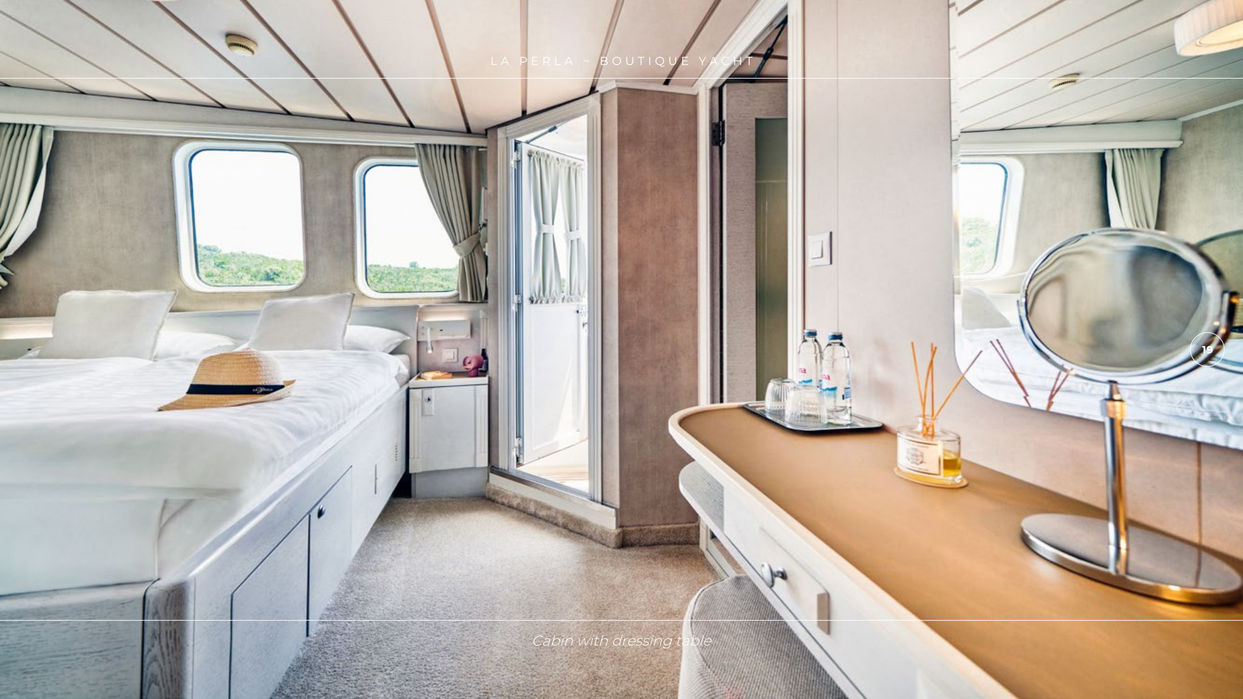
Cabin with dressing table