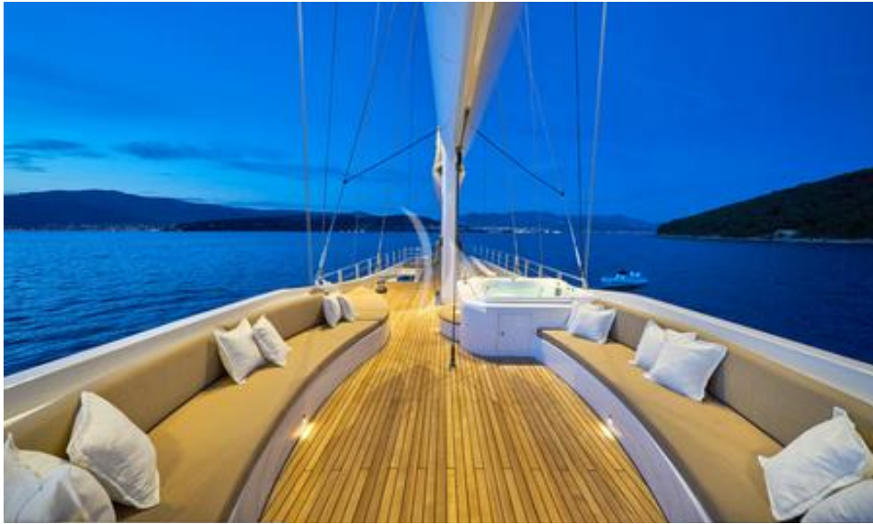
Sundeck at dusk