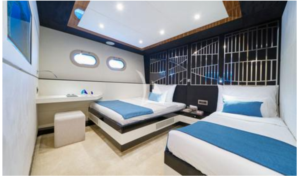
Triple Cabin - Double + Single