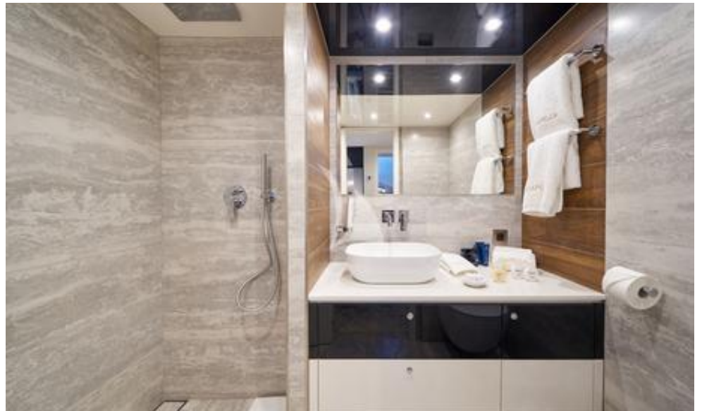
Triple Cabin Ensuite