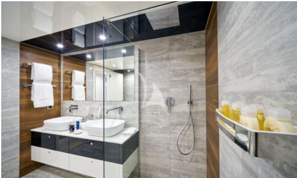
Mid King Ensuite