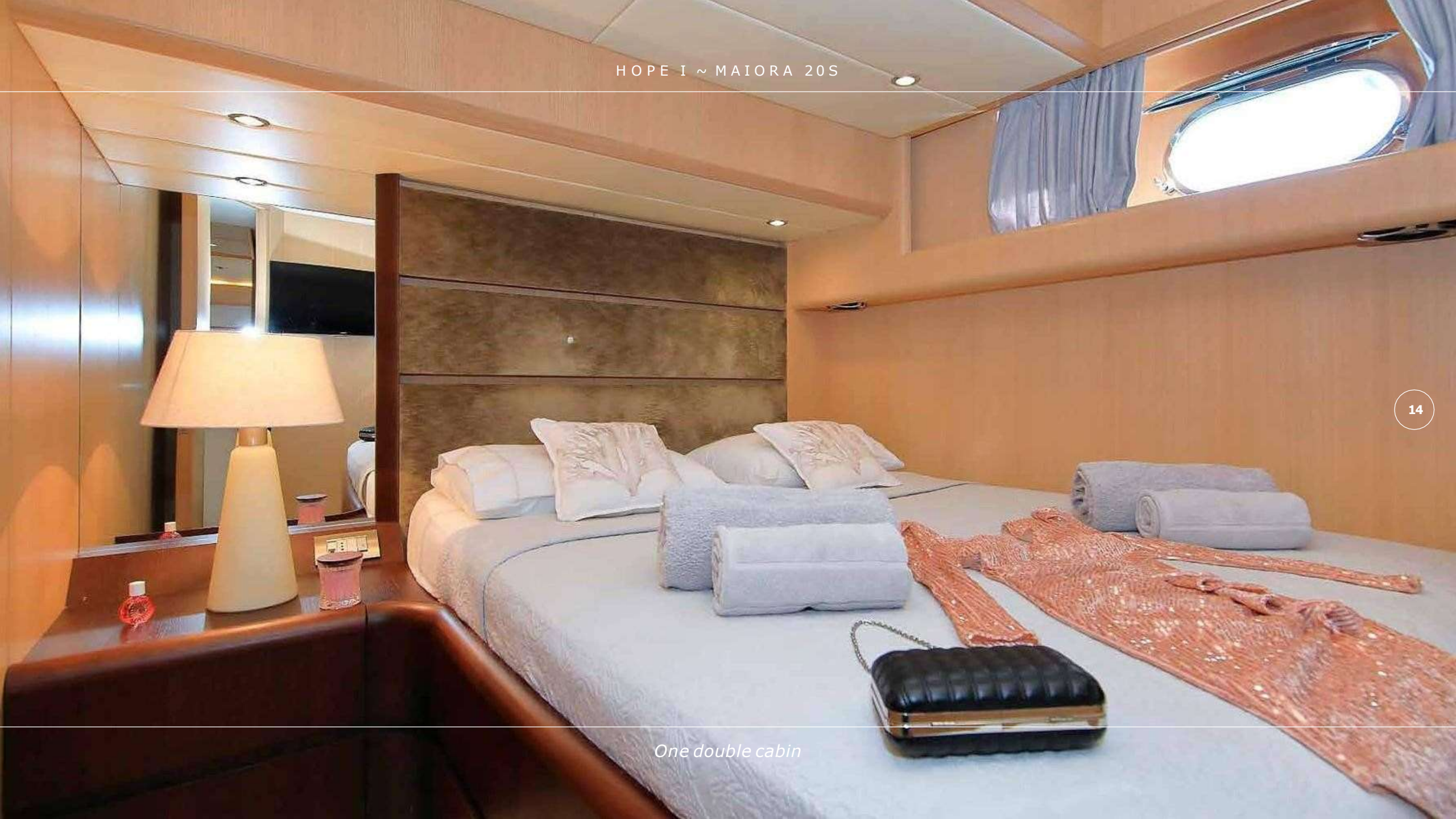
One double cabin