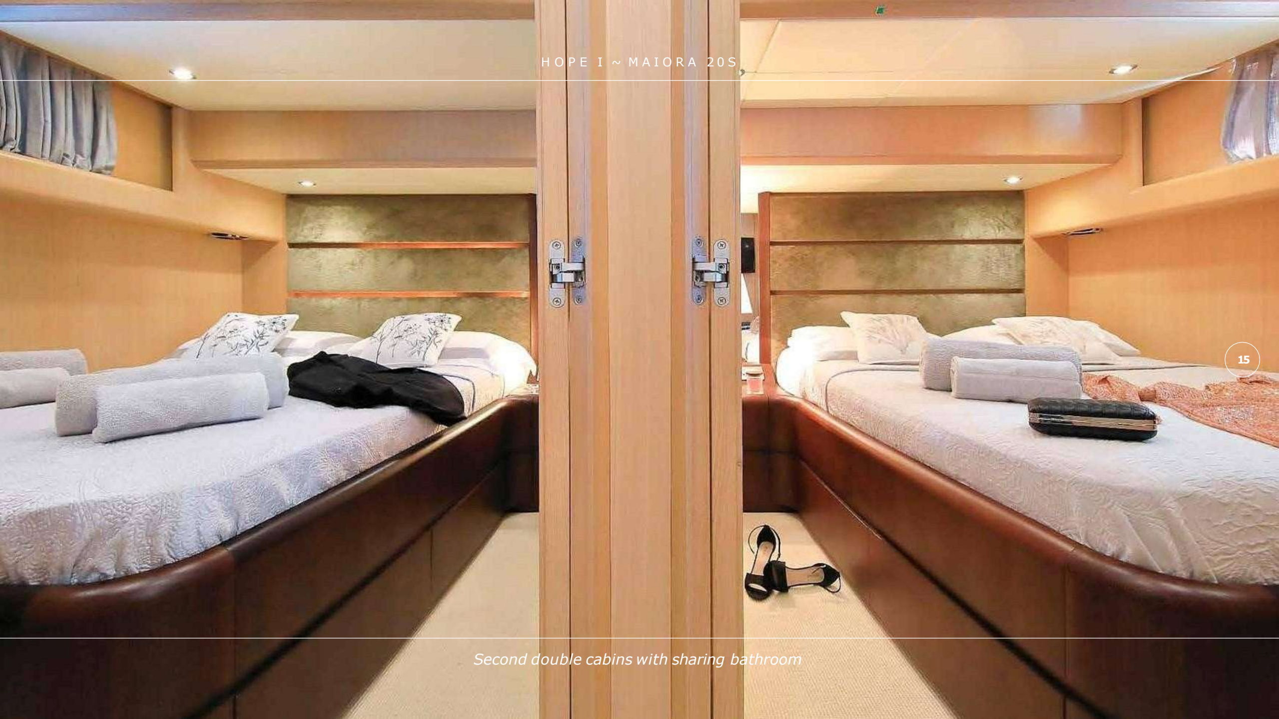
Second double cabins with sharing bathroom