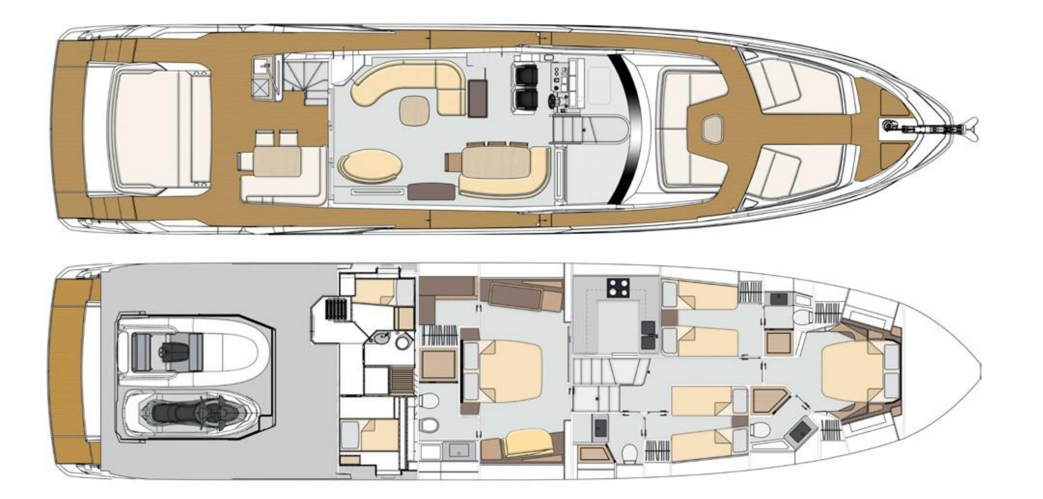
MYNE ~ AZIMUT S8