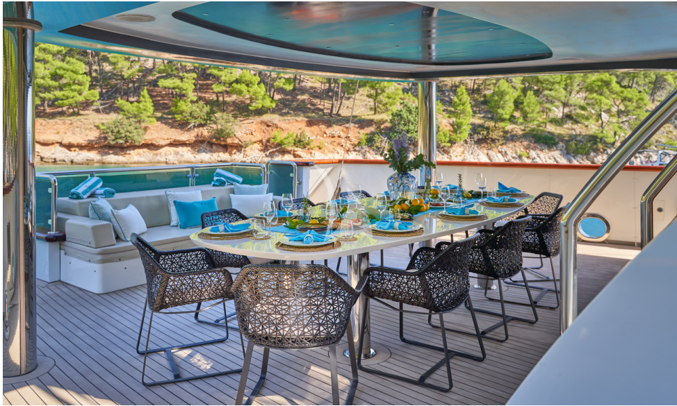
al fresco dining