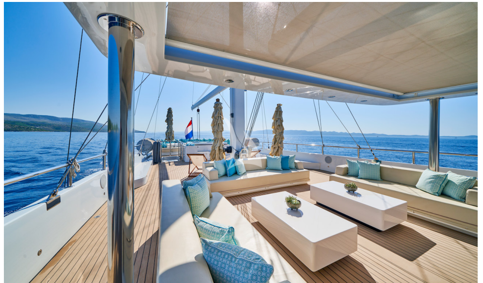
deck lounge area