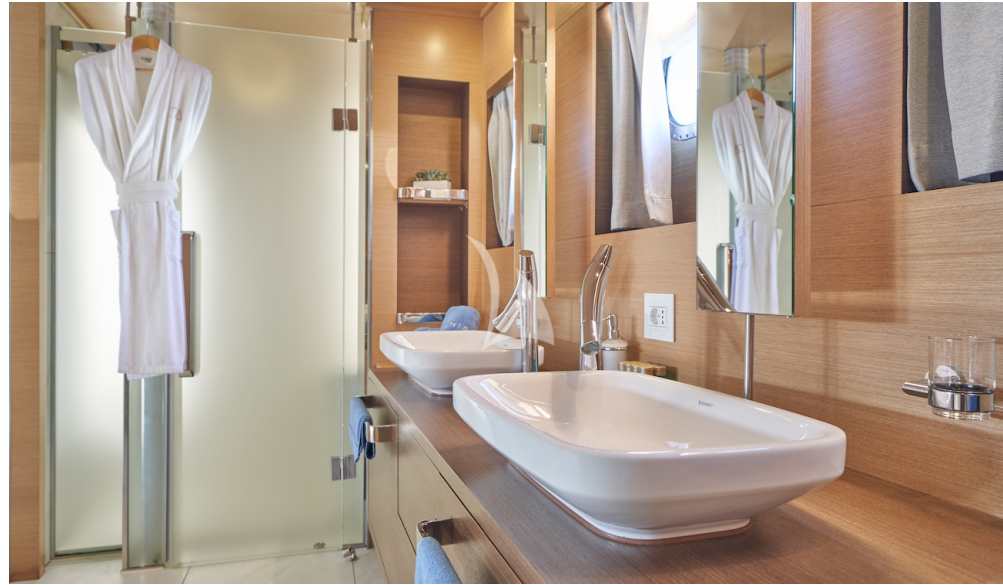
Guest en suite