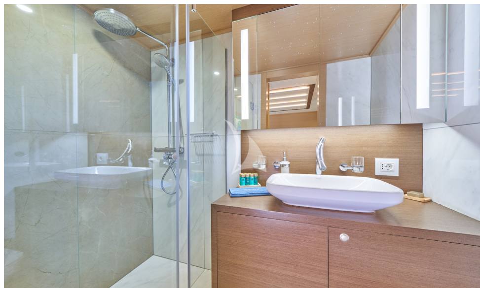
Guest en suite