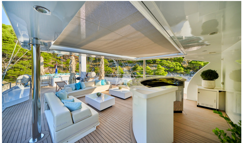
deck lounging area