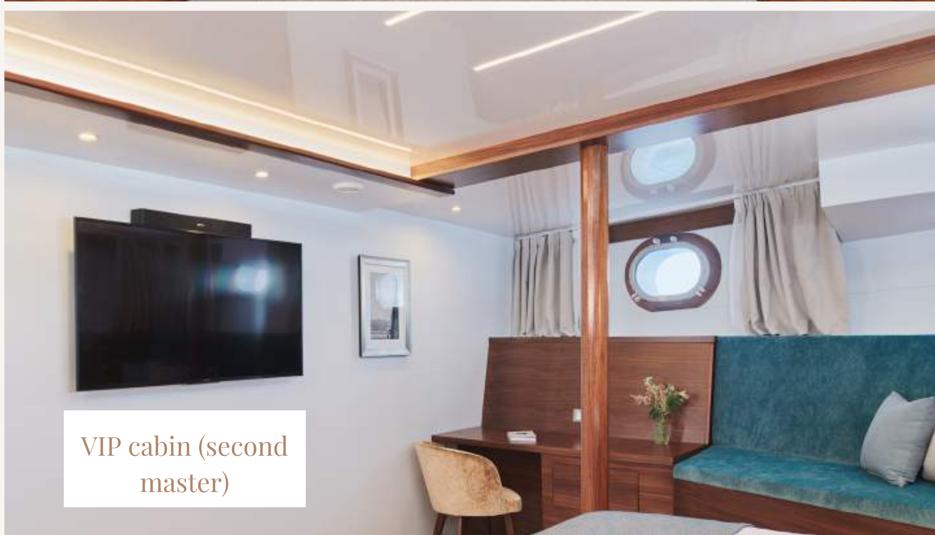
VIP cabin (second master)