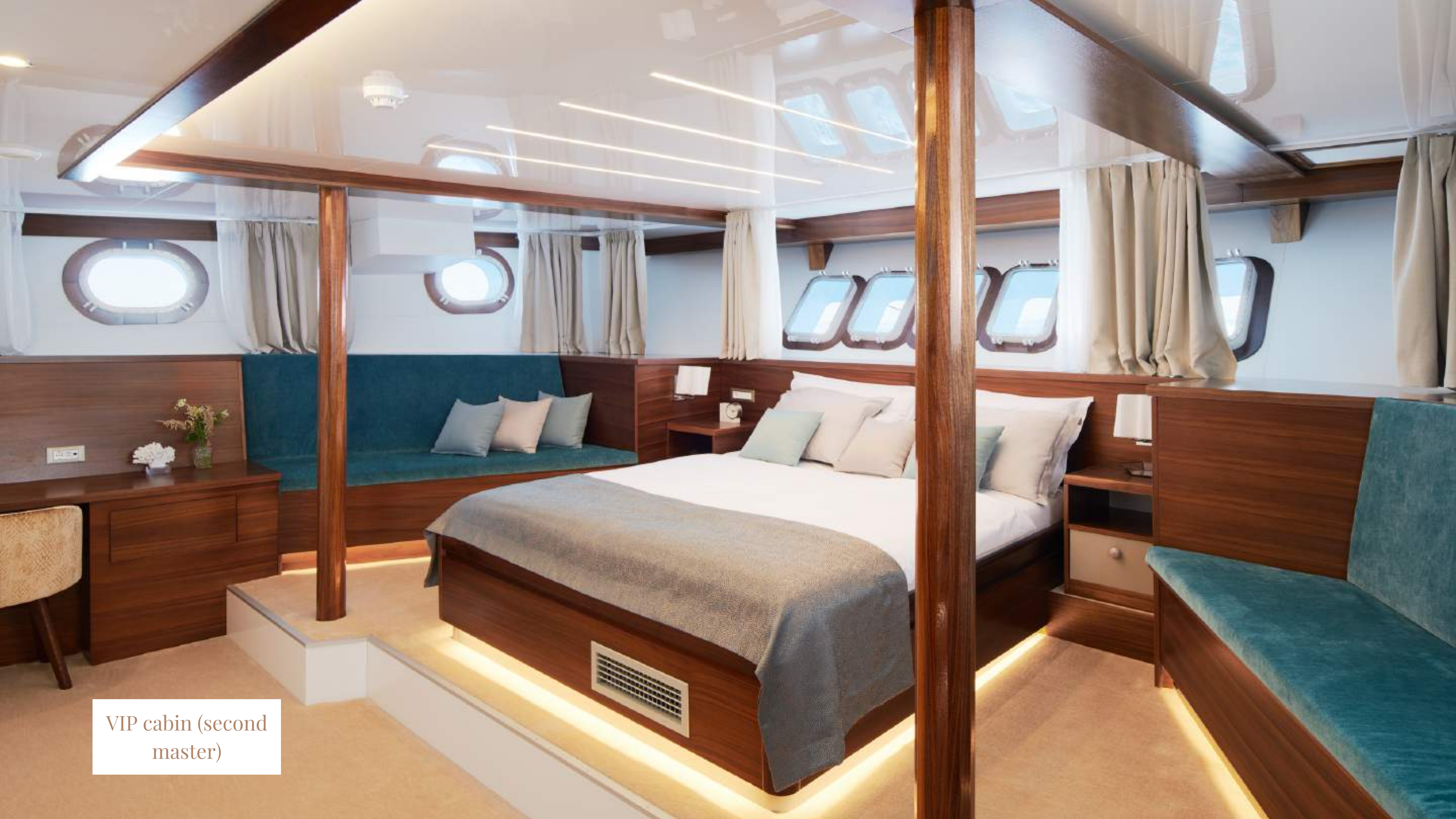
VIP cabin (second master)