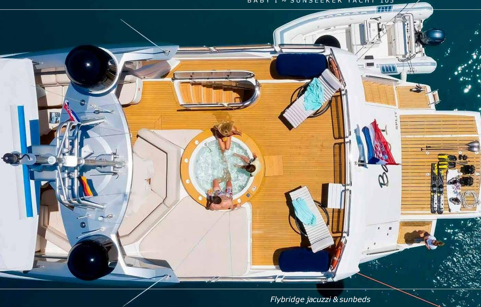
Flybridge jacuzzi & sunbeds