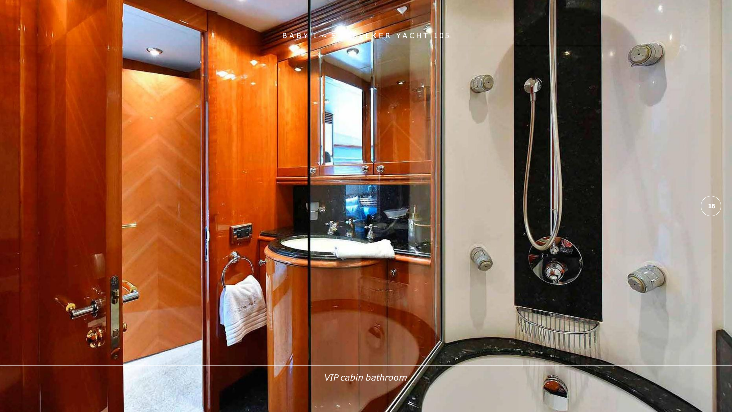
VIP cabin bathroom