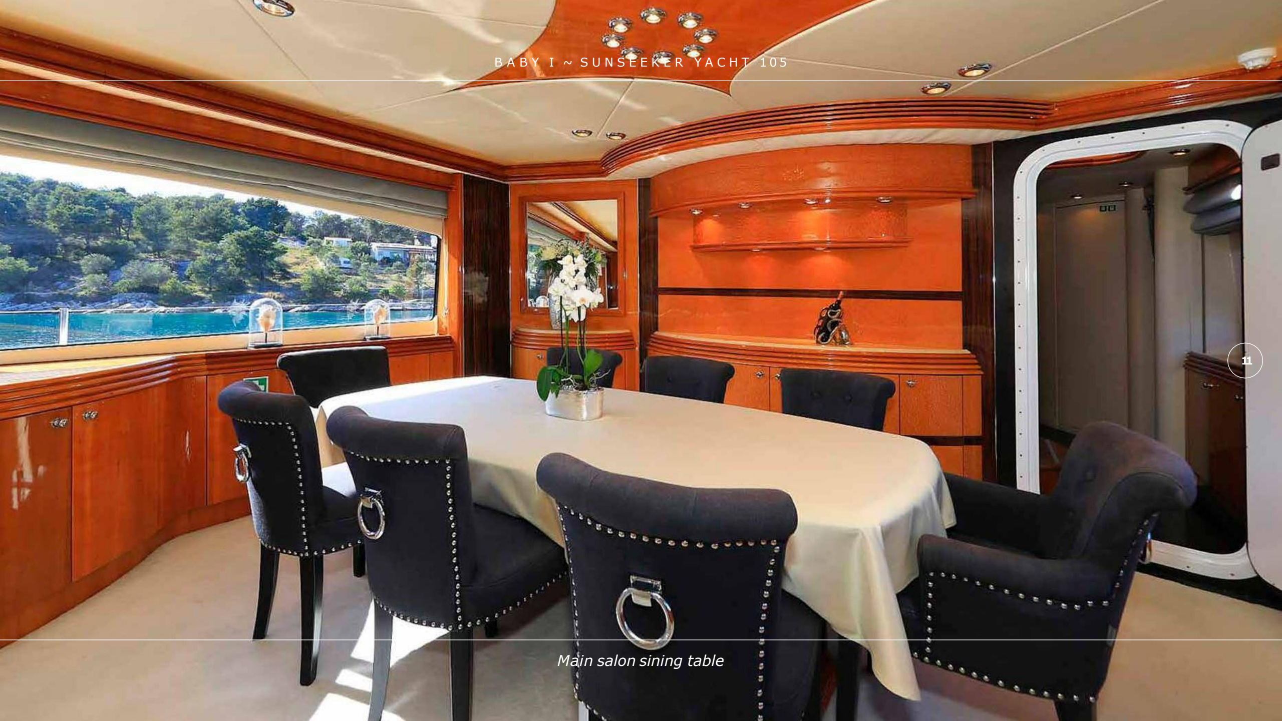
Main salon sining table