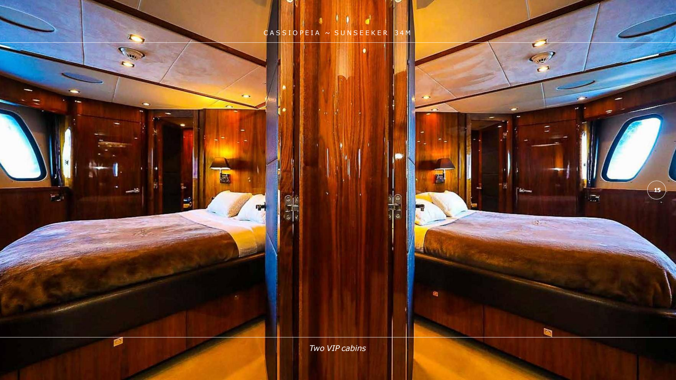
Two VIP cabins