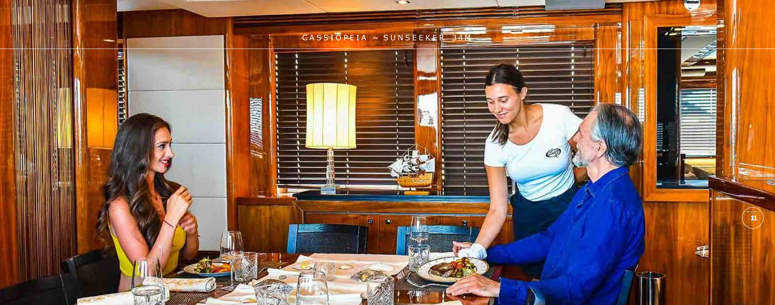
Main salon dining table