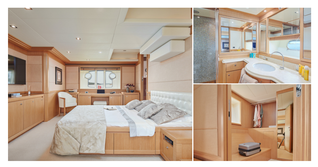
The palatial VIP stateroom spans the width of the yacht midships and is in fact slightly larger than the master suite above — a fact which makes this charter yacht a particularly attractive option for charters with 2 principals, or for an extended family. Highlights of this cabin is huge wardrobe and sofa seating that can be used as a bed for a child.