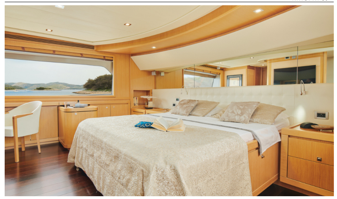
A full-beam main deck master, rarely found on a yacht in this size range, complete with king-sized bed, walk-in closet and a spacious ensuite bathroom with double shower and vanity.