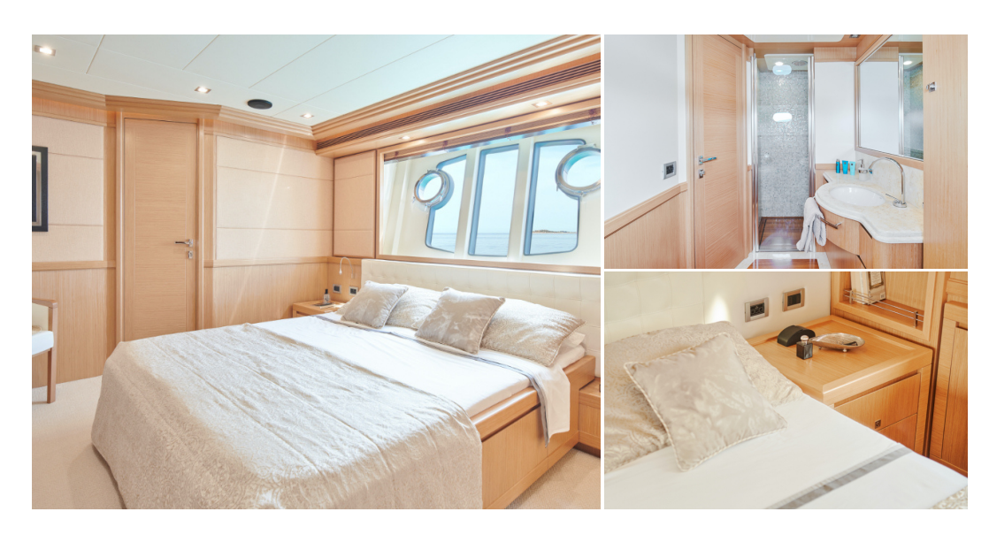
Each cabin is decadently large and has walk-in closets and ensuites.