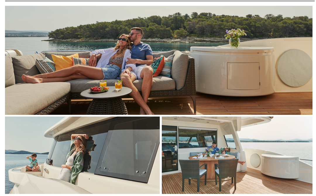
The upper deck is set up beautifully for easy superyacht living, with different areas for dining and relaxing.