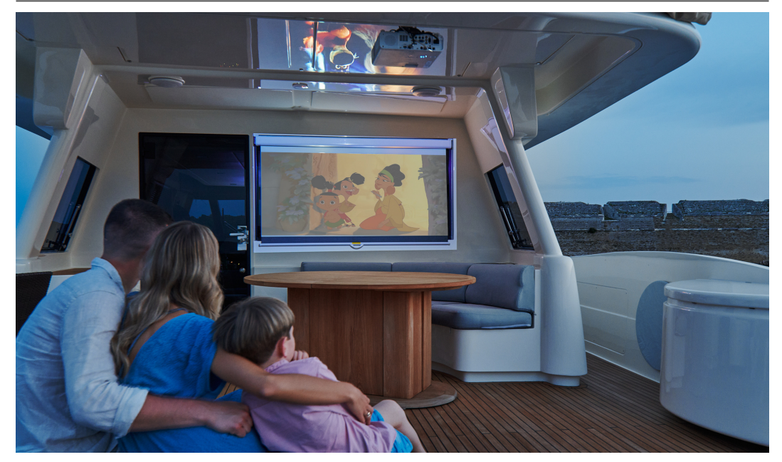
Open-air cinema entertainment