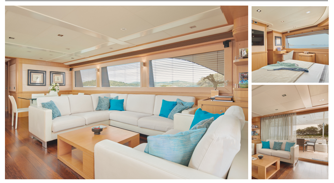
FRIEND'S BOAT welcomes you into an airy, light interior, with plenty of clean lines and light oak cabinetry, soft white furnishings and wide expanses of glass bringing in endless views of sky and sea.