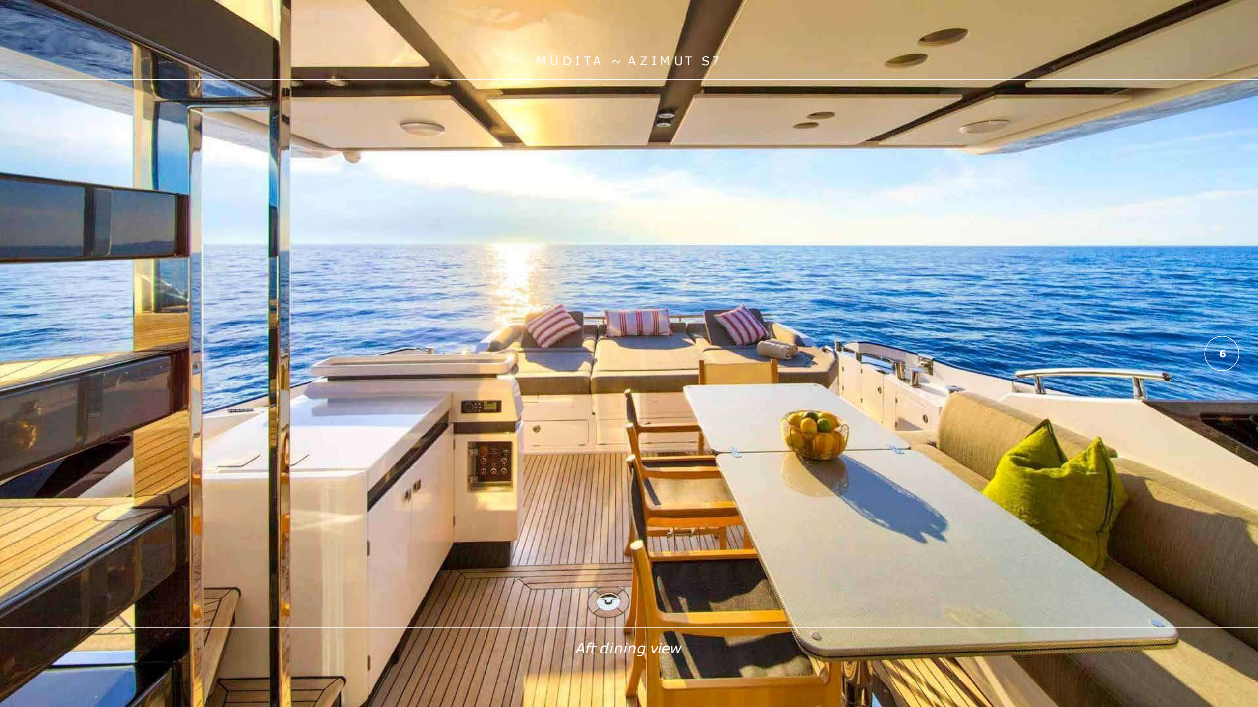
Aft dining view