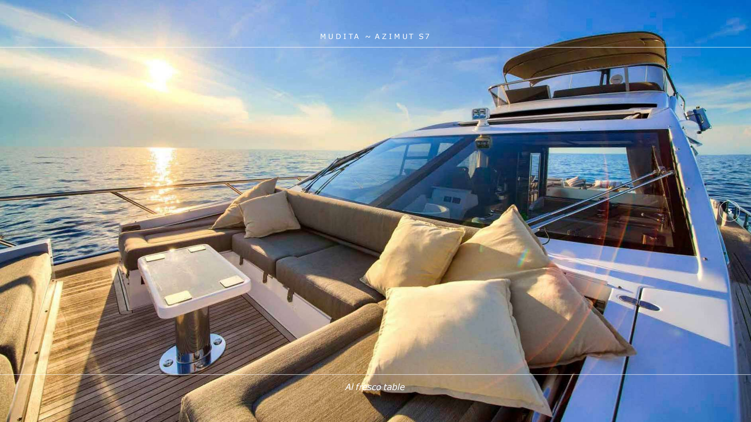
Al fresco table