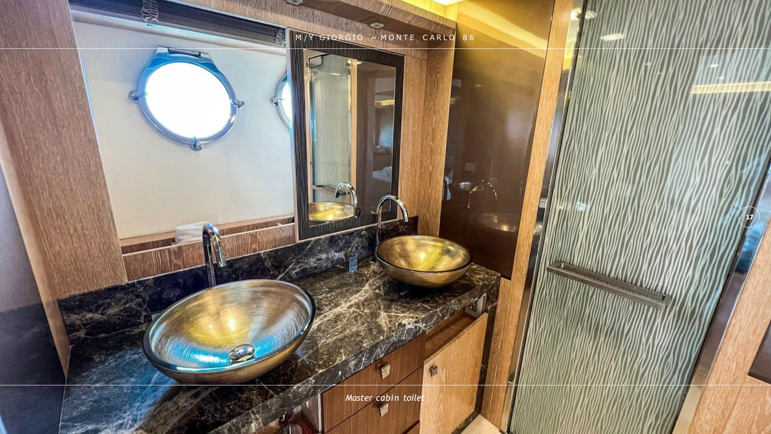
Master cabin toilet