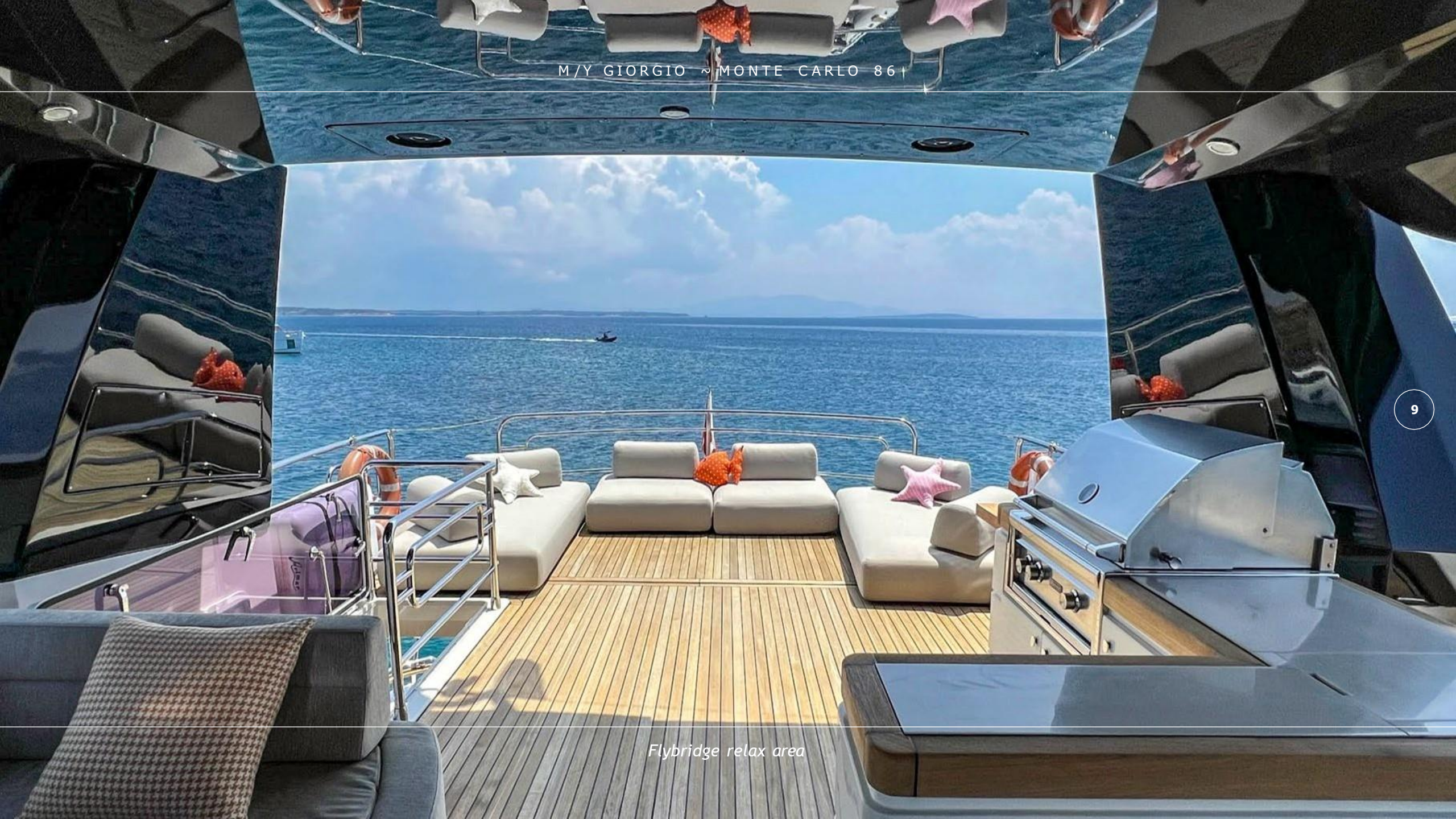
Flybridge relax area