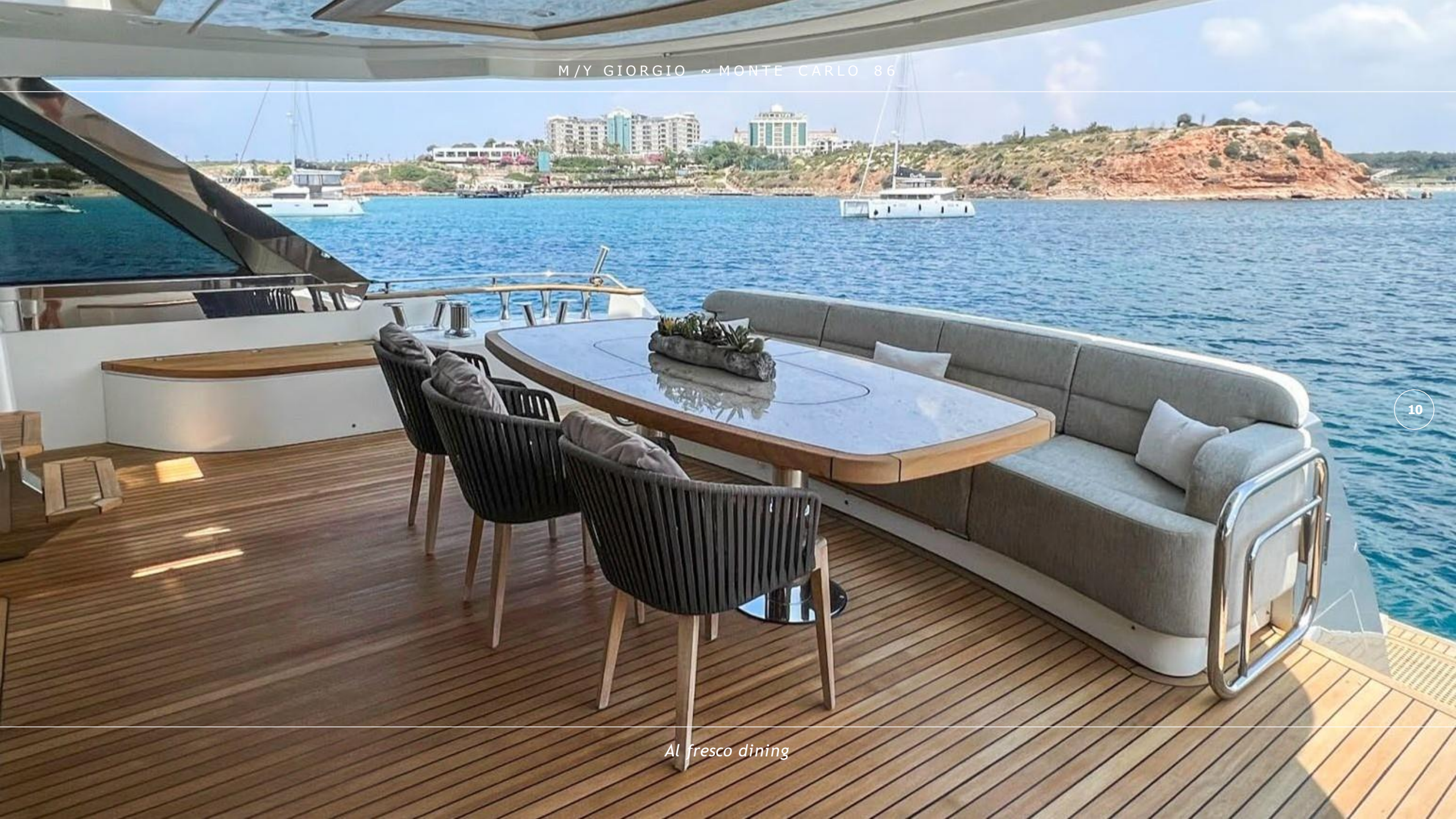
Al fresco dining