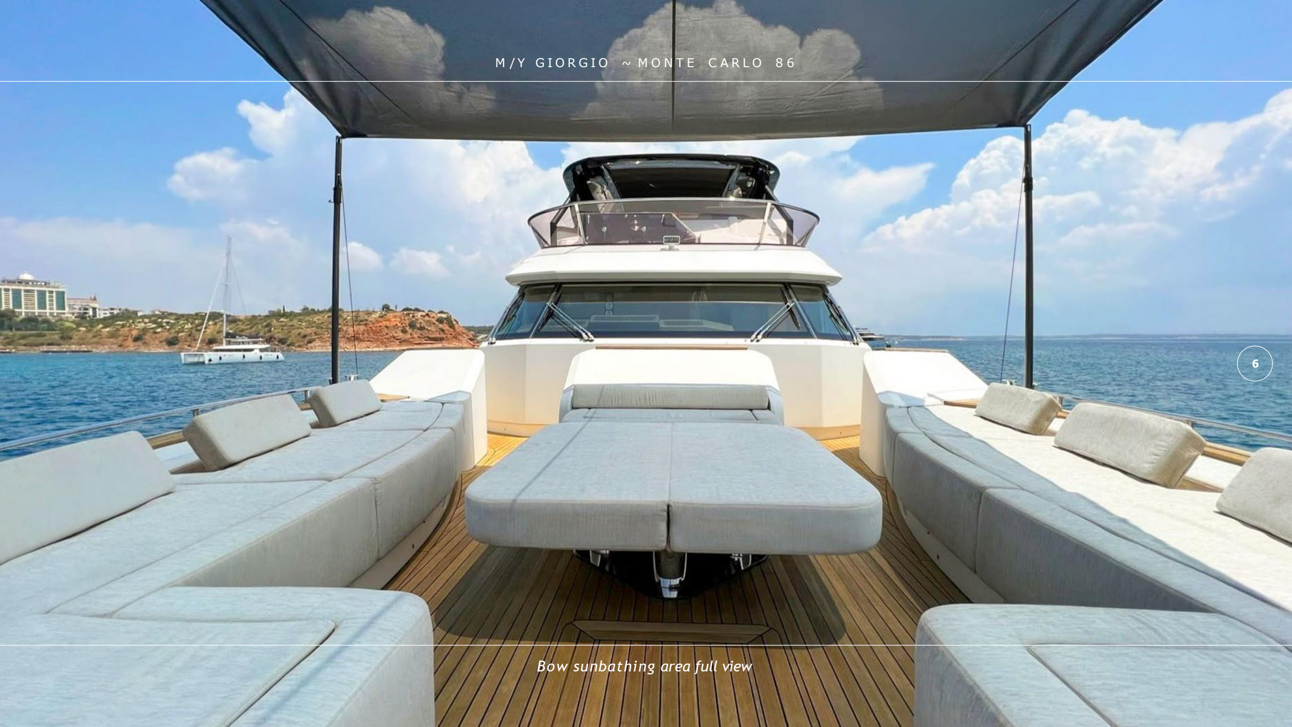
Bow sunbathing area full view