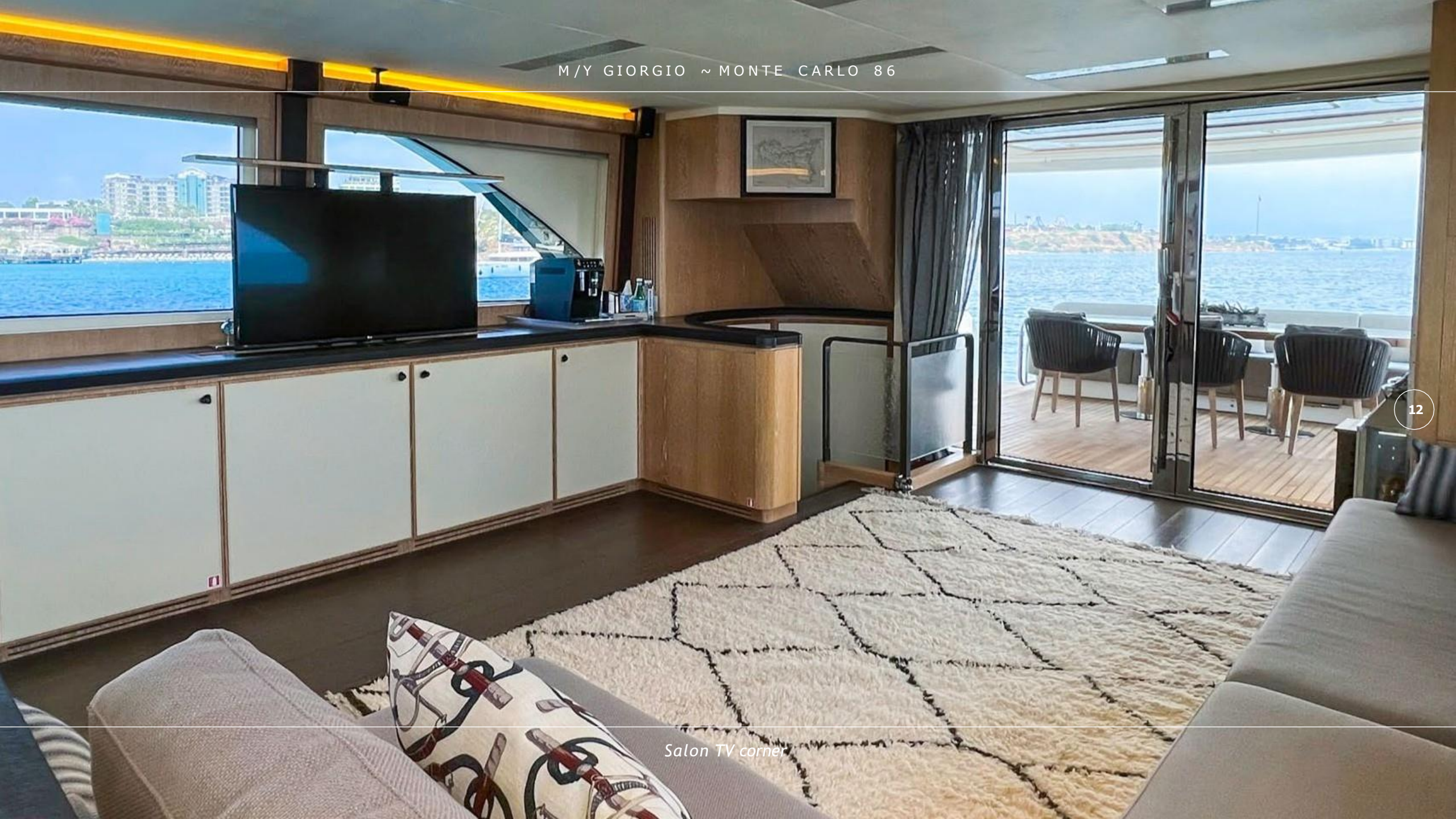
Salon TV corner