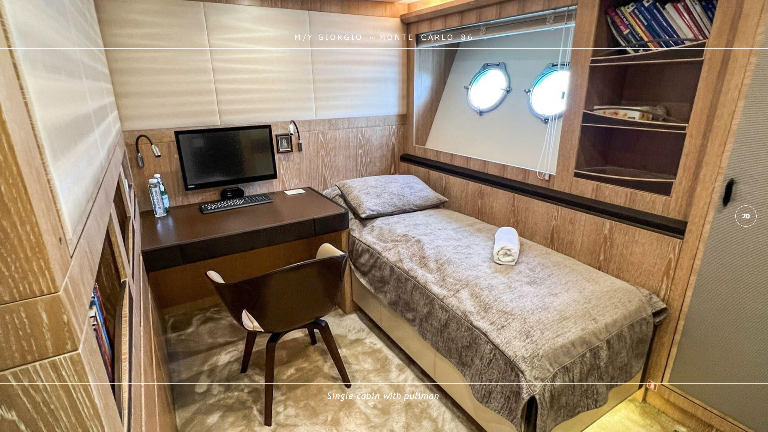
Single cabin with pullman