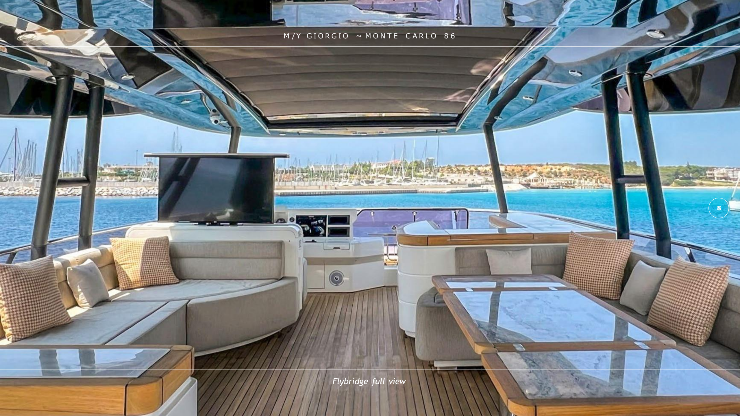
Flybridge full view