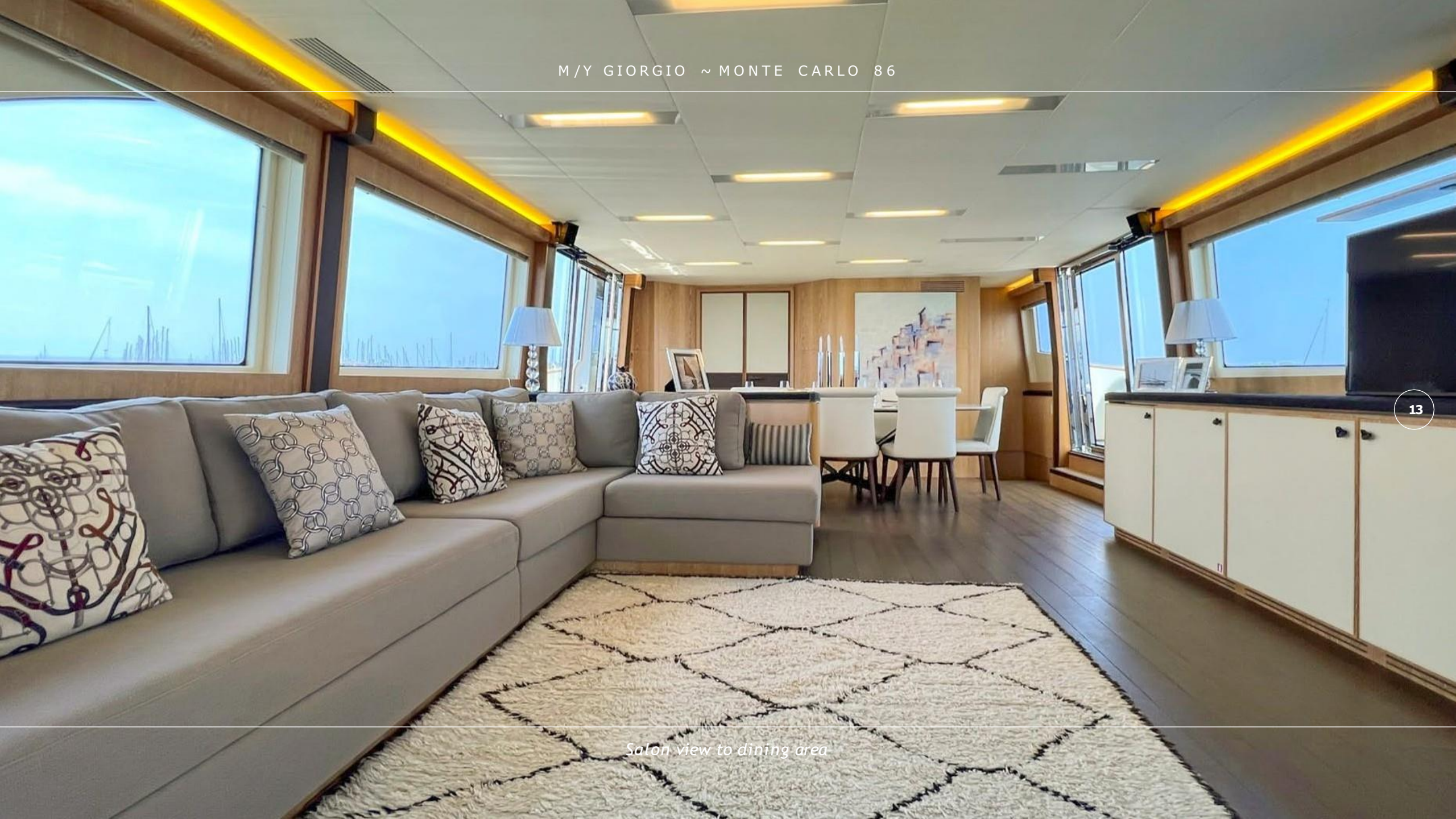
Salon view to dining area