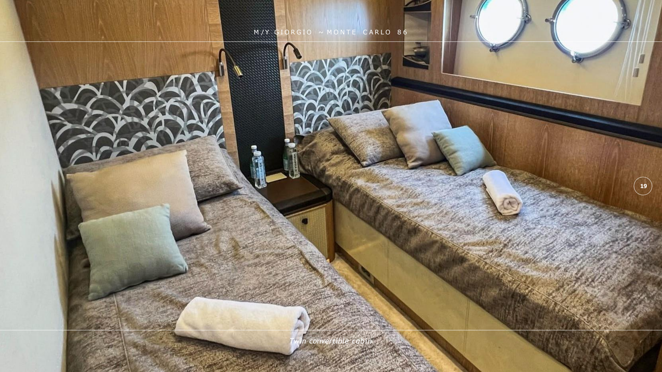
Twin convertible cabin