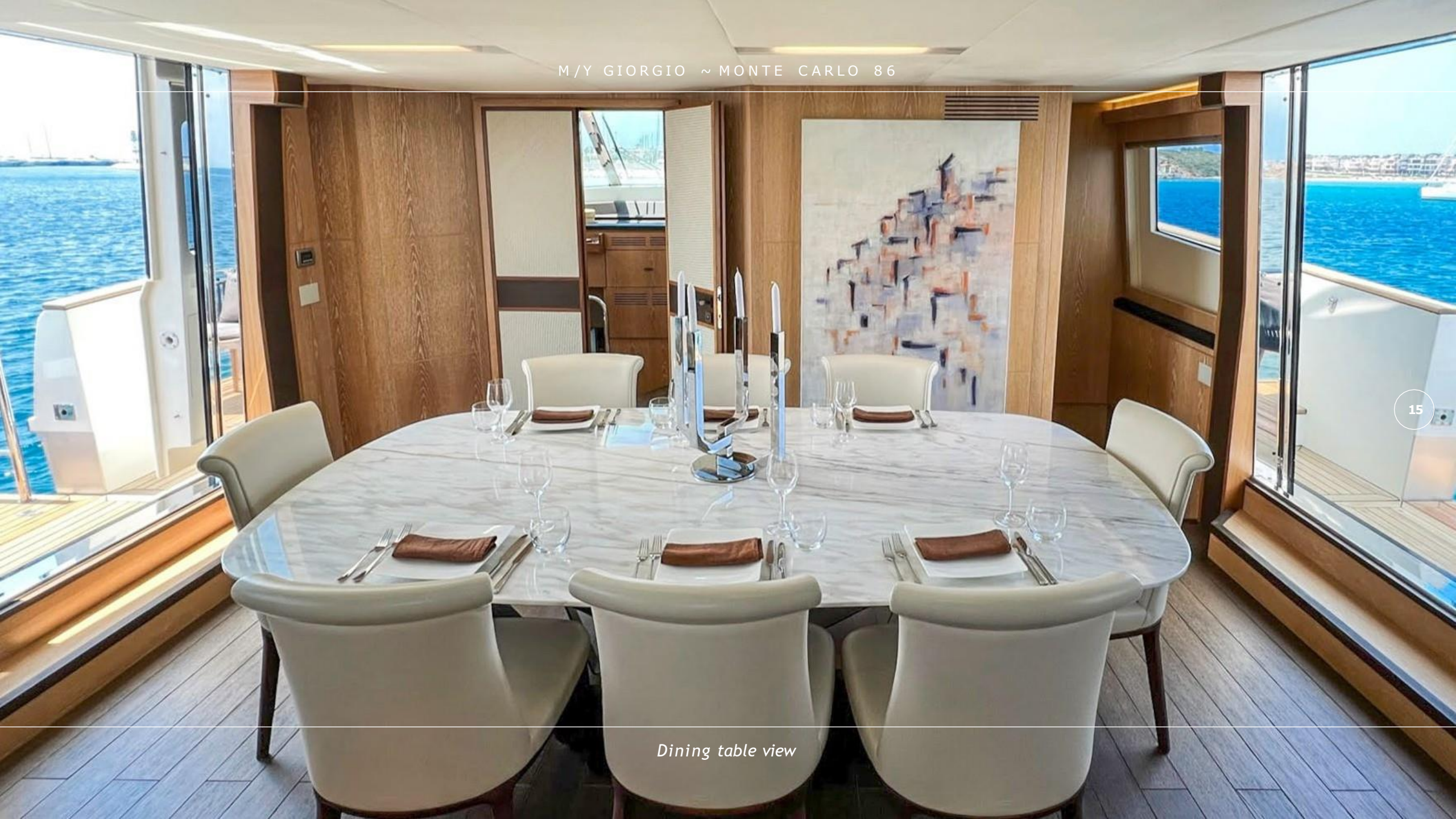
Dining table view