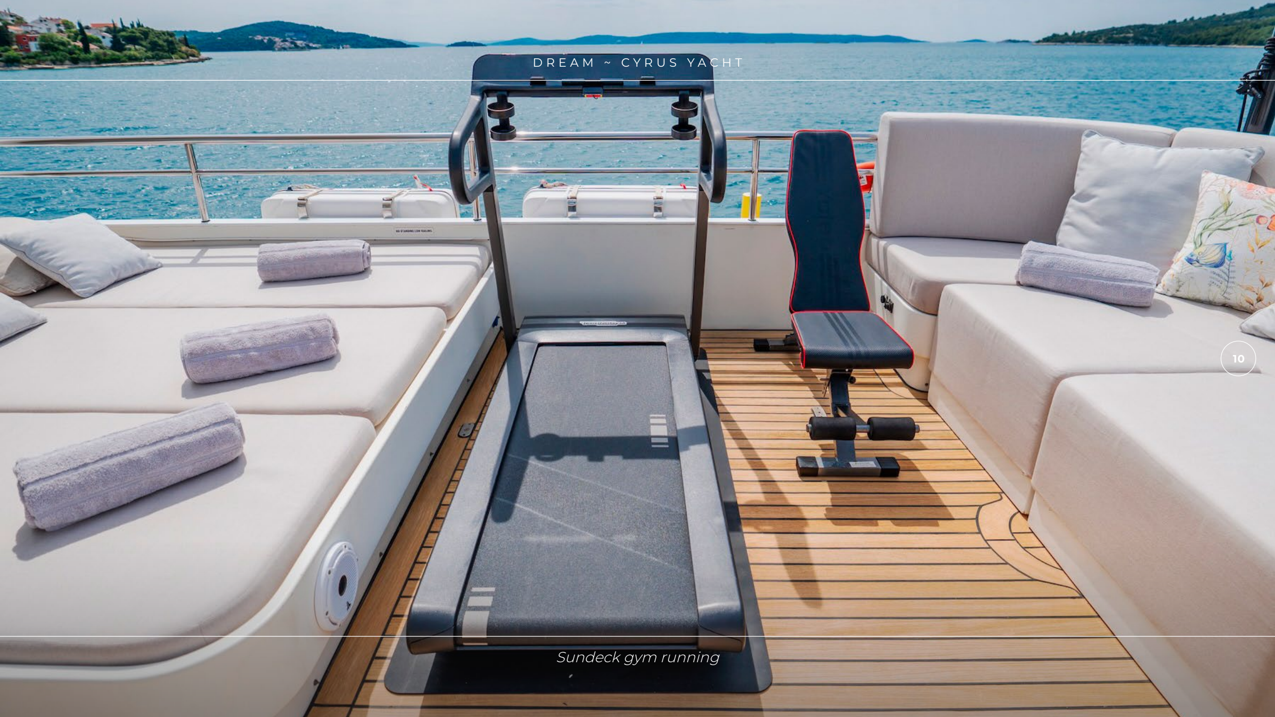
Sundeck gym running