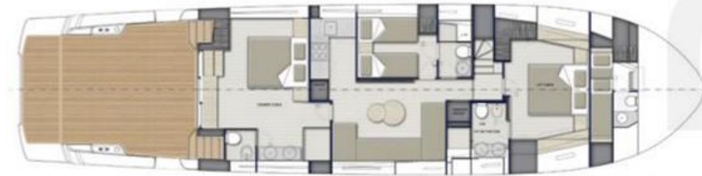
LOWER DECK B