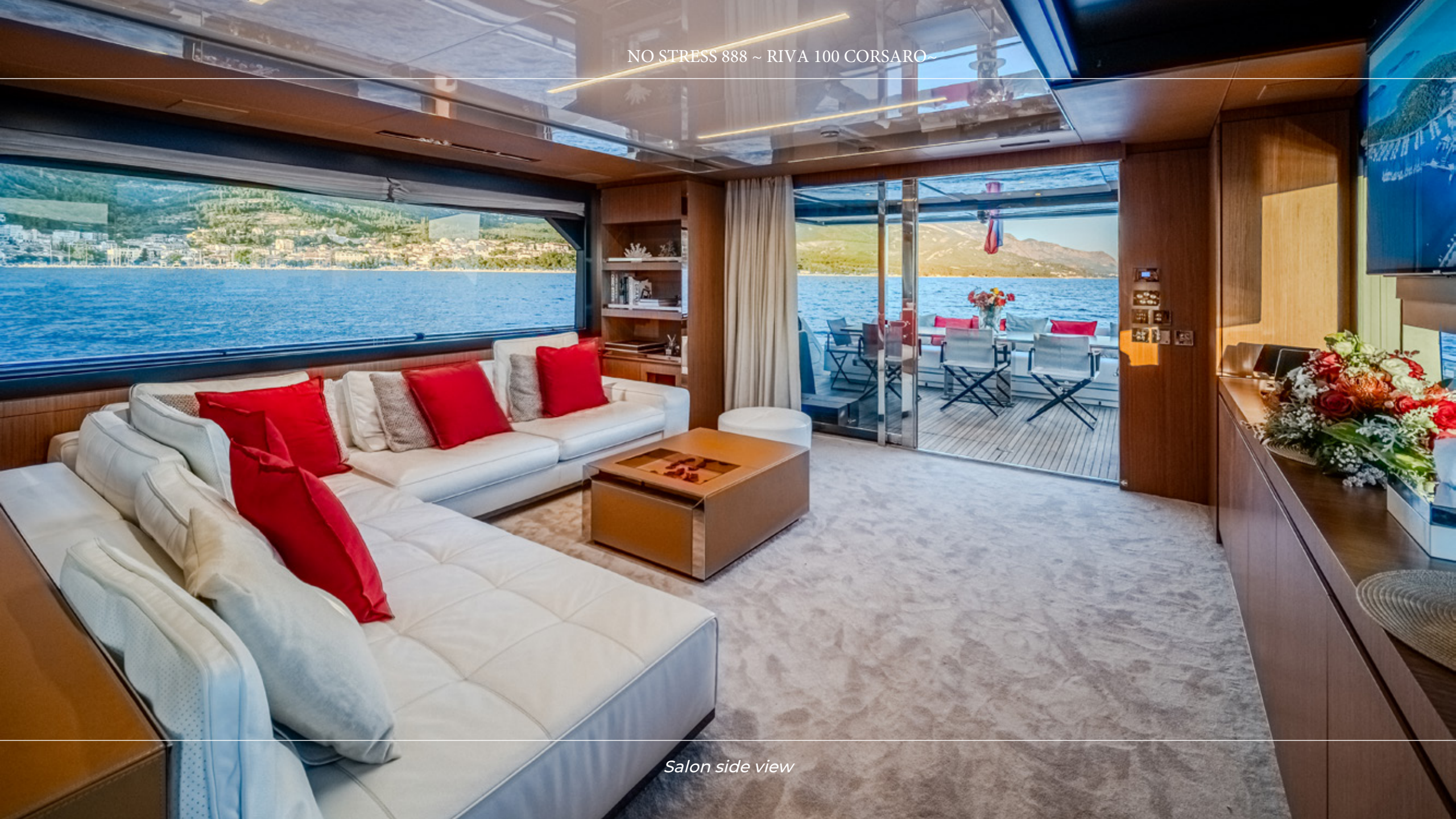
Salon side view