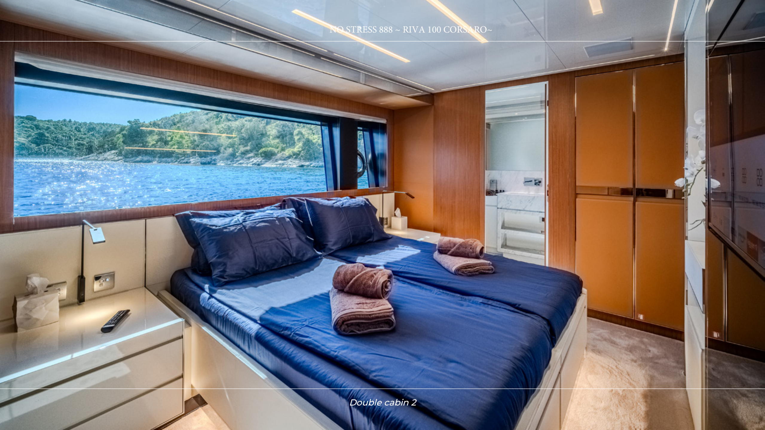
Double cabin 2