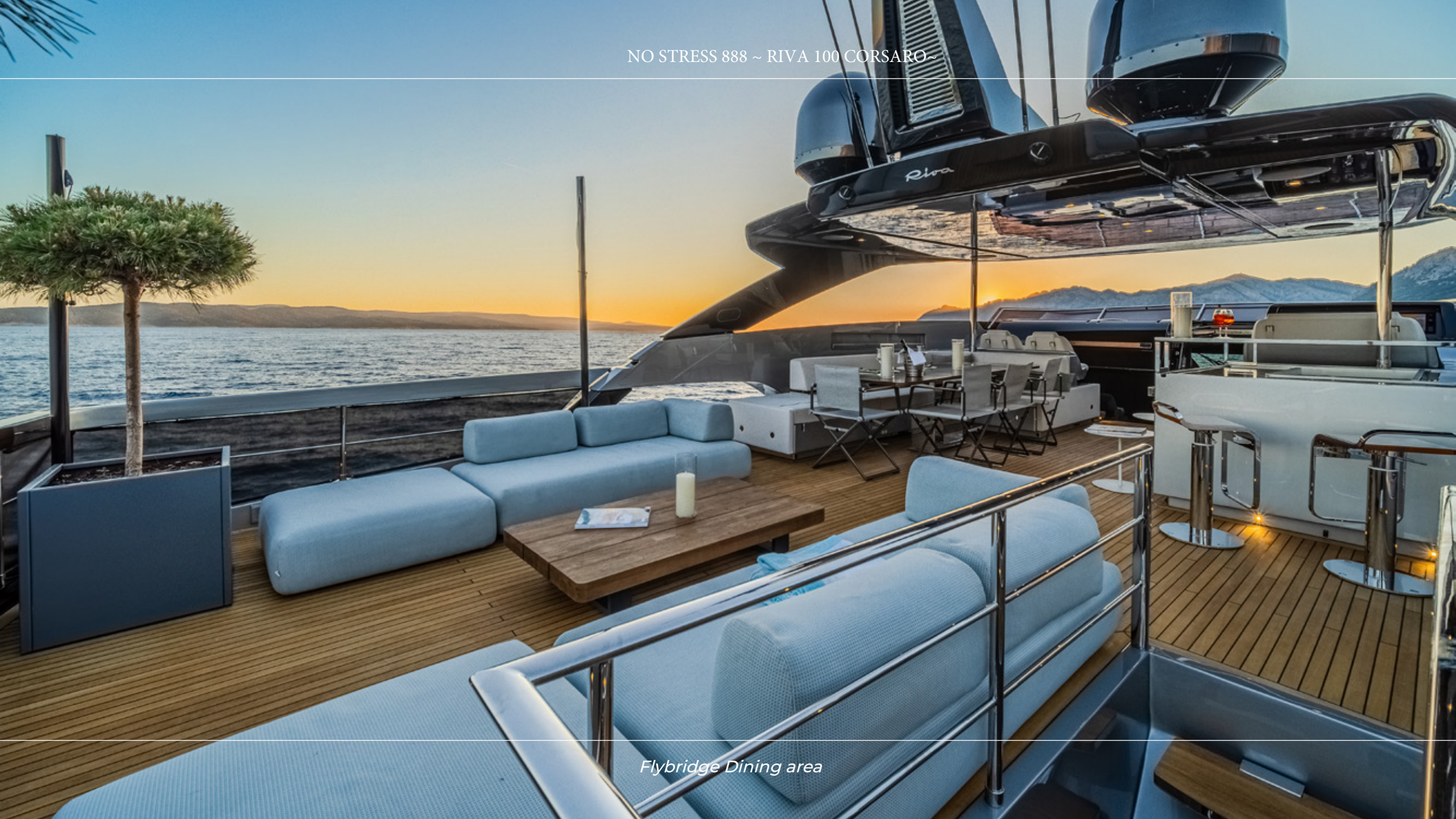
Flybridge Dining area