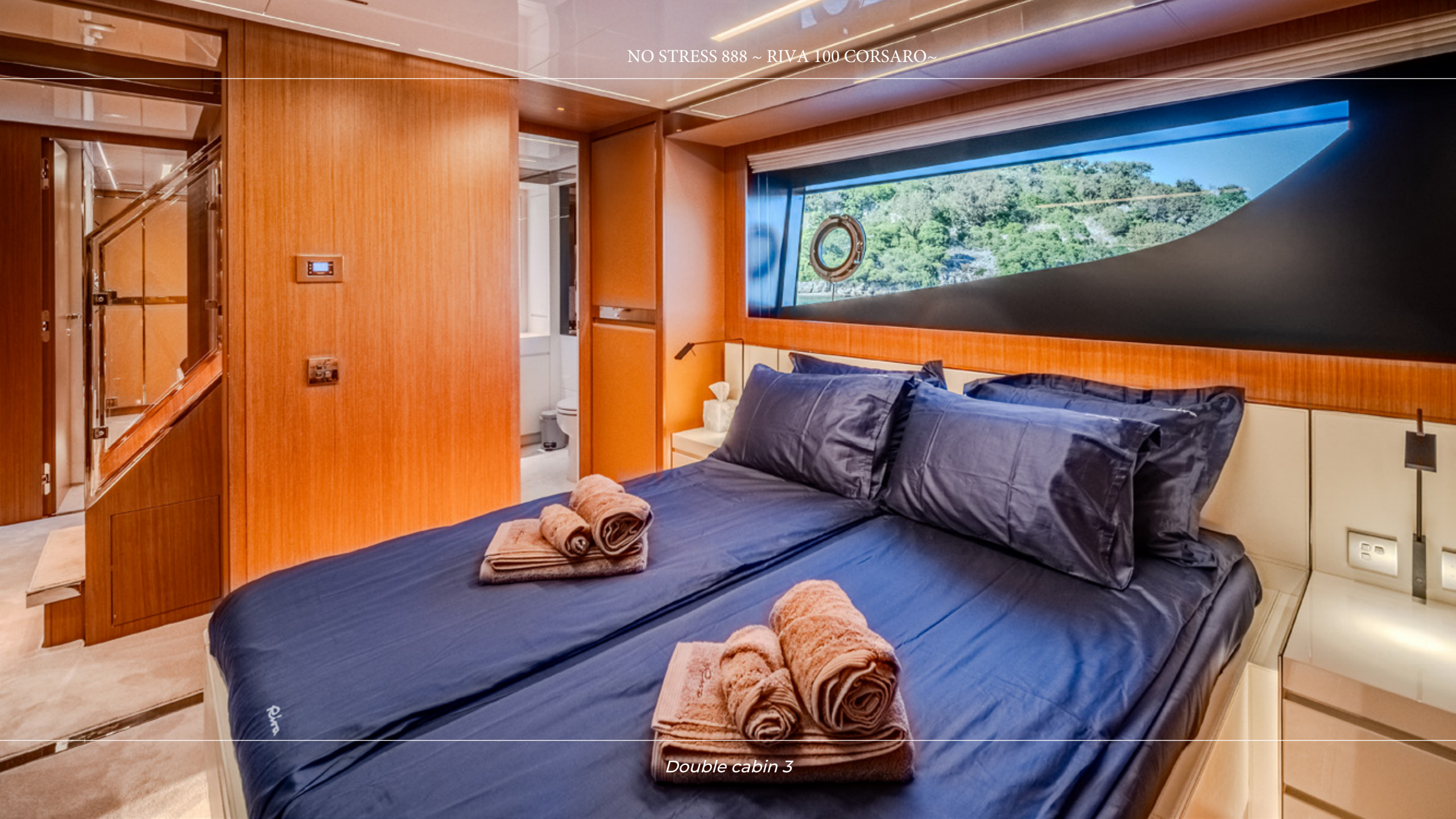
Double cabin 3