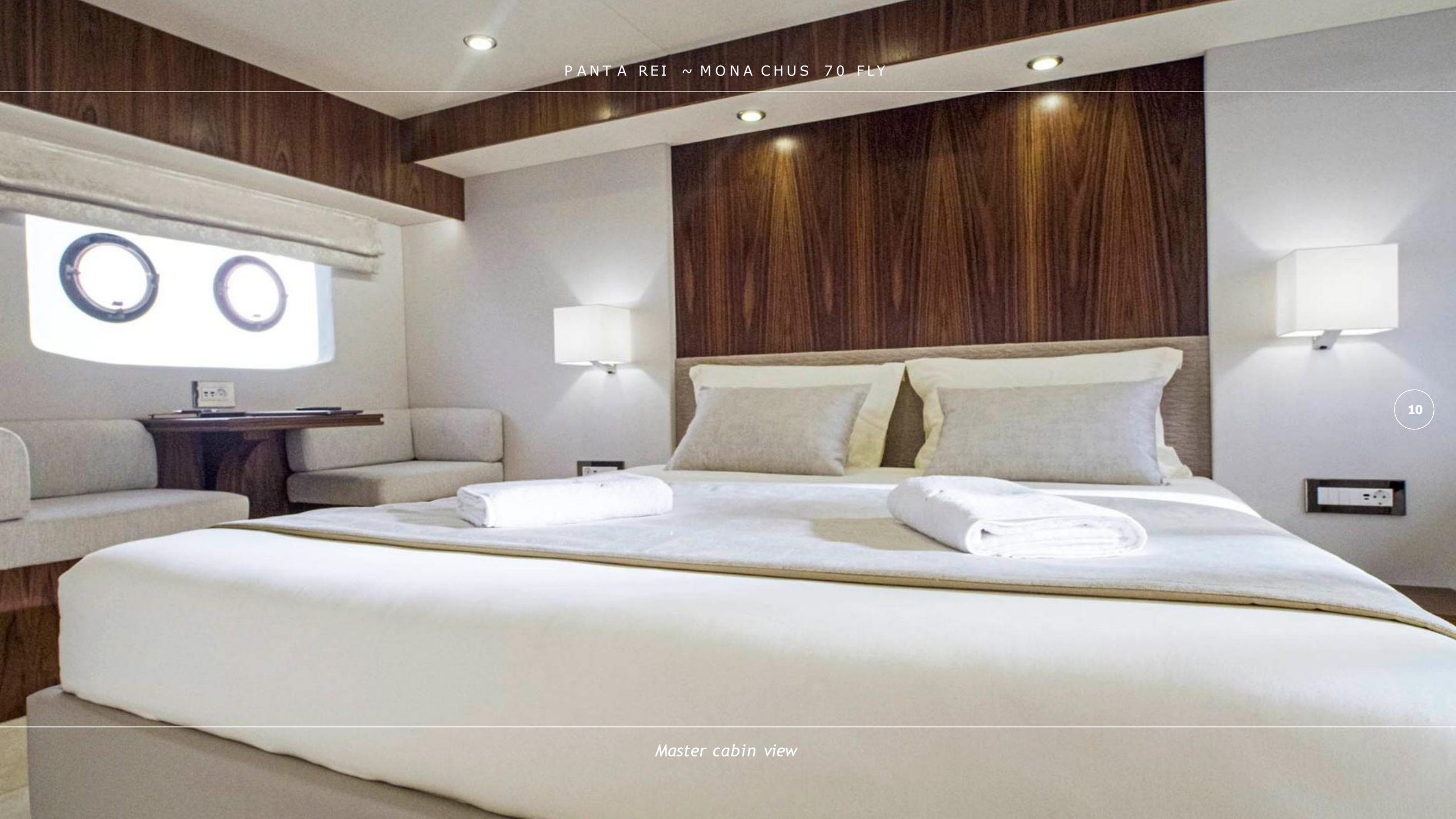
Master cabin view