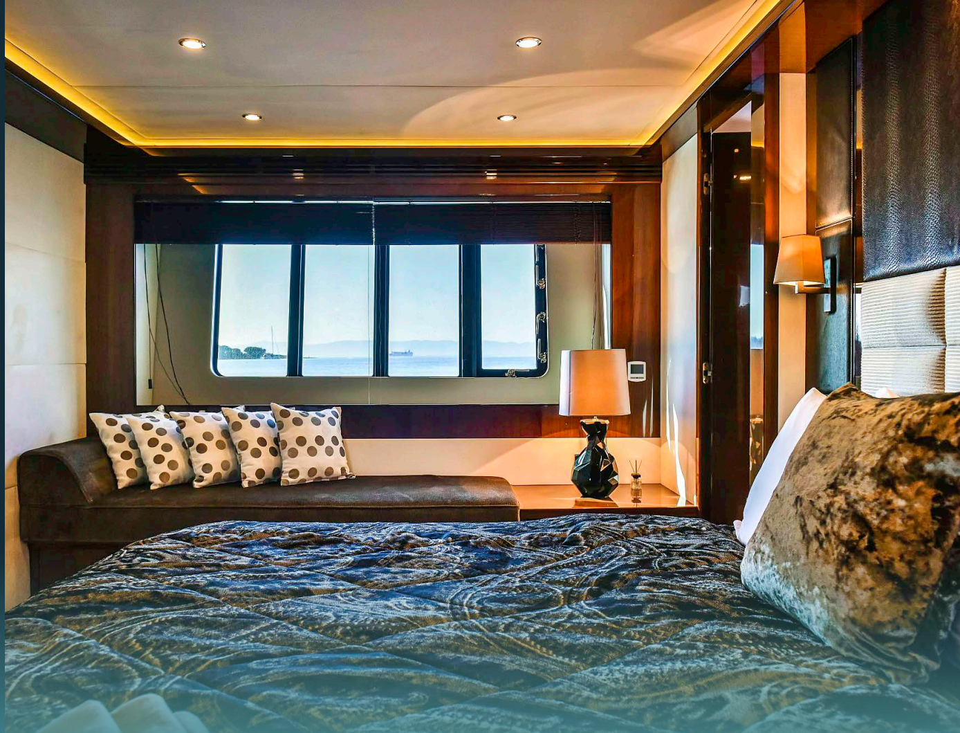
Double cabin view