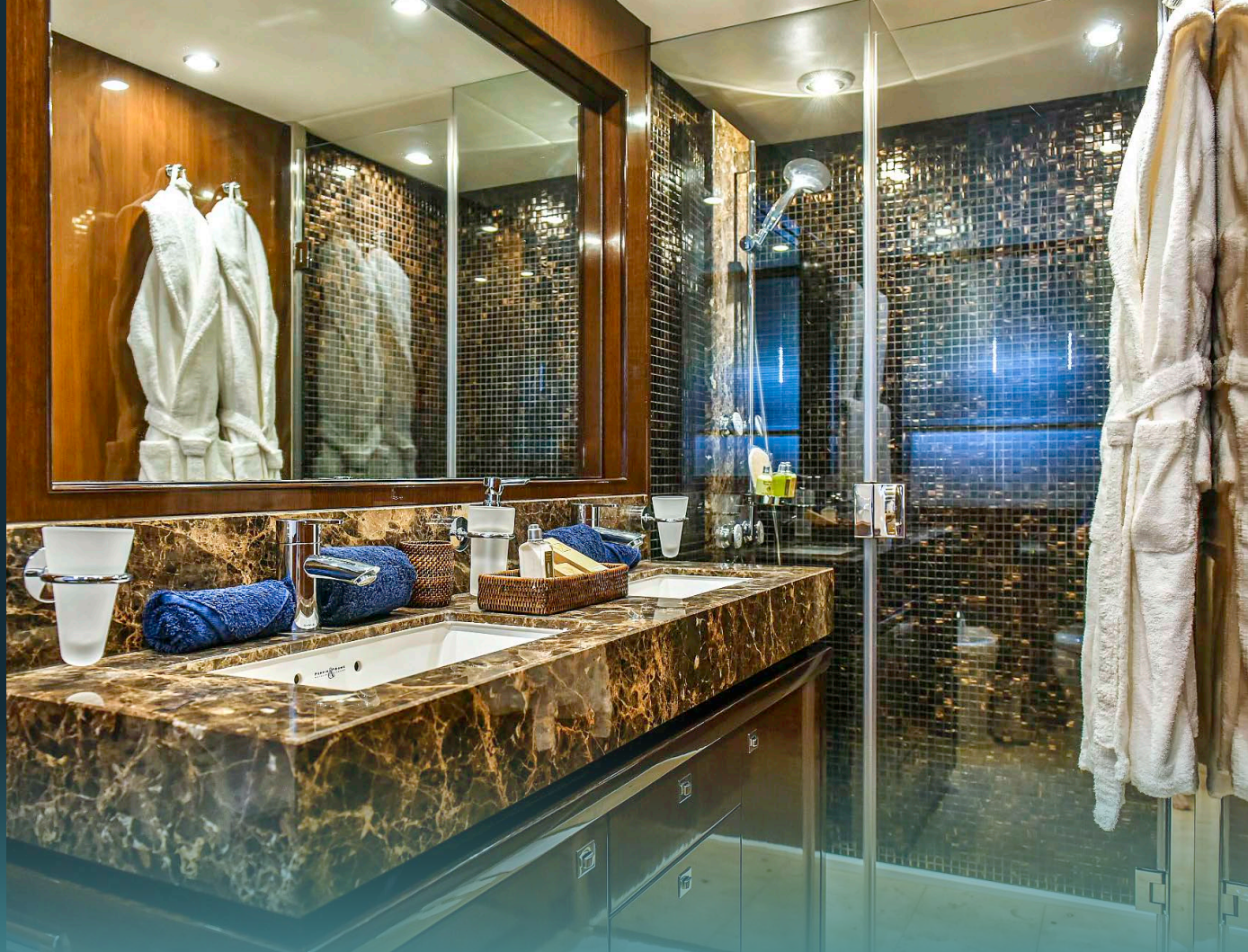
Double cabin bathroom