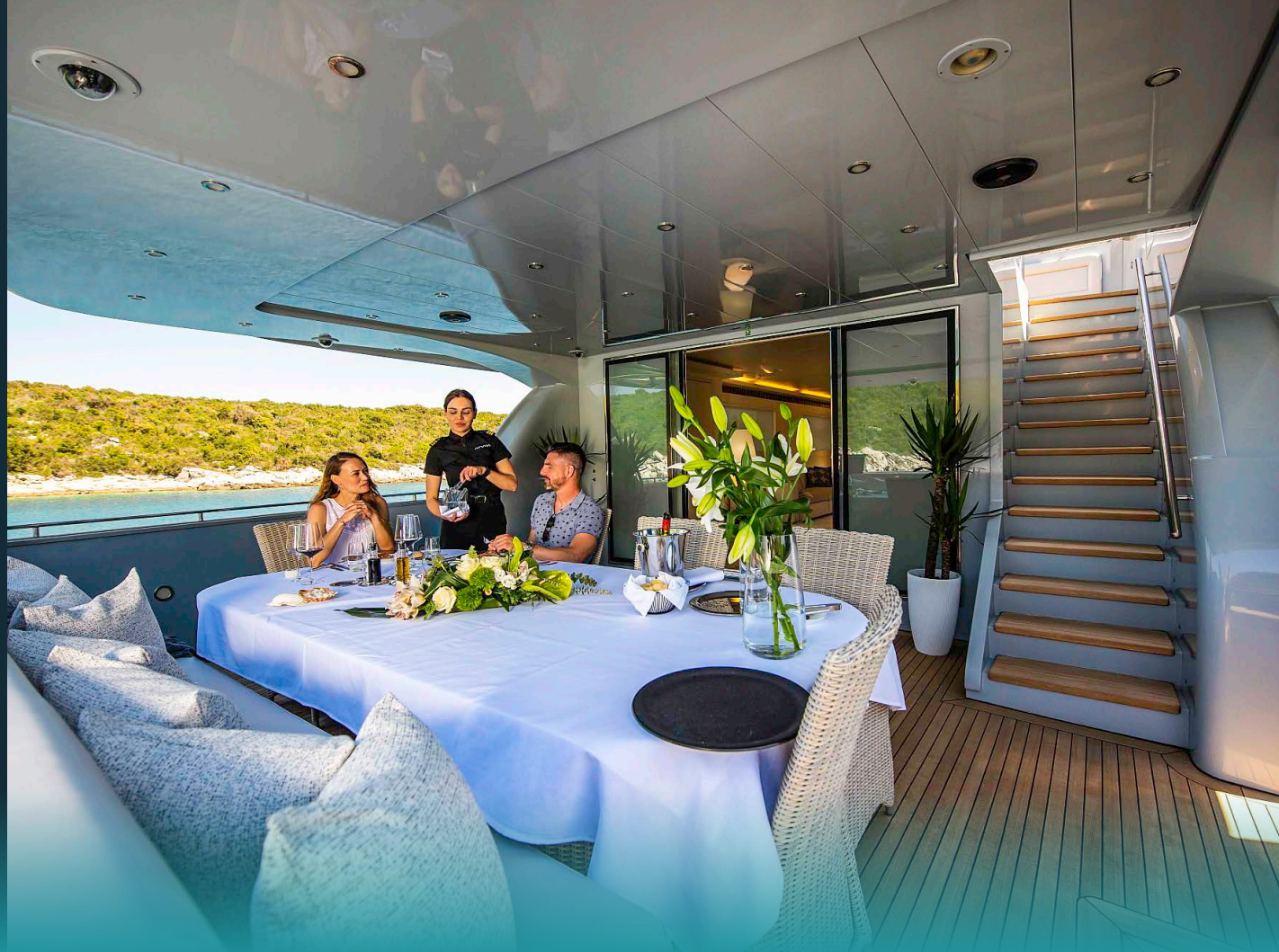
Aft outside dining area