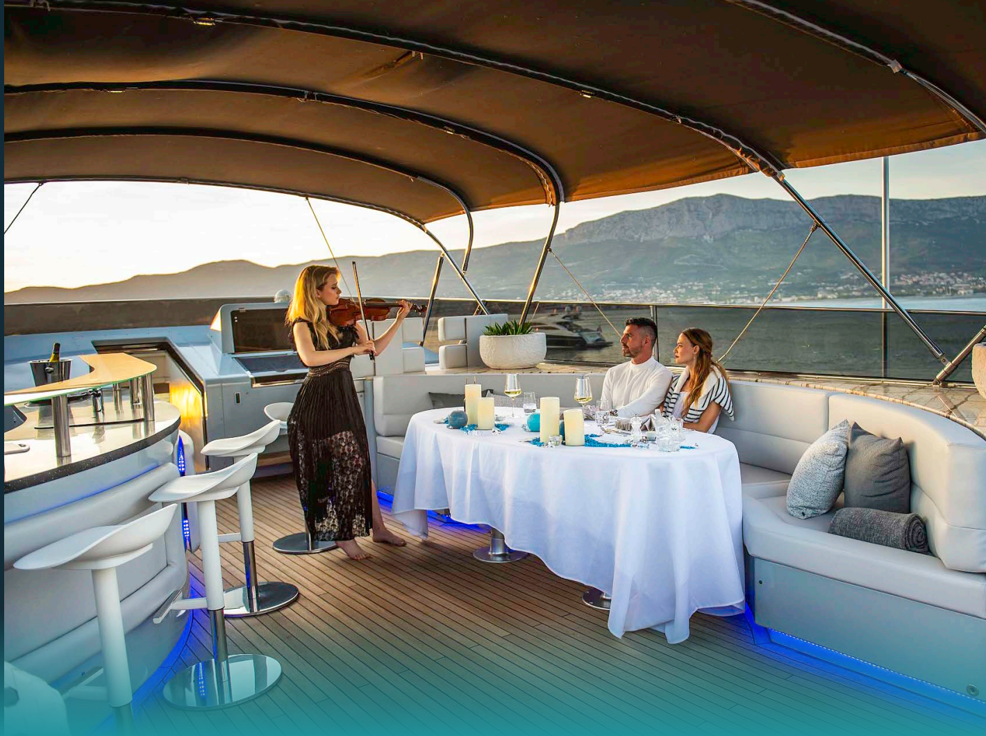
Flybridge dining area