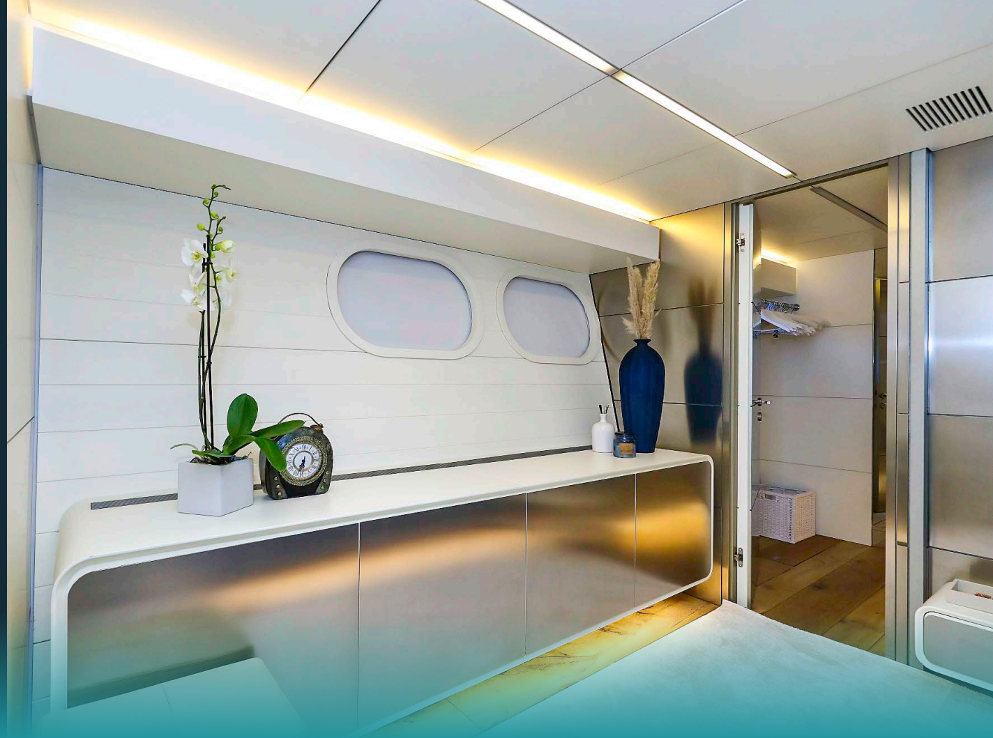
Master cabin detail