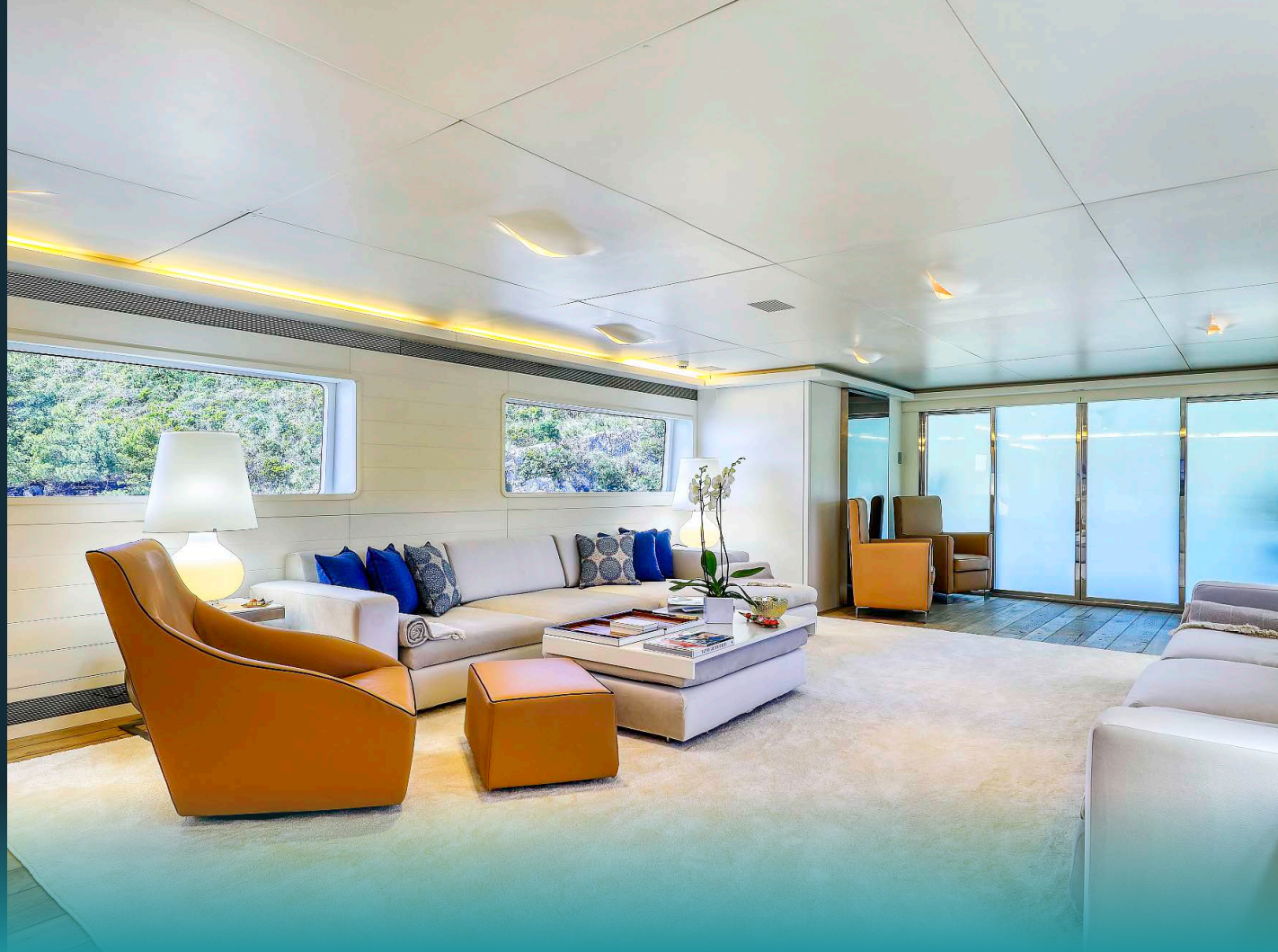
Salon lounging area