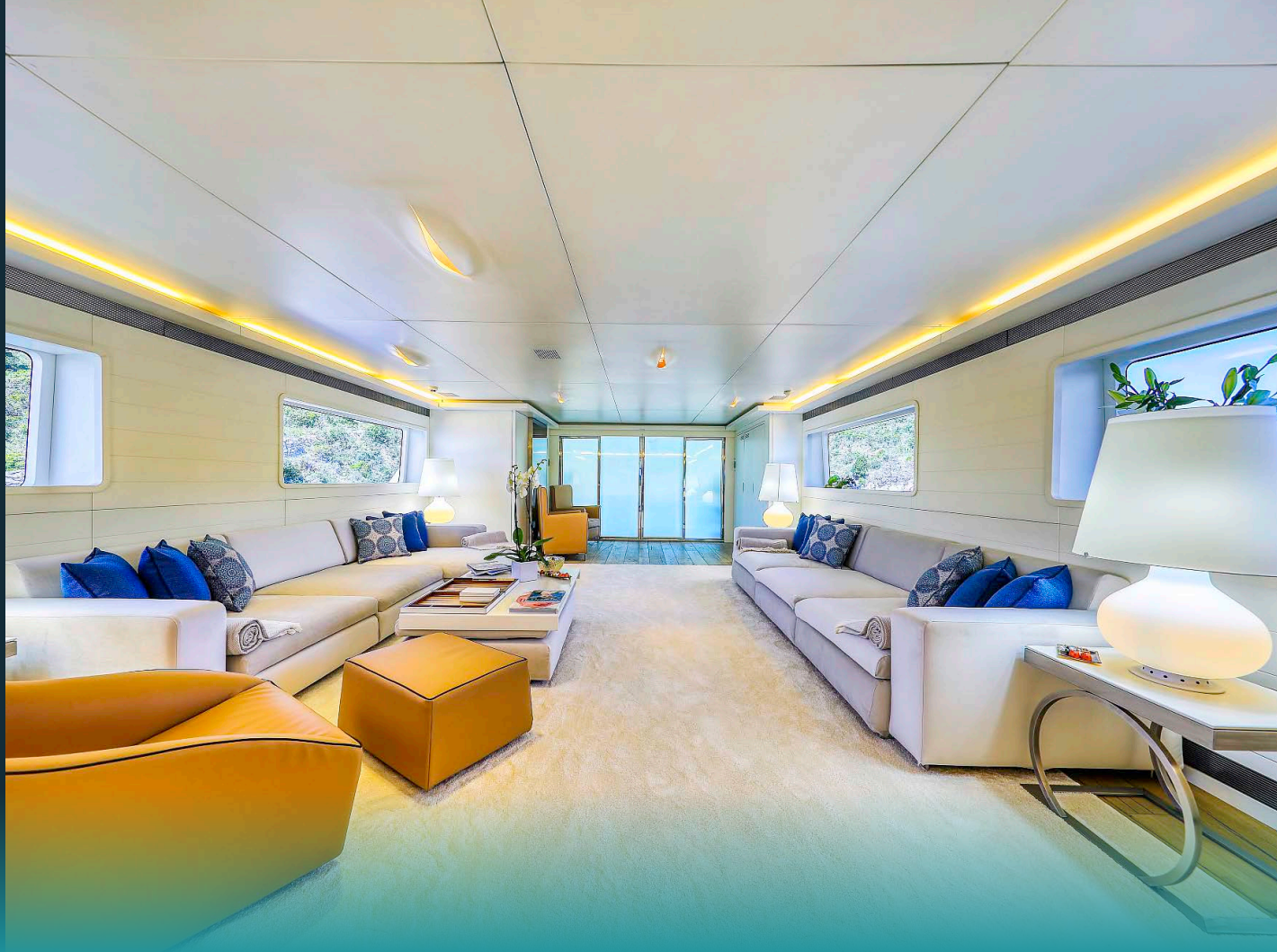
Salon aft view