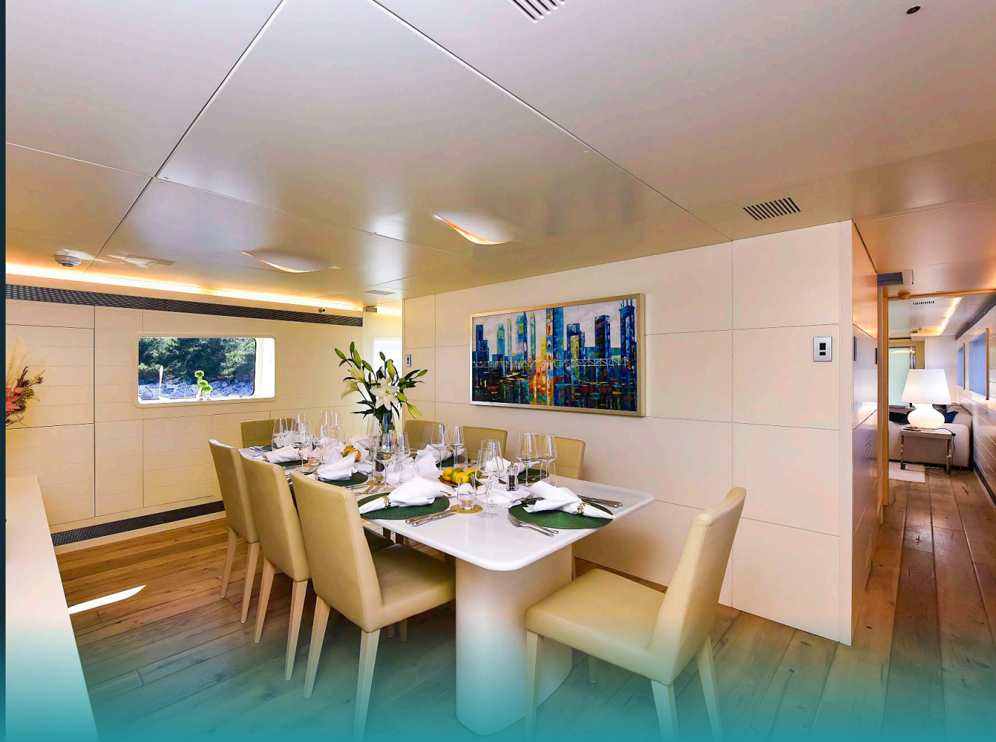
Inside dining area