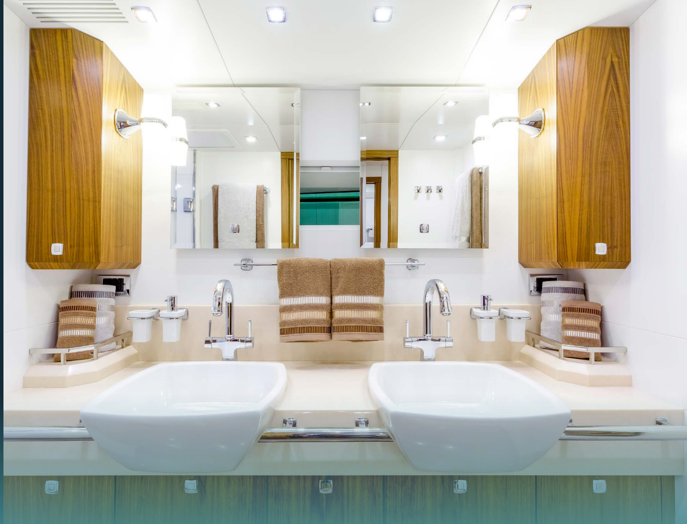
Master cabin bathroom