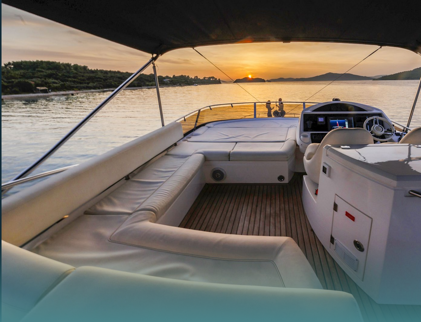
Seating area on the flybridge