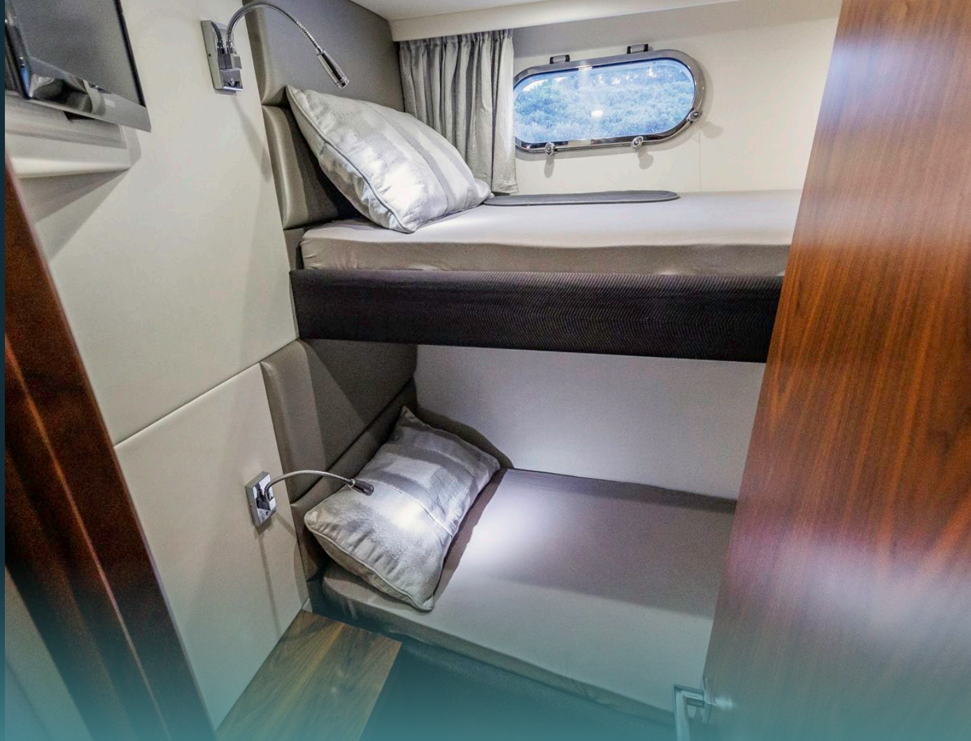
Twin cabin with bunk beds