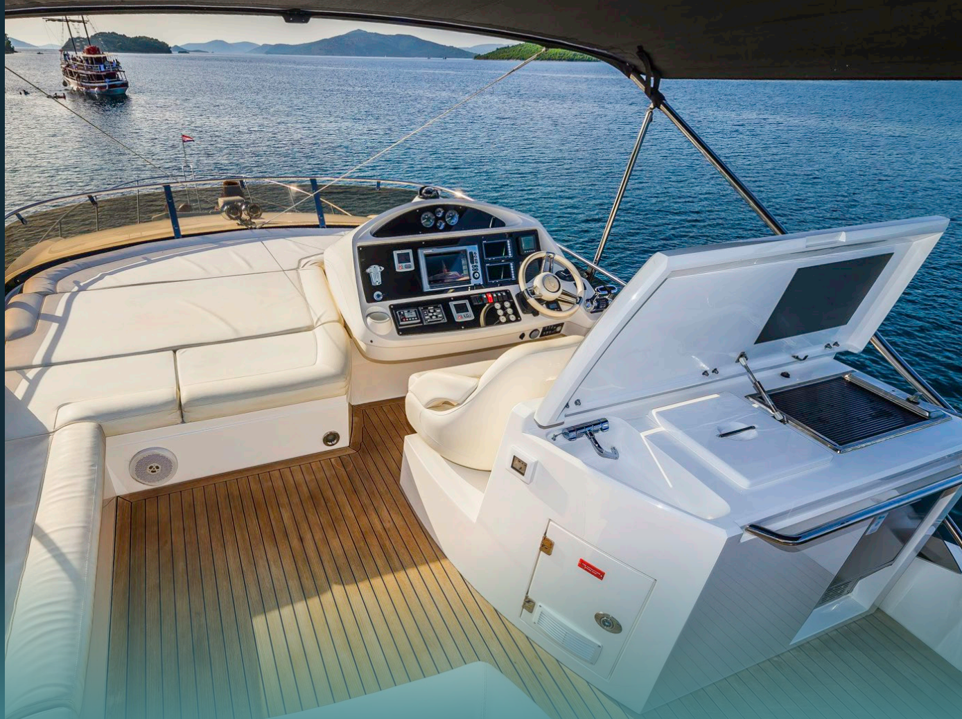
Flybridge with helm station