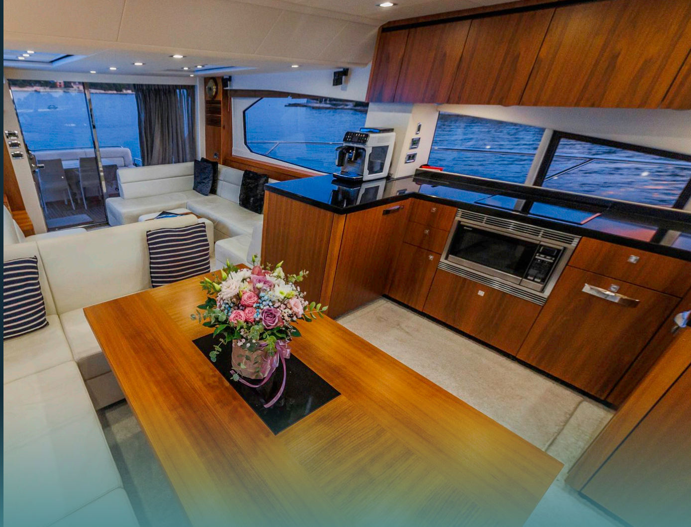
Salon with galley