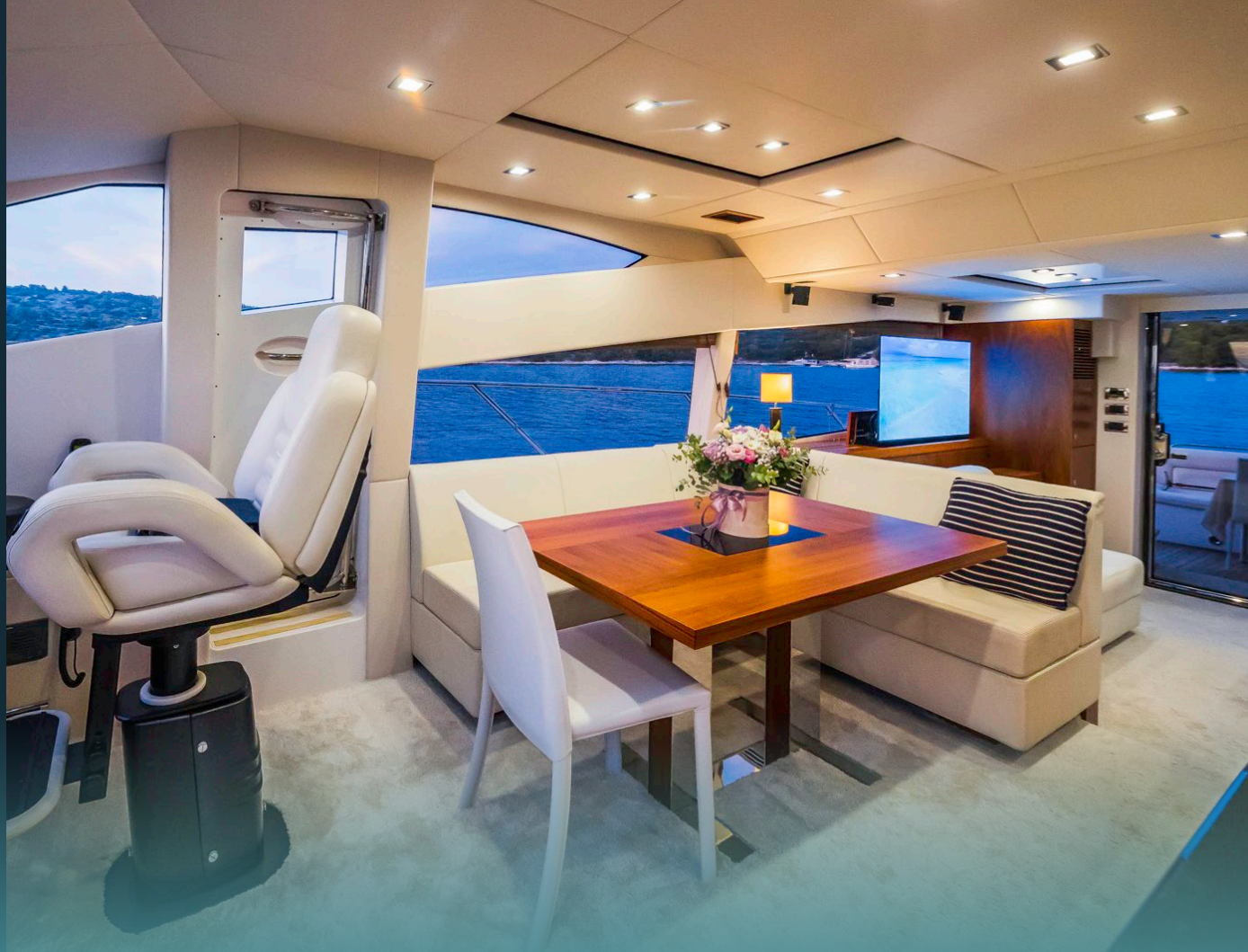
Salon dining table detail