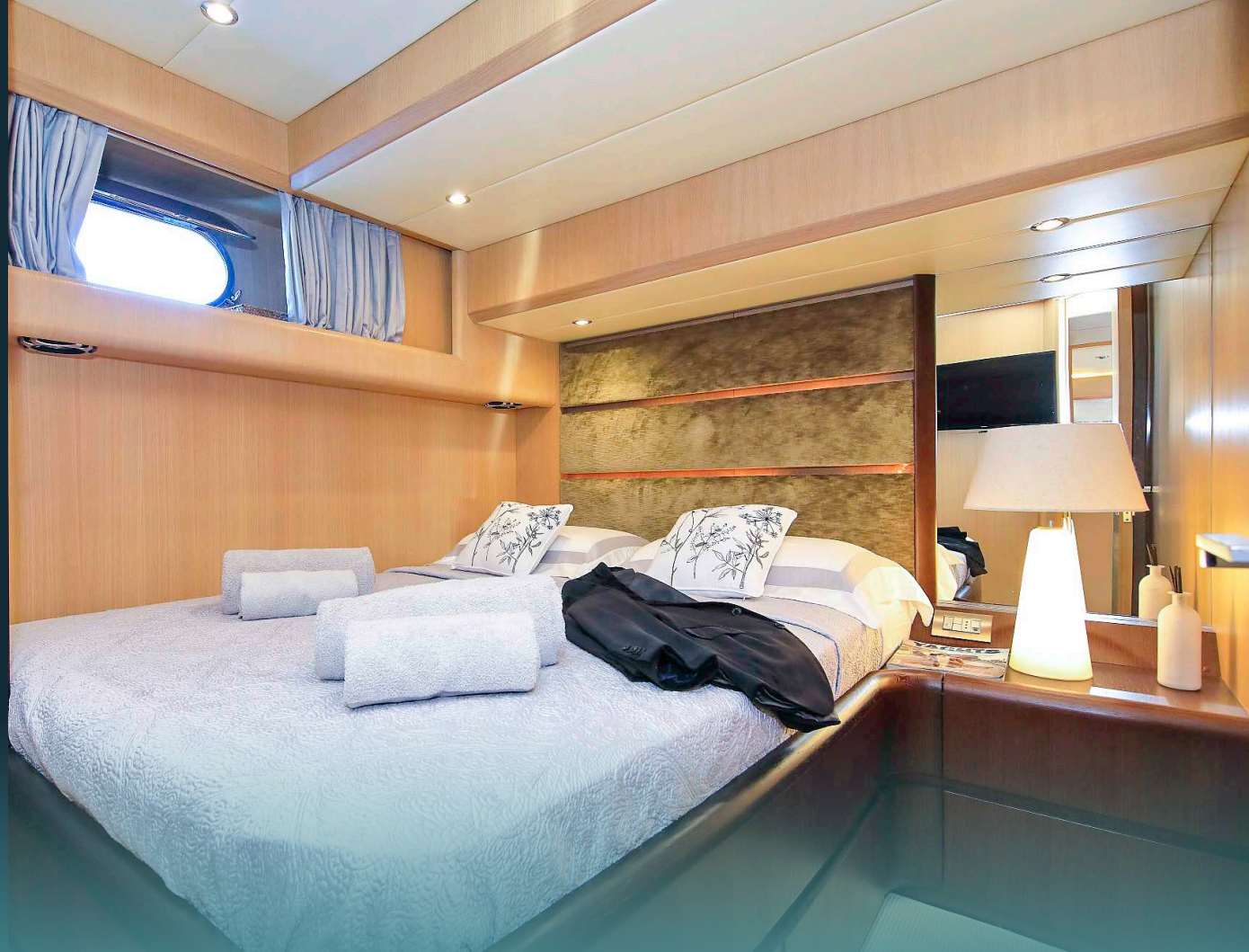
Double cabin 1