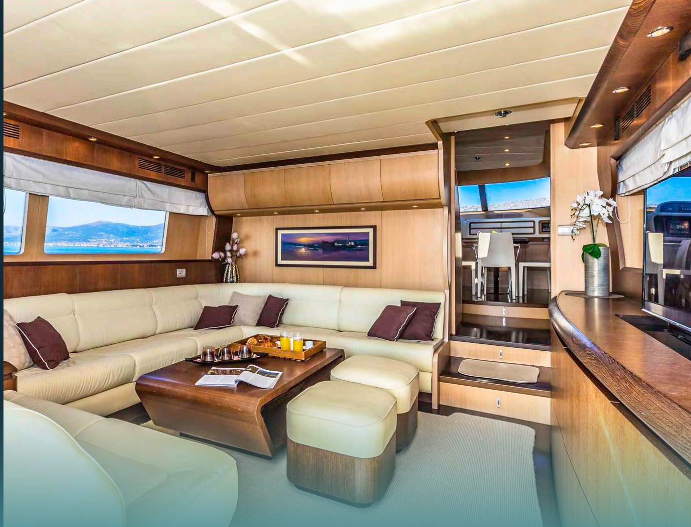
Salon full view