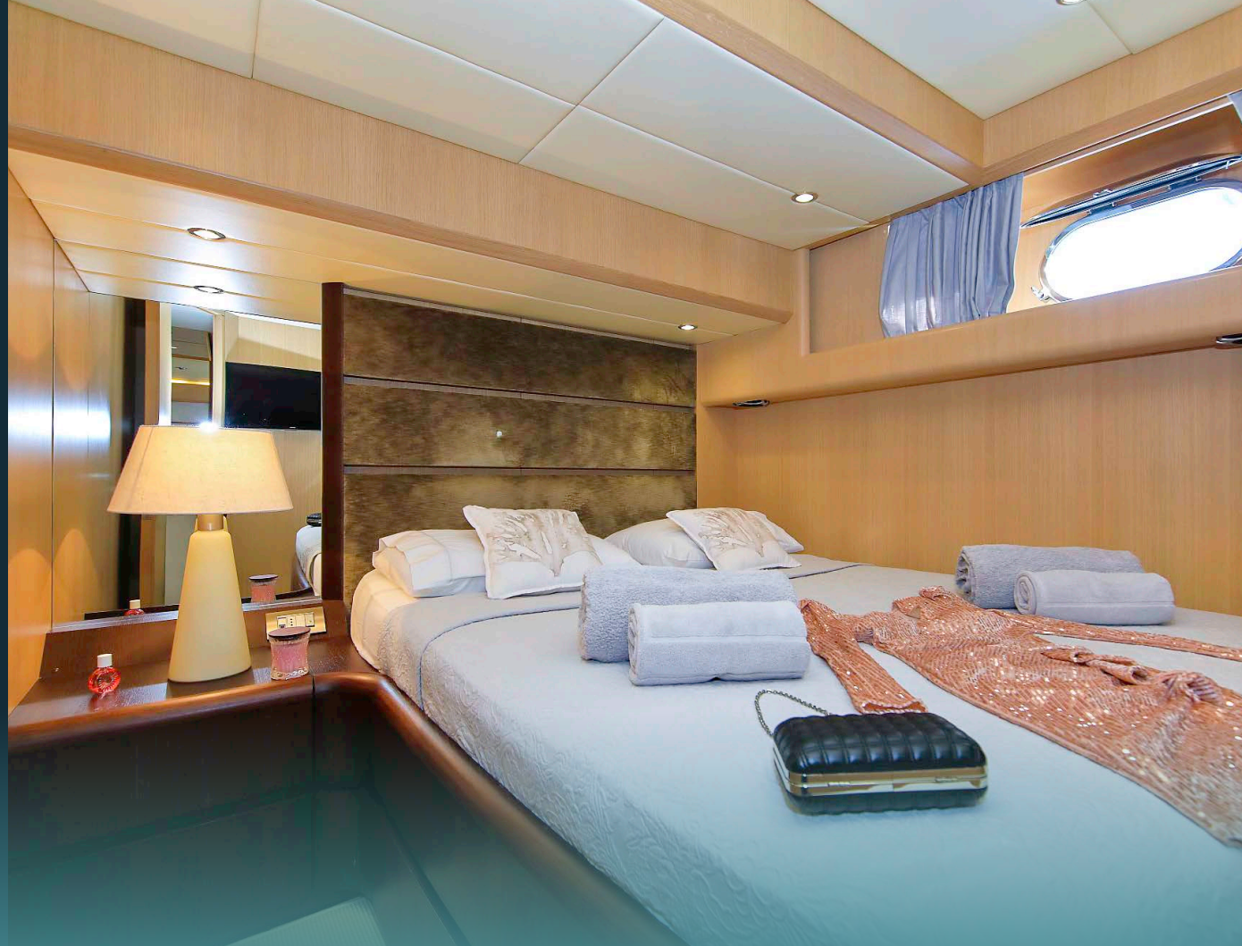
Double cabin 2