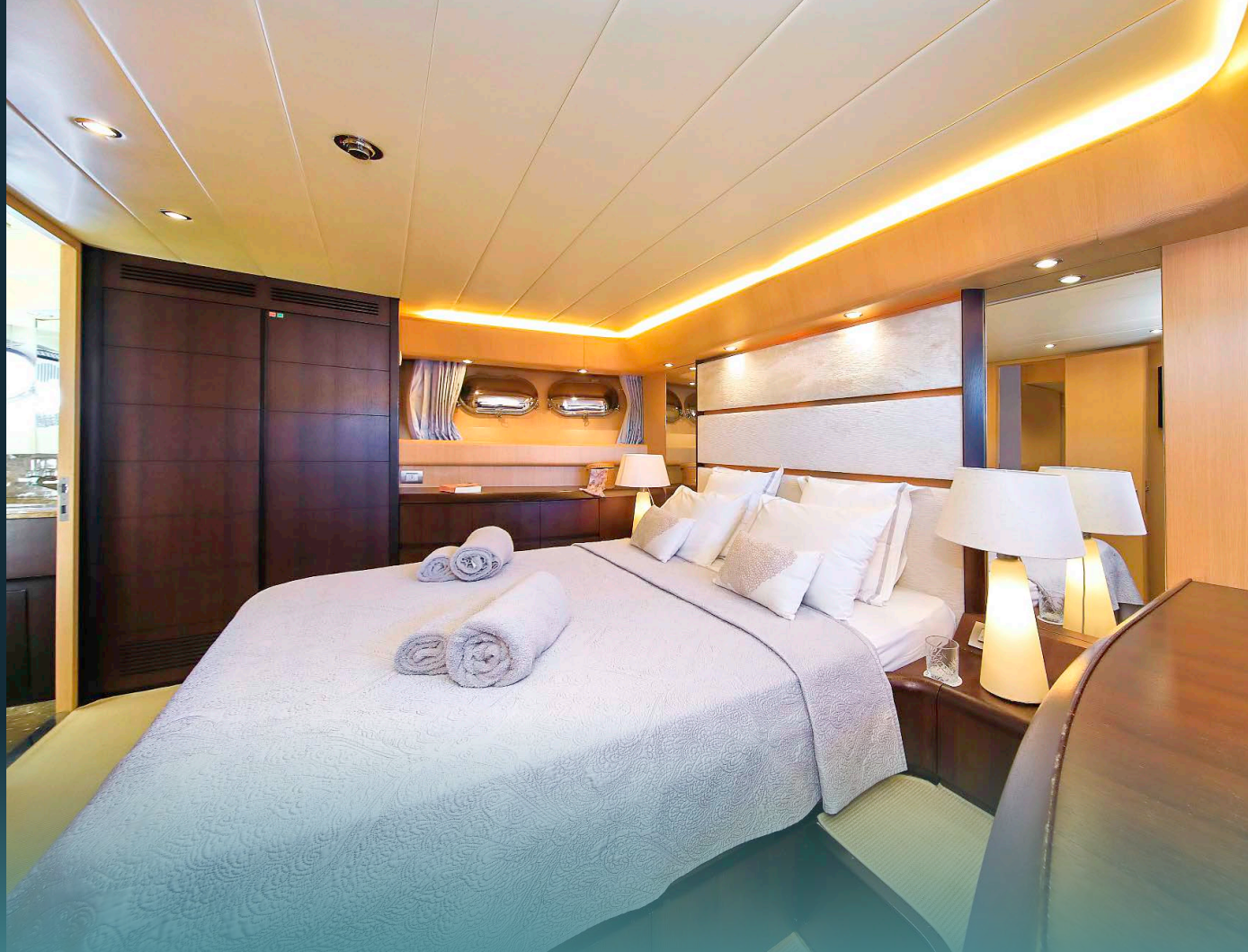
Master cabin side view