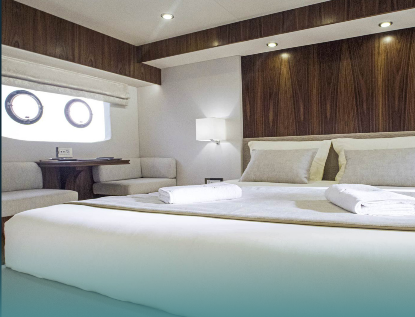
Master cabin view