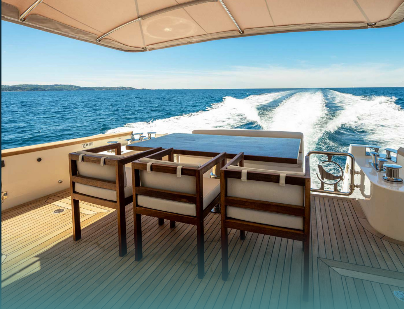
Alfresco table back view