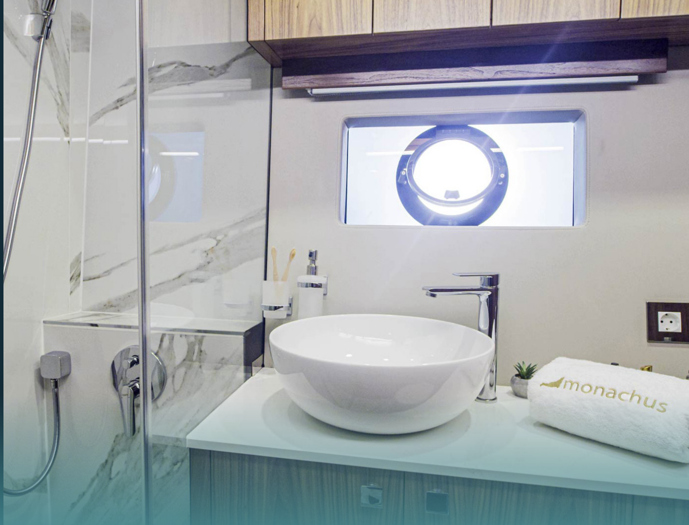
Master cabin bathroom